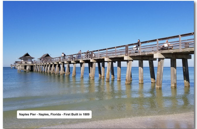
Naples Pier - Naples, Florida - First Built in 1889