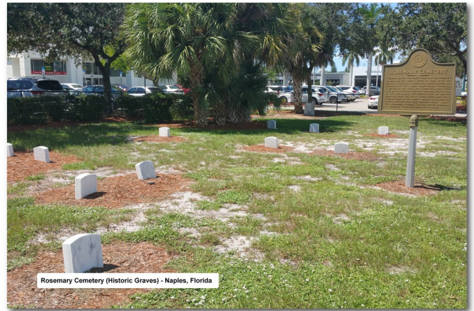
Rosemary Cemetery (Historic Graves) - Naples, Florida