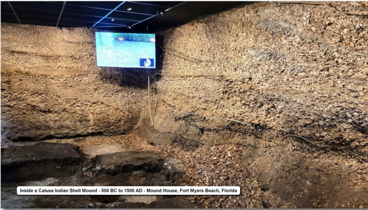
Inside a Calusa Indian Shell Mound - 500 BC to 1500 AD - Mound House, Fort Myers Beach, Florida