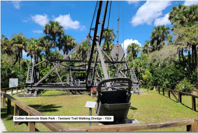
Collier-Seminole State Park - Tamiami Trail Walking Dredge - 1924