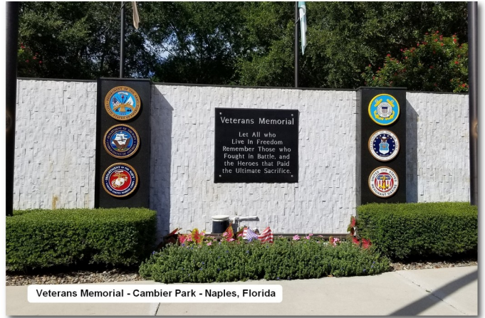
Veterans Memorial - Cambier Park - Naples, Florida