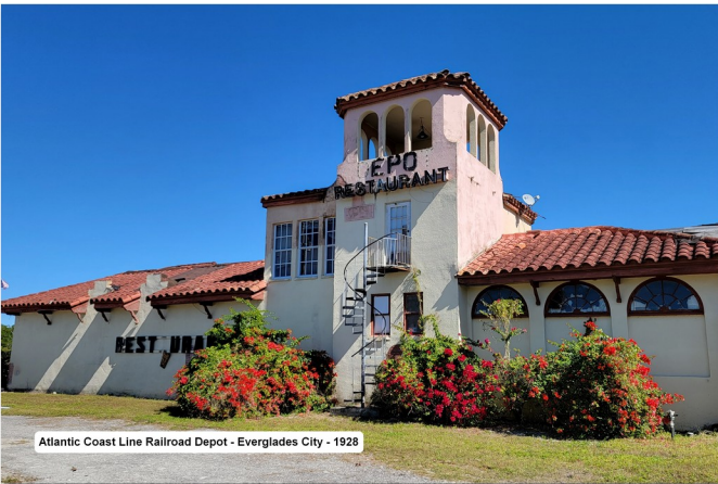
Atlantic Coast Line Railroad Depot - Everglades City - 1928