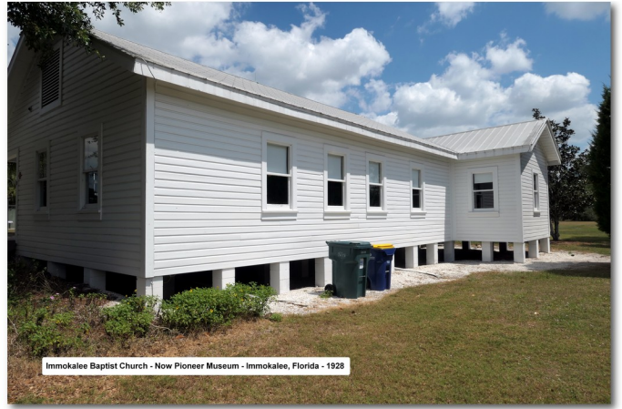
Immokalee Baptist Church - Now Pioneer Museum - Immokalee, Florida - 1928