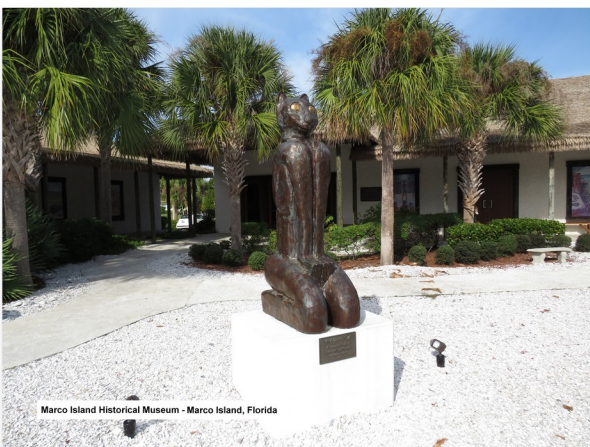
Marco Island Historical Museum - Marco Island, Florida