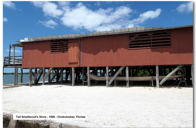
Ted Smallwood's Store - 1906 - Chokoloskee, Florida