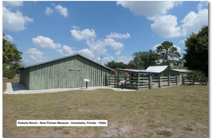
Roberts Ranch - Now Pioneer Museum - Immokalee, Florida - 1920s