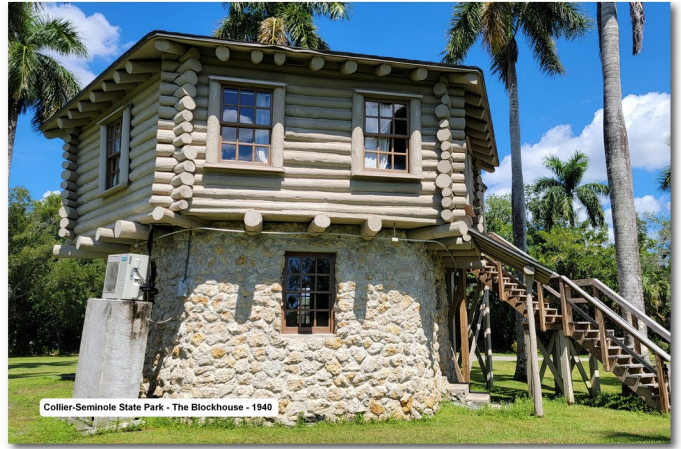
Collier-Seminole State Park - The Blockhouse - 1940