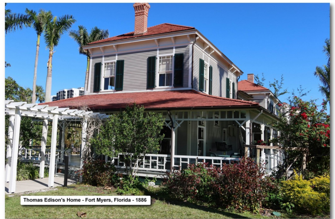
Thomas Edison's Home - Fort Myers, Florida - 1886