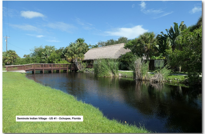
Seminole Indian Village - US 41 - Ochopee, Florida