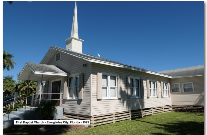
First Baptist Church - Everglades City, Florida - 1923