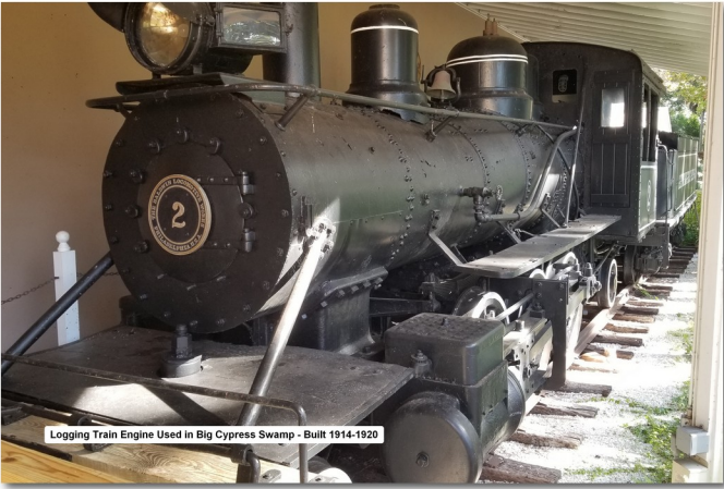
Logging Train Engine Used in Big Cypress Swamp - Built 1914-1920