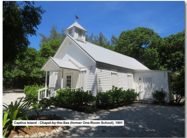
Captiva Island - Chapel-by-the-Sea (former One-Room School), 1901