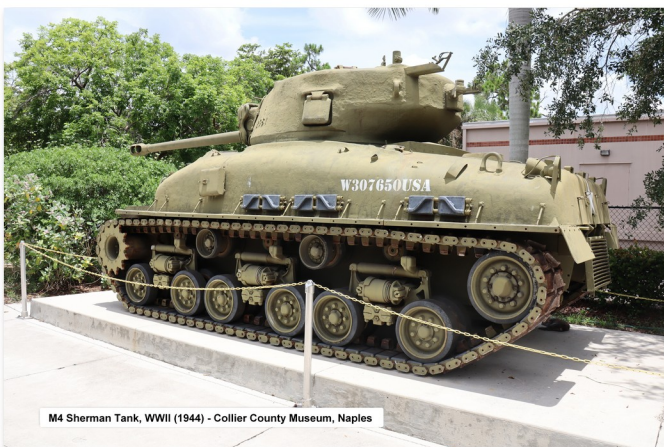
M4 Sherman Tank, WWII (1944) - Collier County Museum, Naples