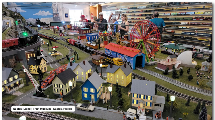
Naples (Lionel) Train Museum - Naples, Florida