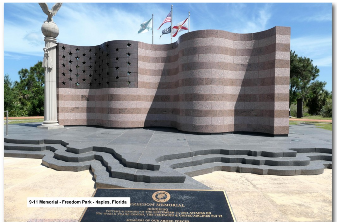
9-11 Memorial - Freedom Park - Naples, Florida