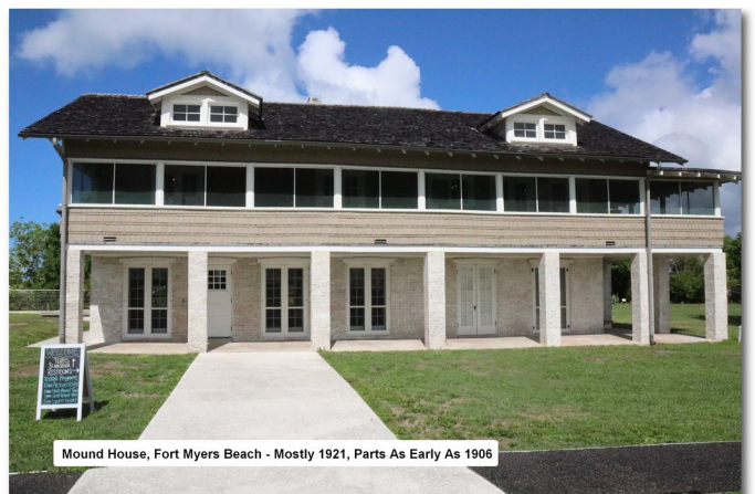
Mound House, Fort Myers Beach - Mostly 1921, Parts As Early As 1906