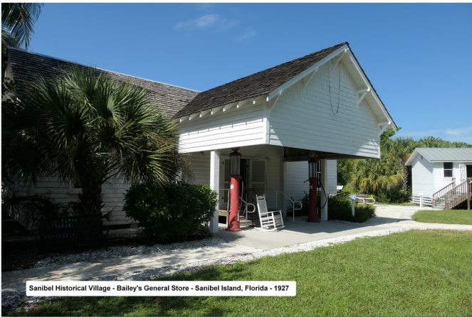
Sanibel Historical Village - Bailey's General Store - Sanibel Island, Florida - 1927