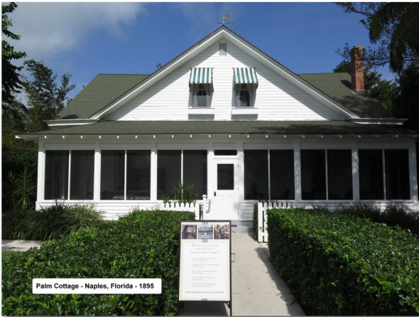
Palm Cottage - Naples, Florida - 1895