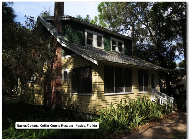
Naples Cottage, Collier County Museum - Naples, Florida