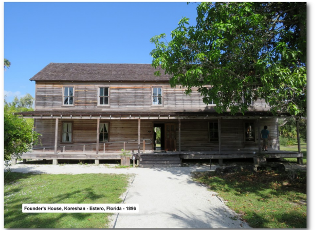
Founder's House, Koreshan - Estero, Florida - 1896