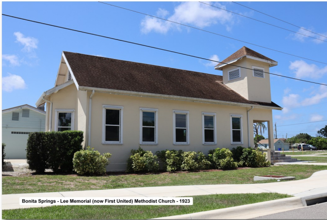
Bonita Springs - Lee Memorial (now First United) Methodist Church - 1923