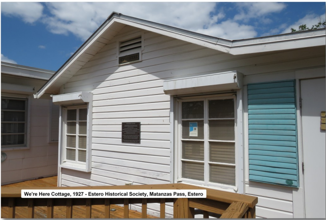
We're Here Cottage, 1927 - Estero Historical Society, Matanzas Pass, Estero