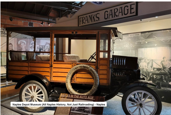
Naples Depot Museum (All Naples History, Not Just Railroading) - Naples