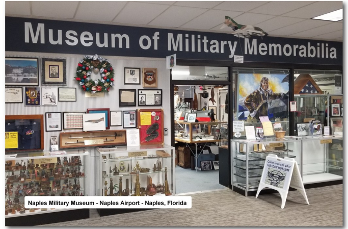
Naples Military Museum - Naples Airport - Naples, Florida