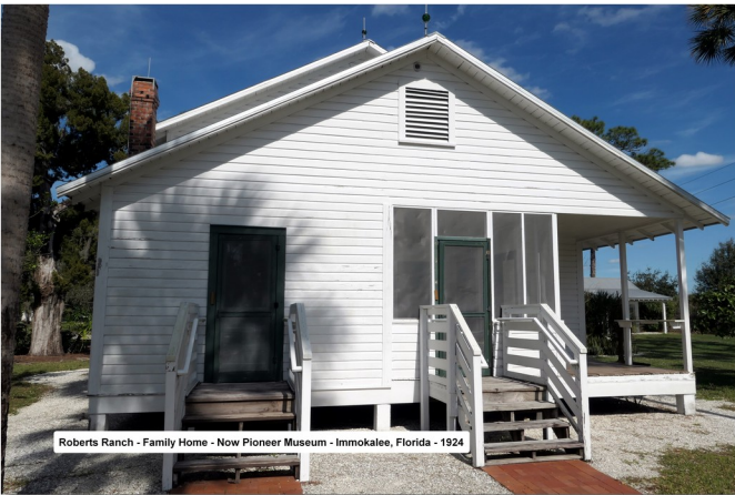
Roberts Ranch - Family Home - Now Pioneer Museum - Immokalee, Florida - 1924