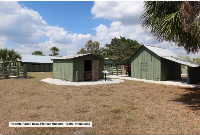
Roberts Ranch (Now Pioneer Museum) 1920s, Immokalee