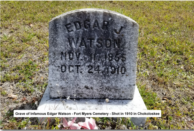
Grave of Infamous Edgar Watson - Fort Myers Cemetery - Shot in 1910 in Chokoloskee