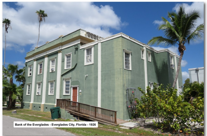
Bank of the Everglades - Everglades City, Florida - 1926