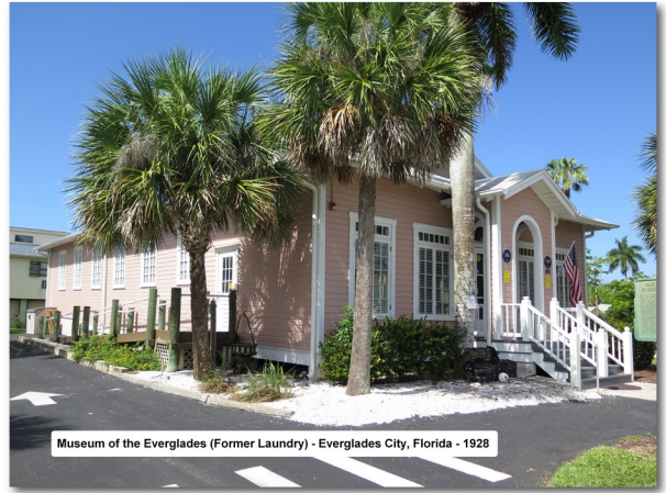
Museum of the Everglades (Former Laundry) - Everglades City, Florida - 1928