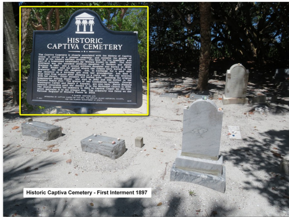
Historic Captiva Cemetery - First Interment 1897