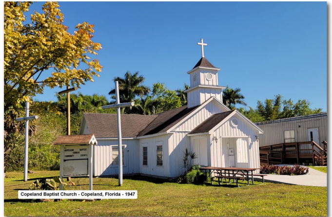
Copeland Baptist Church - Copeland, Florida - 1947