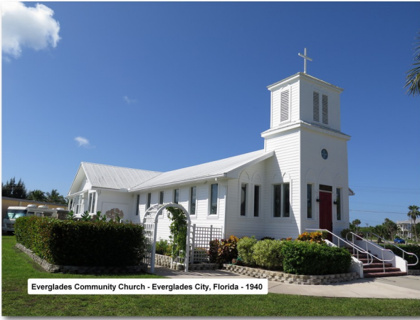
Everglades Community Church - Everglades City, Florida - 1940