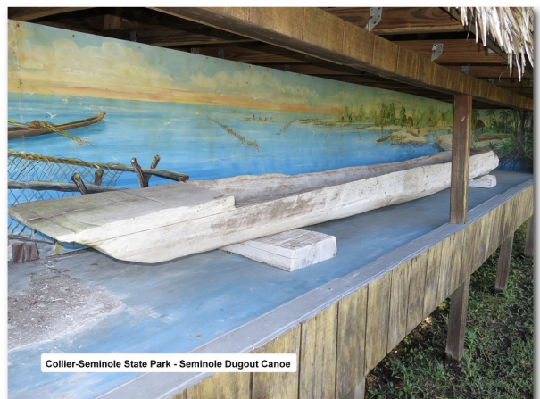
Collier-Seminole State Park - Seminole Dugout Canoe