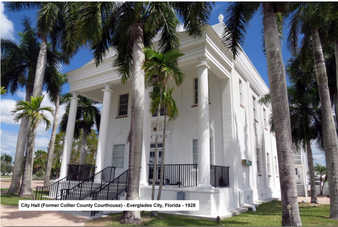
City Hall (Former Collier County Courthouse) - Everglades City, Florida - 1928