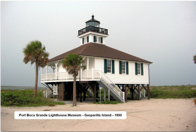
Port Boca Grande Lighthouse Museum - Gasparilla Island - 1890