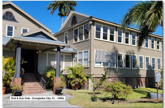
Rod & Gun Club - Everglades City, FL - 1890s