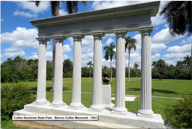
Collier-Seminole State Park - Barron Collier Memorial - 1941