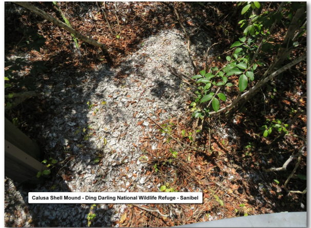
Calusa Shell Mound - Ding Darling National Wildlife Refuge - Sanibel