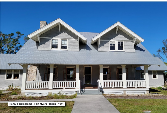
Henry Ford's Home - Fort Myers Florida - 1911