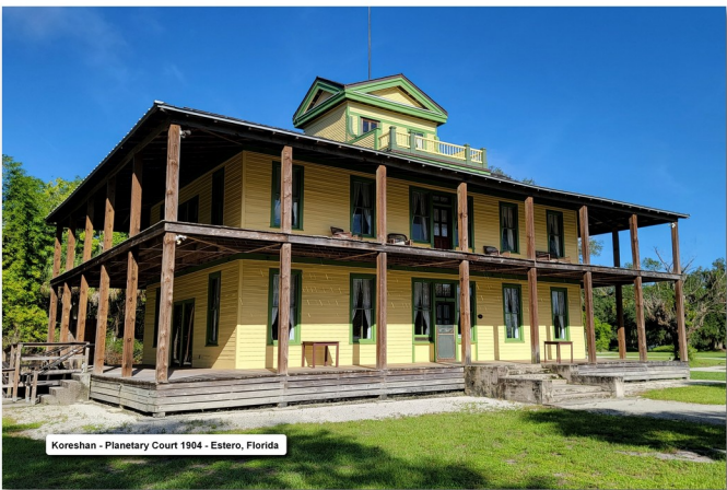
Koreshan - Planetary Court 1904 - Estero, Florida