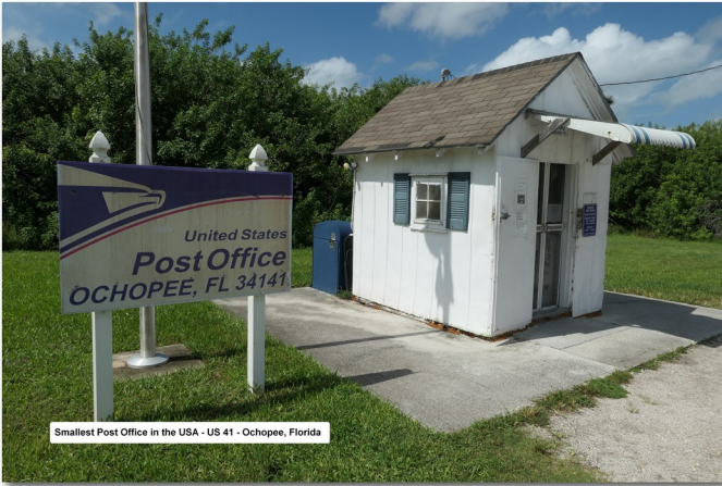
Smallest Post Office in the USA - US 41 - Ochopee, Florida