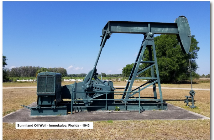
Sunniland Oil Well - Immokalee, Florida - 1943