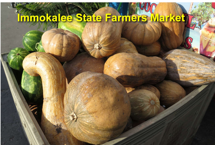
Immokalee State Farmers Market