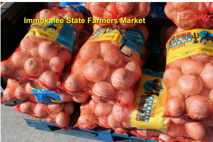
Immokalee State Farmers Market