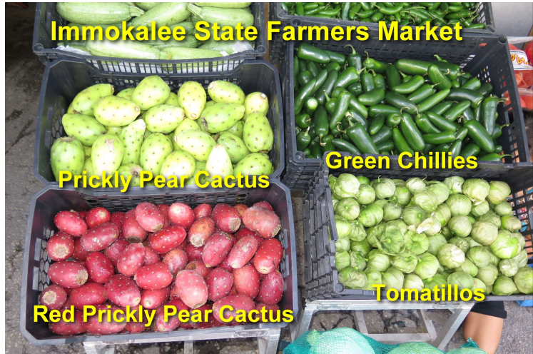
Immokalee State Farmers Market Prickly Pear Cactus Green Chilies Tomatillos Red Prickly Pear Cactus