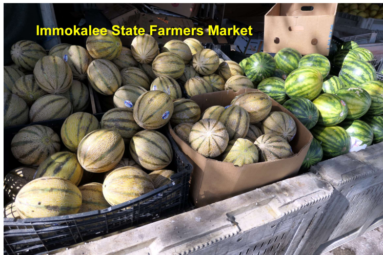
Immokalee State Farmers Market