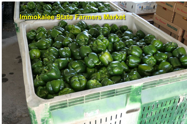
Immokalee State Farmers Market