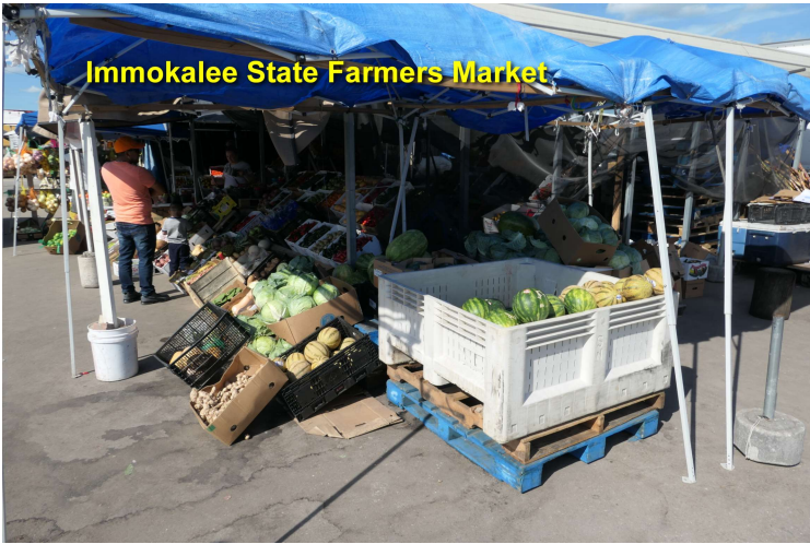
Immokalee State Farmers Market