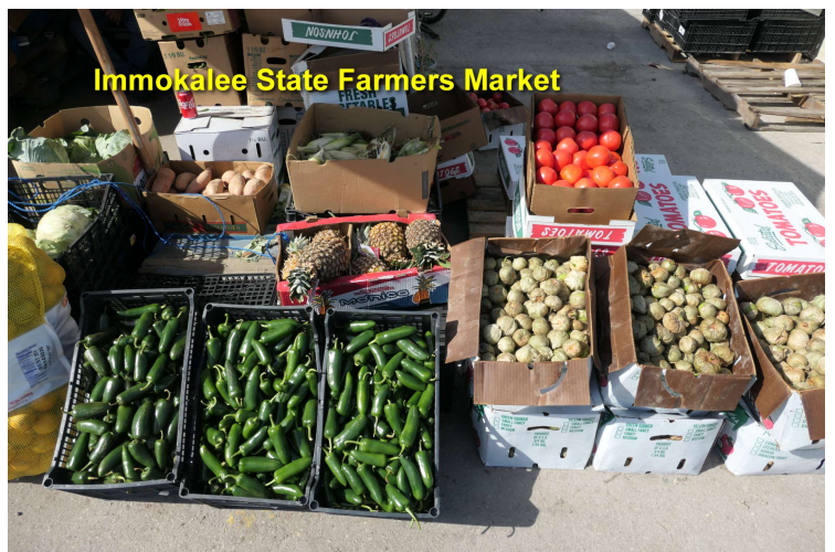
Immokalee State Farmers Market