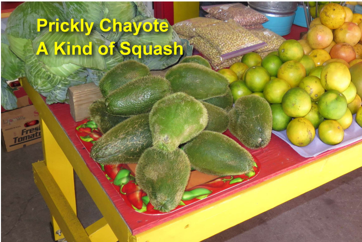
Prickly Chayote A Kind of Squash