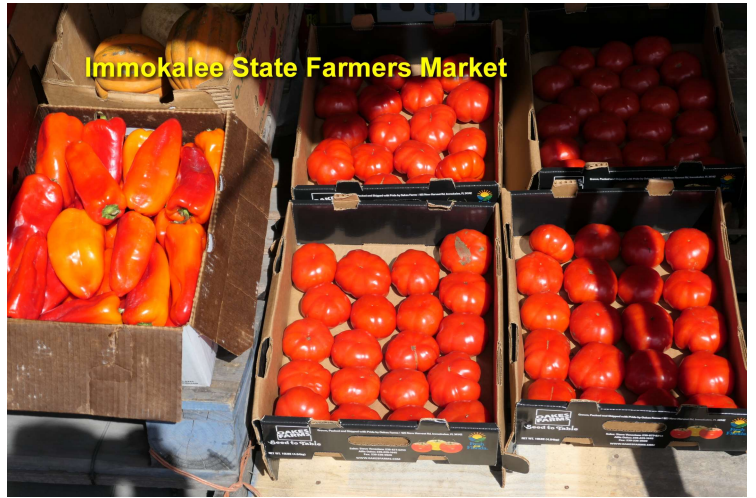
Immokalee State Farmers Market