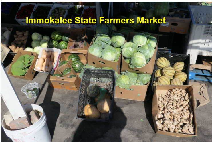
Immokalee State Farmers Market