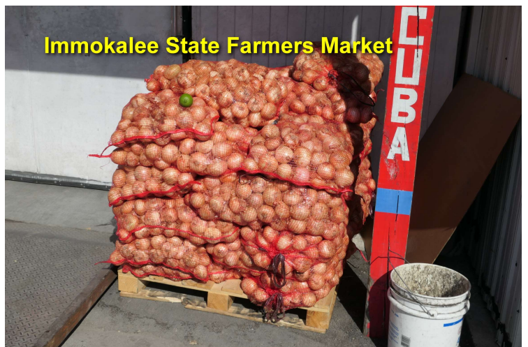
Immokalee State Farmers Market