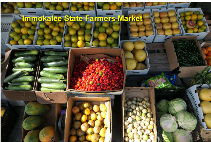
Immokalee State Farmers Market