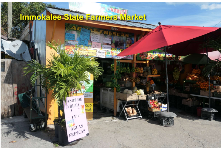
Immokalee State Farmers Market