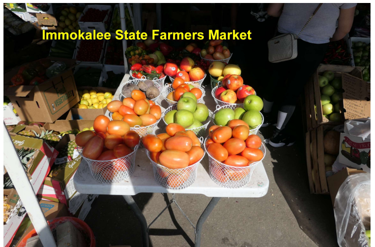
Immokalee State Farmers Market