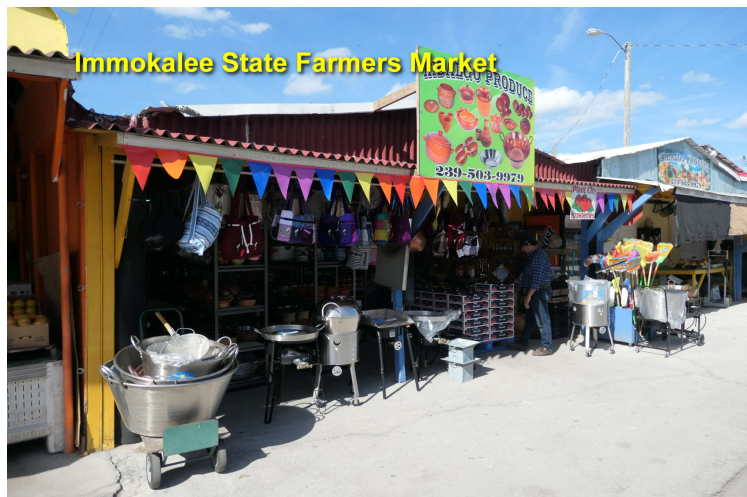
Immokalee State Farmers Market