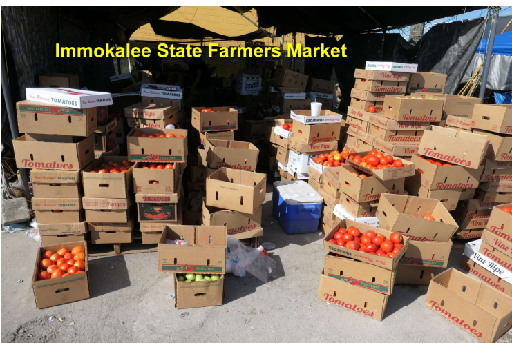
Immokalee State Farmers Market