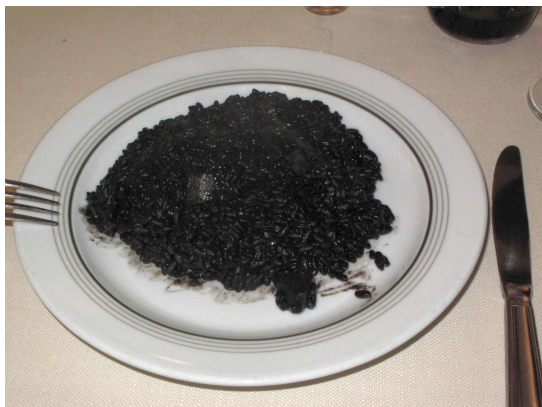
Risotto Neri di Seppia - Gino's Trattoria, Oristano