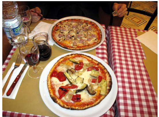
Pizza - Rome