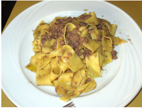
Pappardelle Wild Boar Ragu - Piazza del Popolo, Orvieto