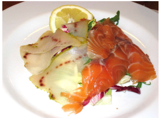
Swordfish and Salmon - Domus, Sardinia