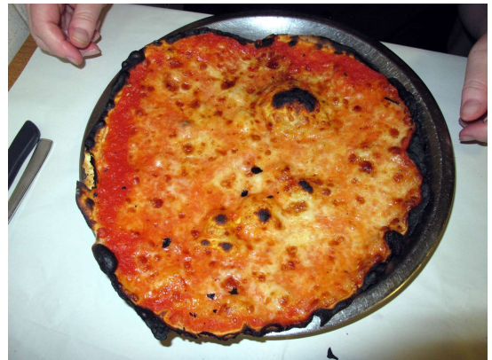
Large Margherita - Baffetto, Rome