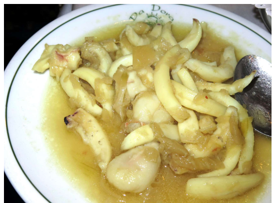
Seafood in Broth - Da Dora, Naples