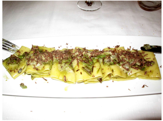
Paqueta - Albergo Duomo, Oristano, Sardinia