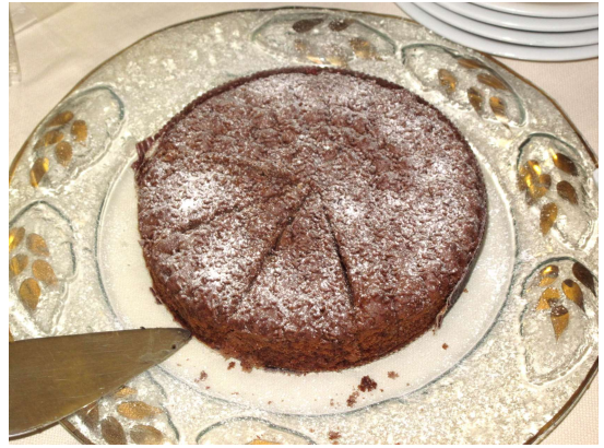
Breakfast Torte - Casa Diana, Sardara, Sardinia