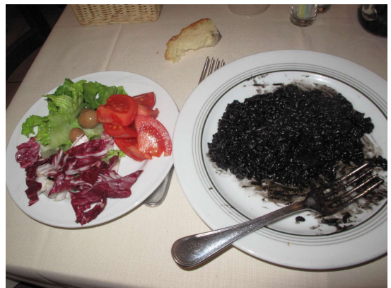
Risotto Neri di Seppia and Salad - Gino's Trattoria, Oristano