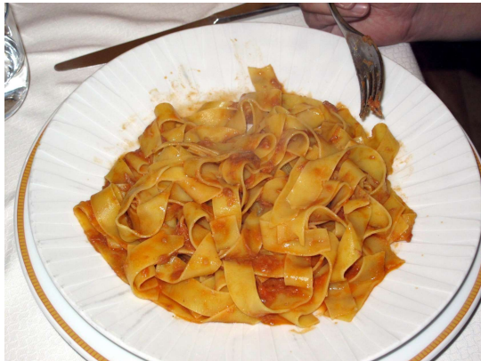
Pappardelle - Rome