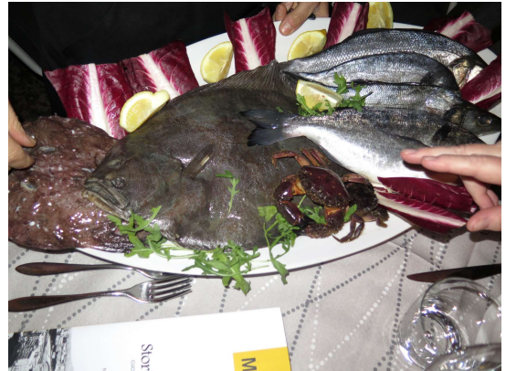
Flounder - Astroni, Naples