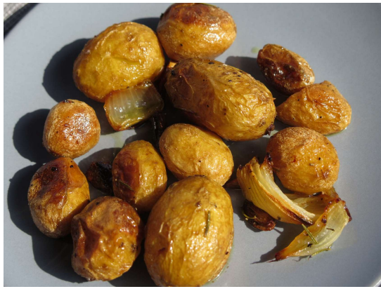
Roasted Potatoes - Naples