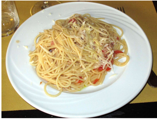
Spaghetti Fresh Tomatoes Ham - Piazza del Popolo, Orvieto