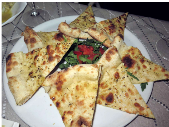
Pizza Bread - Astroni, Naples