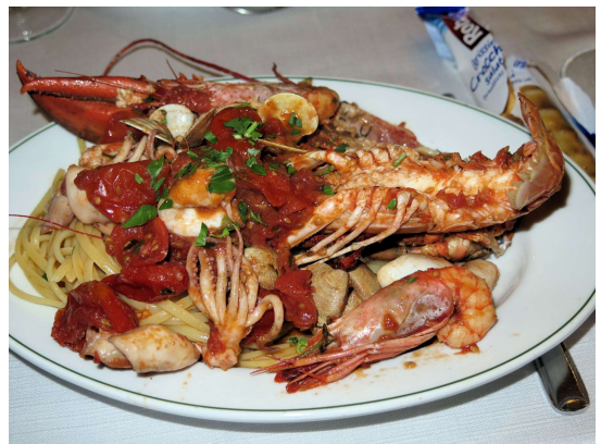
Seafood and Linguini - Da Dora, Naples