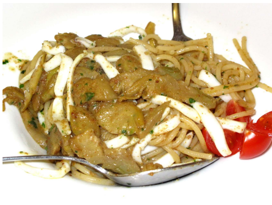
Spaghetti Botarga Squid Mushrooms - Casa Diana, Sardara, Sardinia