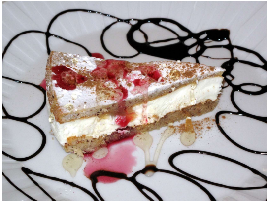
Torte - Rome