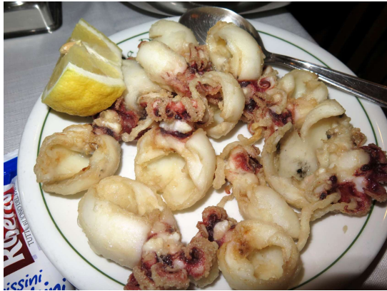
Squid - Da Dora, Naples