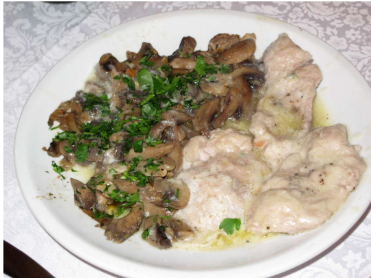
Veal Mushrooms - Hostaria Farnese, Rome