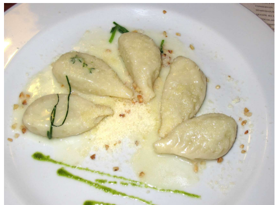
Culurgiones - Domus, Sardinia