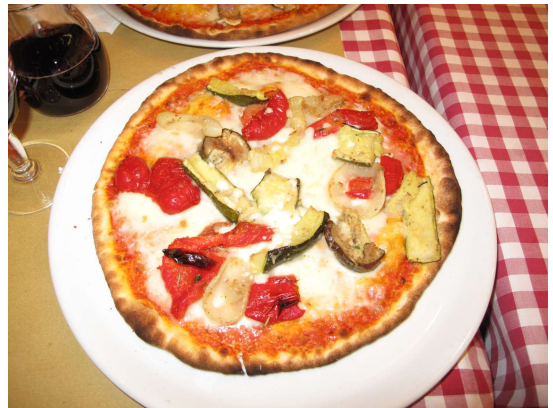
Pizza 2 - Rome