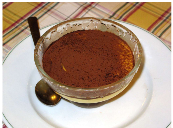
Tiramisu - Rome