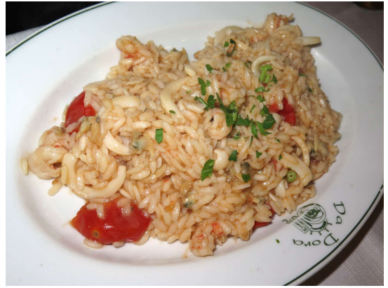
Seafood Risotto - Da Dora, Naples