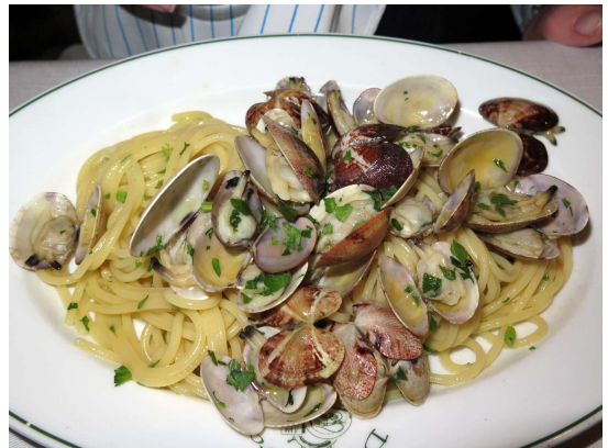
Clams Linguini - Da Dora, Naples