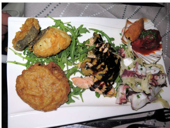
Seafood Antipasto - Astroni, Naples