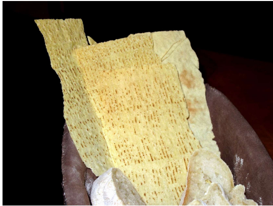
Music Bread - Domus, Sardinia