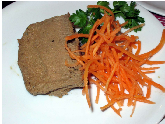
Peasant Pate - Cul de Sac, Rome