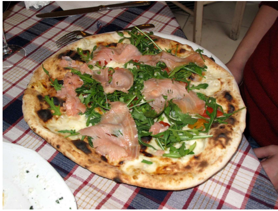
Pizza with Smoked Salmon and Arugula - Trastevere