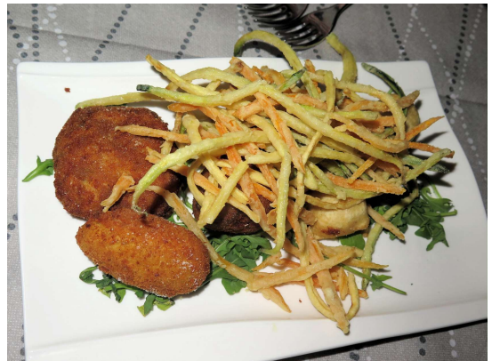
Zucchini, Seafood Croquettes - Astroni, Naples