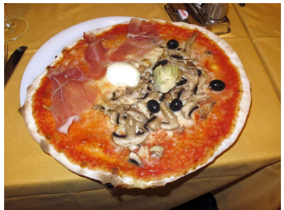
Pizza Capriccosa - Rome