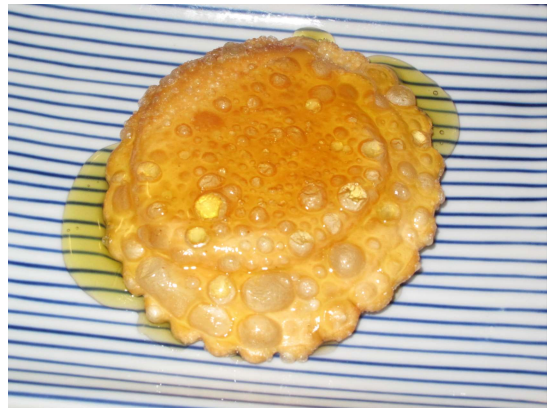
Seada - Casa Diana, Sardara, Sardinia