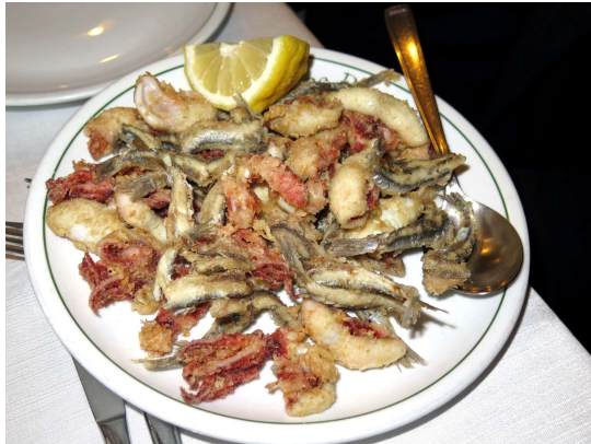
Fish Starter - Da Dora, Naples