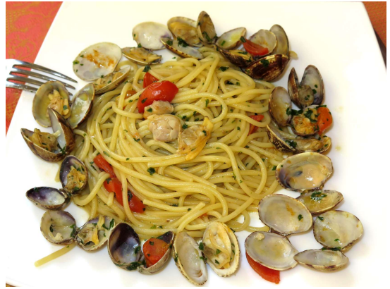
Spaghetti with Clams - Il Pozzo, Sorrento