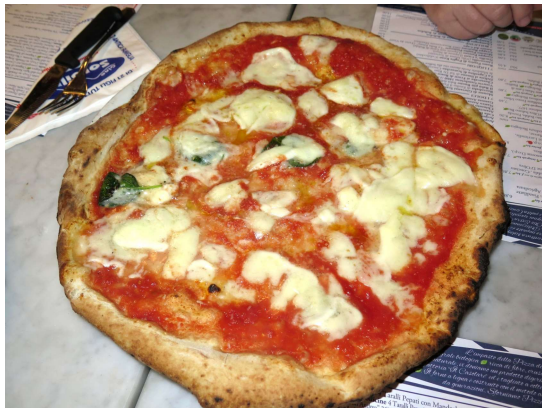
Pizza - Sorbillo, Naples