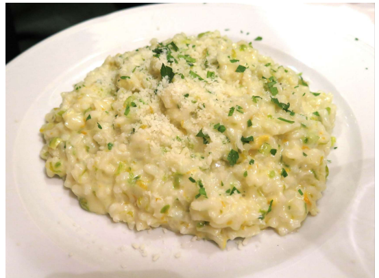
Risotto - Trattoria dell'Oca, Naples