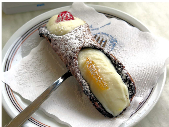
Conollo - Naples