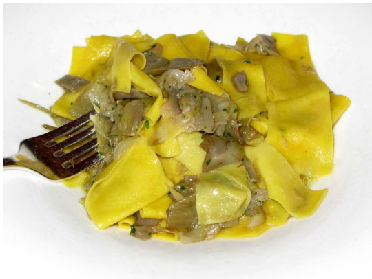
Artichoke and Pasta - Da Giacomo Restaurant, Milan