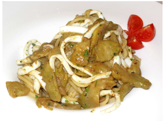
Spaghetti Botarga Squid and Mushrooms - Casa Diana, Sardara, Sardinia