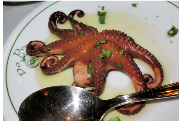
Octopus - Da Dora, Naples