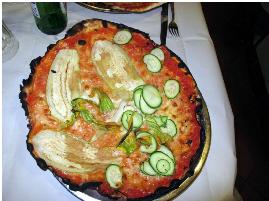
Vegetarian - Baffetto, Rome