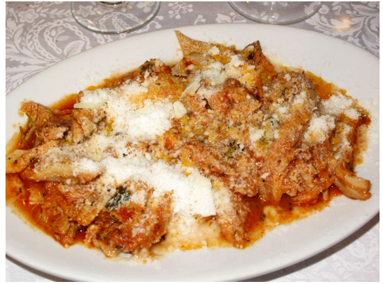
Tripe alla Romana - Hostaria Farnese, Rome