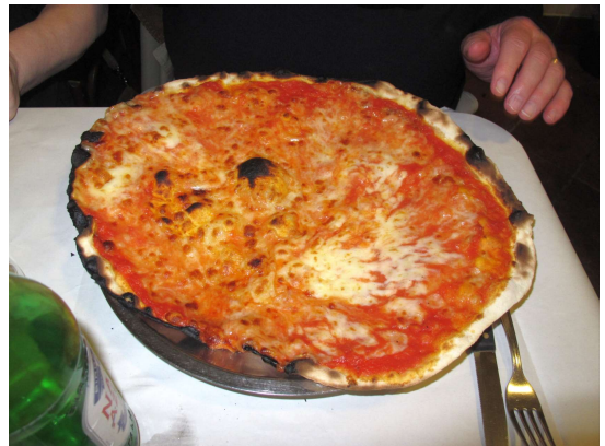
Small Margherita - Baffetto, Rome