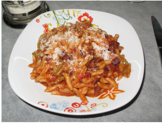
Malloreddus - Iglesias, Sardinia