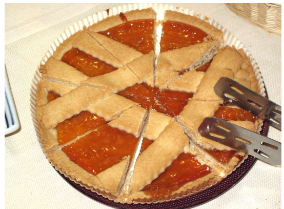
Breakfast Apricot Tart - Casa Diana, Sardara, Sardinia