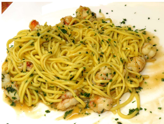
Lemon Prawns Linguini - Il Pozzo, Sorrento