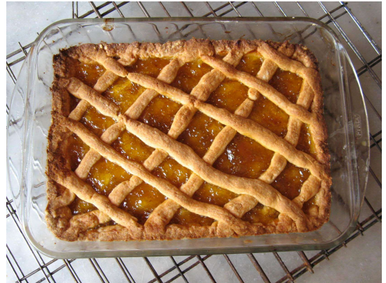
Apricot Torte - Tuscany