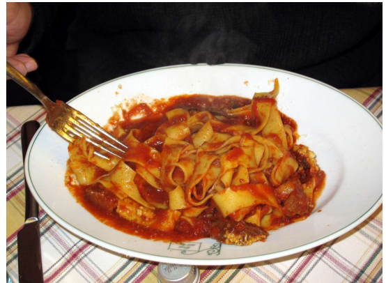
Pappardelle Alla Cinghiale (Wild Boar) - Rome