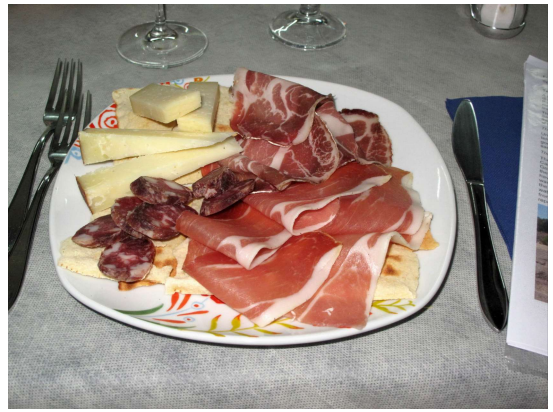
Sardinian Ham and Cheese - Iglesias, Sardinia