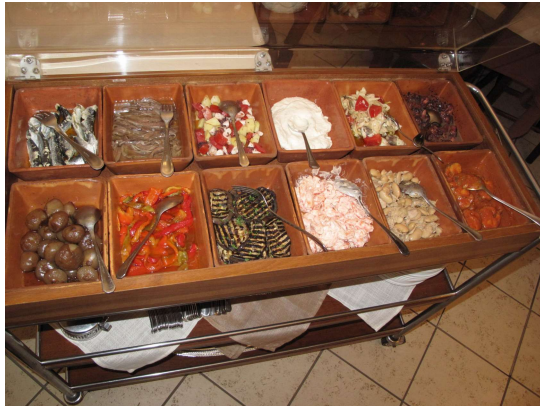
Antipasti - Gino's Trattoria, Oristano