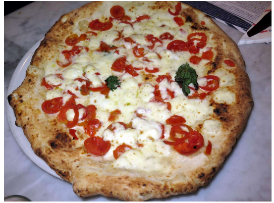
Pizza with Vesuvius Tomatoes - Sorbillo, Naples