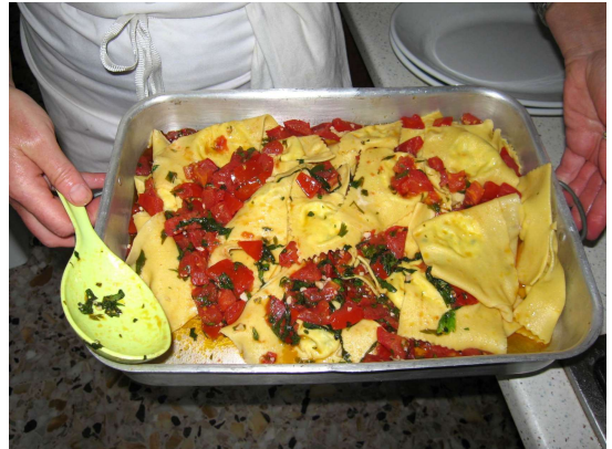
Ravioli - Tuscany