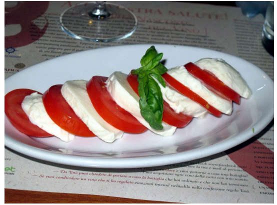
Mozzarella and Tomato - Domus, Cagliari, Sardinia