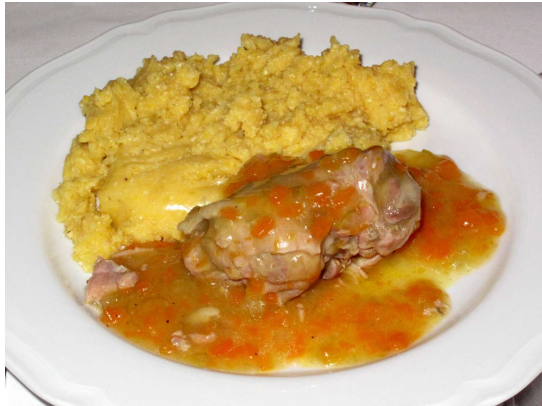
Rabbit with Polenta - Trattoria Masuelli S Marco, Milan