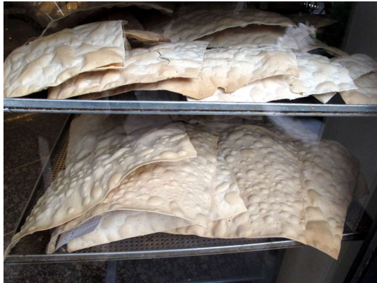
Pane Musica - Rome