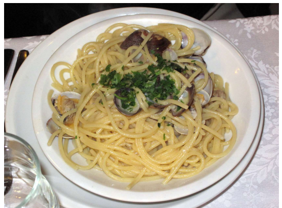
Spaghetti Clams - Hostaria Farnese, Rome