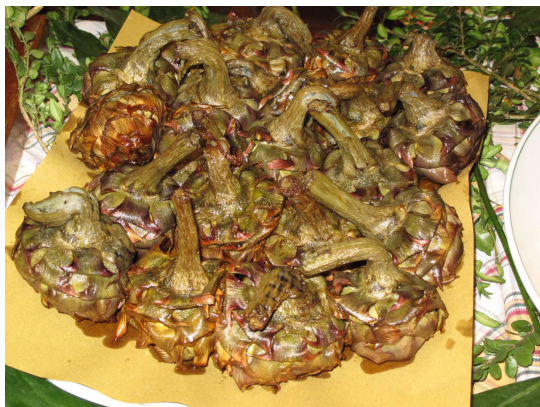
Artichokes - Rome