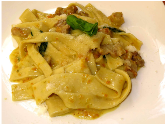
Straccetti of Pork Ragu - Il Pozzo, Sorrento