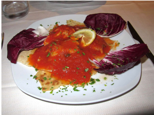
Burridda - Ele, Oristano, Sardinia