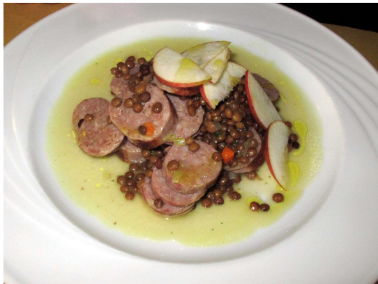
Sausage Lentils Apples - Piazza del Popolo, Orvieto