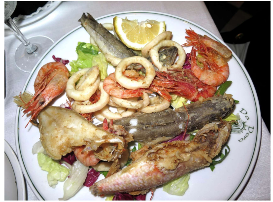
Fish Fry - Da Dora, Naples