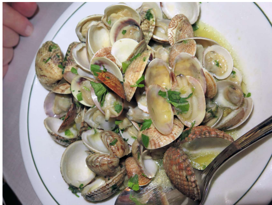
Clams - Da Dora, Naples