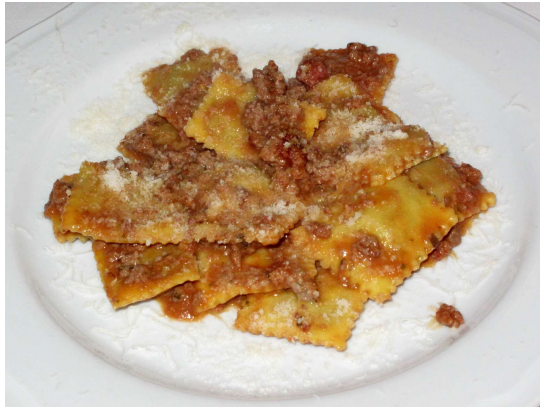
Agnolotti - Trattoria Masuelli S Marco, Milan