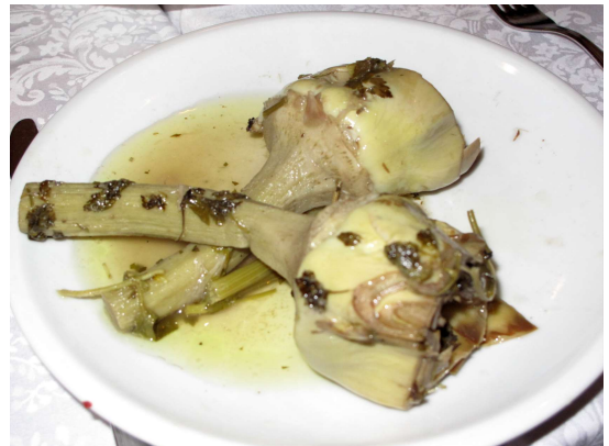
Artichokes - Hostaria Farnese, Rome