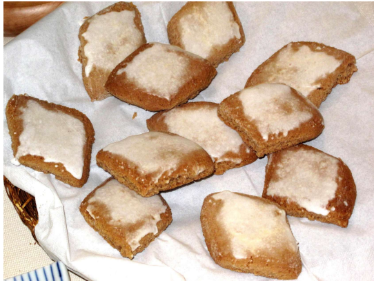
Breakfast Iced Gingerbread - Casa Diana, Sardara, Sardinia