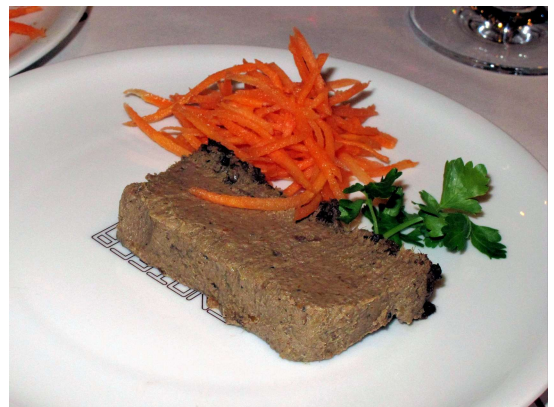
Liver Pate - Cul de Sac, Rome