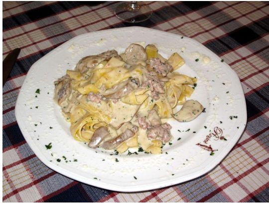
Fettuccini with Veal - Regine, Trastevere