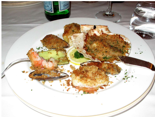
Seafood Starter - Da Giacomo Restaurant, Milan