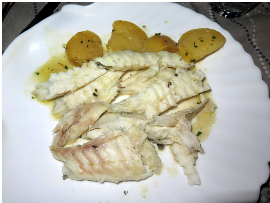
Flounder 2 - Astroni, Naples