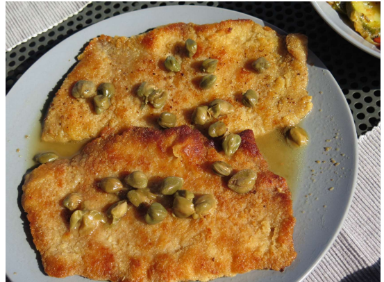
Veal with Capers - Naples