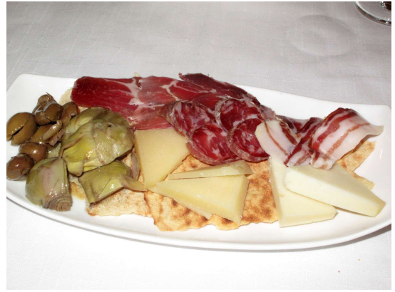
Antipasta - Albergo Duomo, Oristano, Sardinia