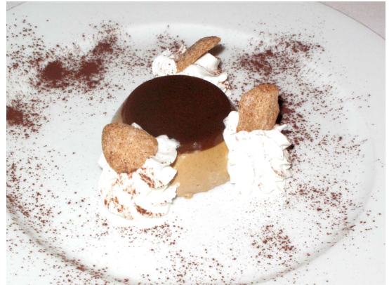
Panna Cotta - Trattoria Masuelli S Marco, Milan