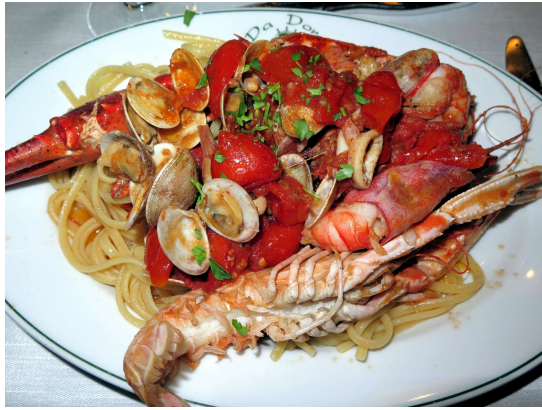
Seafood Linguini - Da Dora, Naples