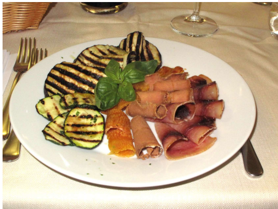
Smoked Fish - Casa Diana, Sardara, Sardinia