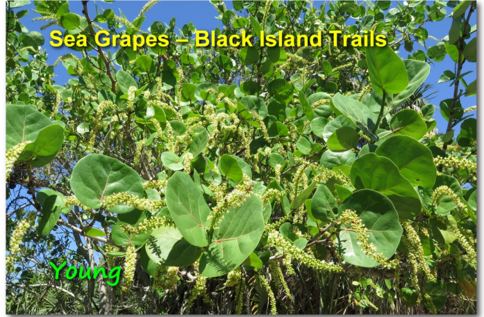
Sea Grapes - Black Island Trails