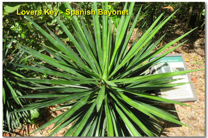
Lovers Key - Spanish Bayonet