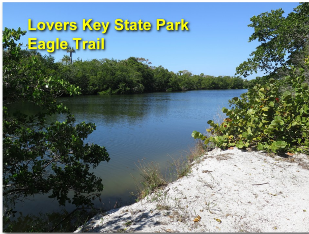
Lovers Key State Park Eagle Trail