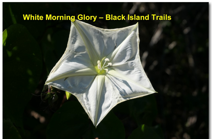
White Morning Glory - Black Island Trails