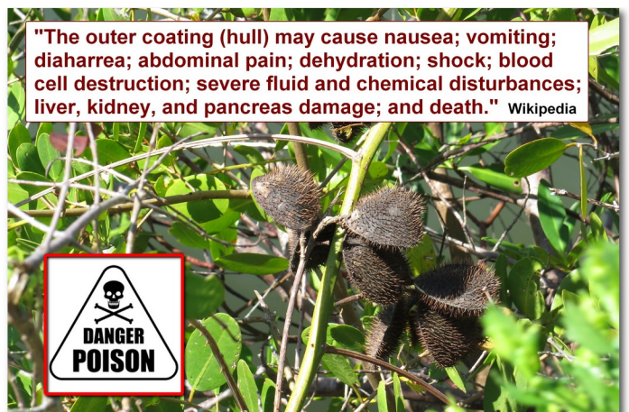
"The outer coating (hull) may cause nausea; vomiting; diarrhea; abdominal pain; dehydration; shock; blood cell destruction; severe fluid and chemical disturbances; liver, kidney, and pancreas damage; and death." Wikipedia