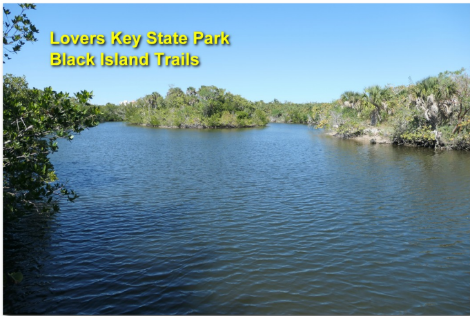
Lovers Key State Park Black Island Trails