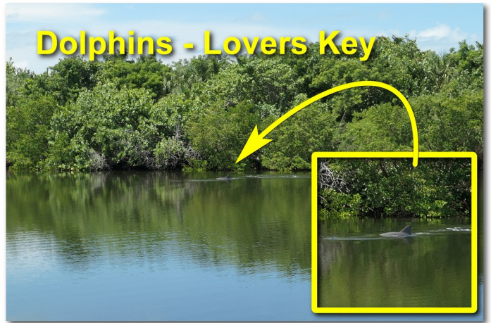
Dolphins - Lovers Key