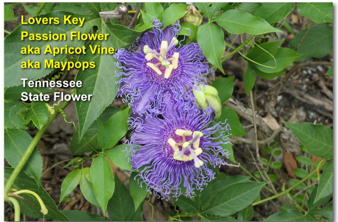
Lovers Key Passion Flower aka Apricot Vine aka Maypops Tennessee State Flower