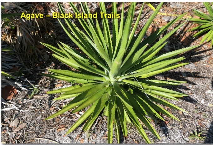
Agave – Black Island Trails