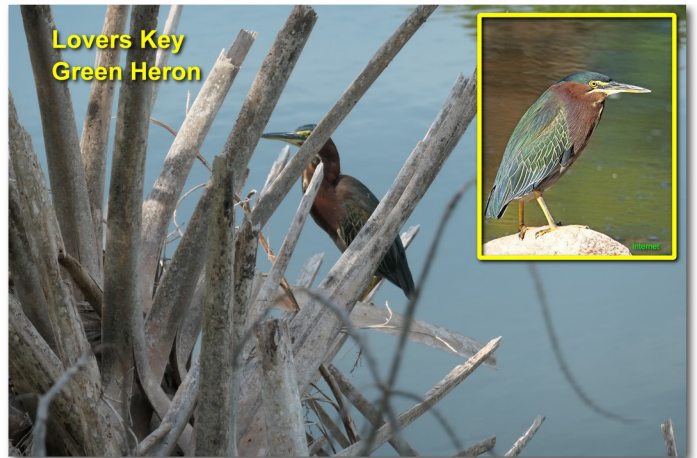
Lovers Key Green Heron