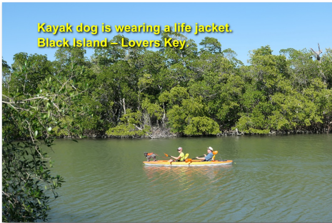
Kayak dog is wearing a life jacket. Black Island – Lovers Key.