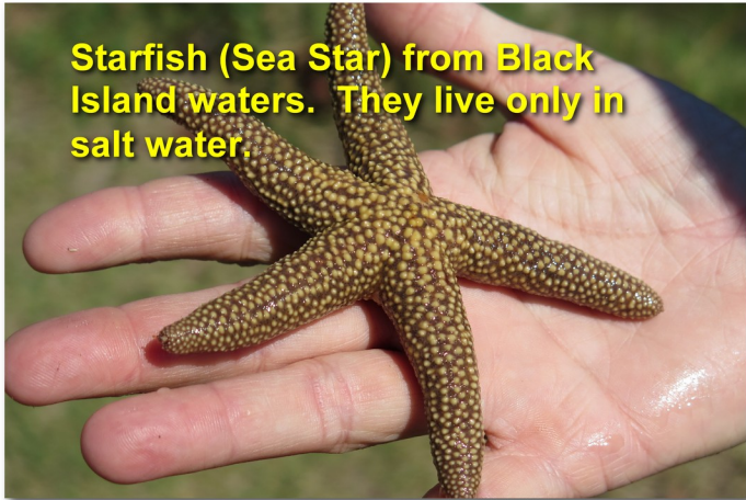
Starfish (Sea Star) from Black Island waters. They live only in salt water.