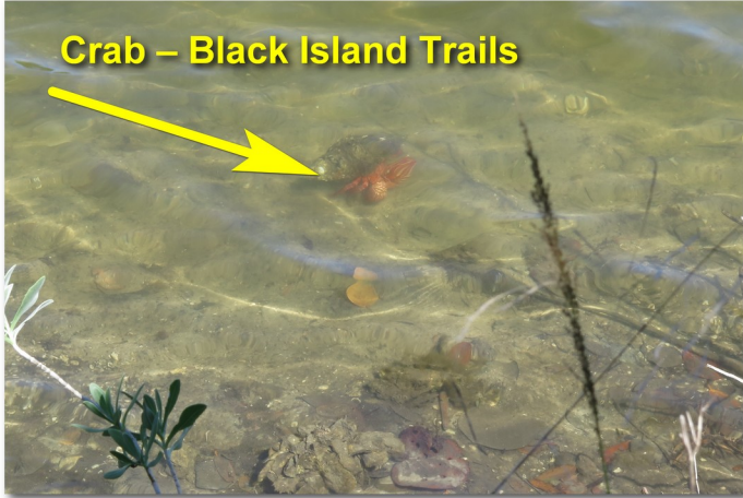
Crab - Black Island Trails