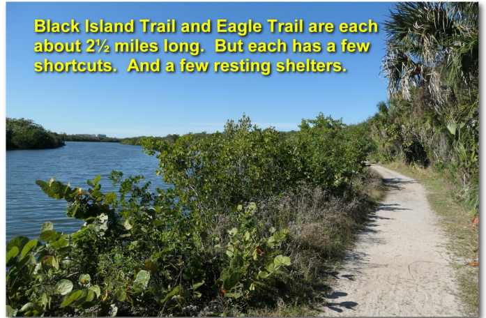
Black Island Trail and Eagle Trail are each about 2½ miles long. But each has a few shortcuts. And a few resting shelters.