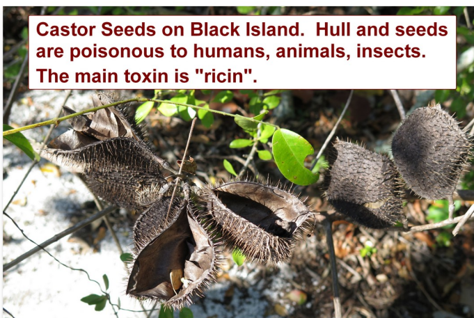
Castor Seeds on Black Island. Hull and seeds are poisonous to humans, animals, insects. The main toxin is "ricin".