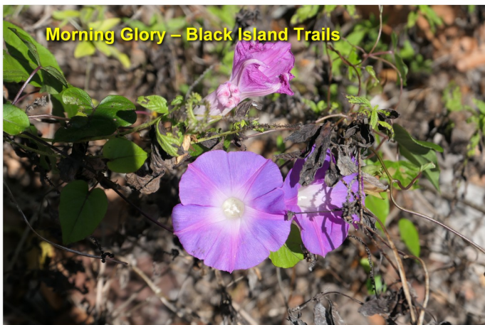
Morning Glory - Black Island Trails