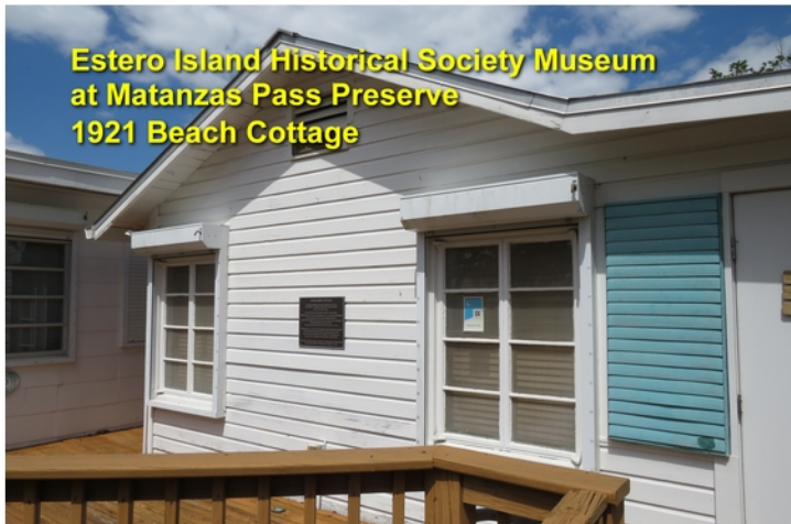
Estero Island Historical Society Museum at Matanzas Pass Preserve 1921 Beach Cottage