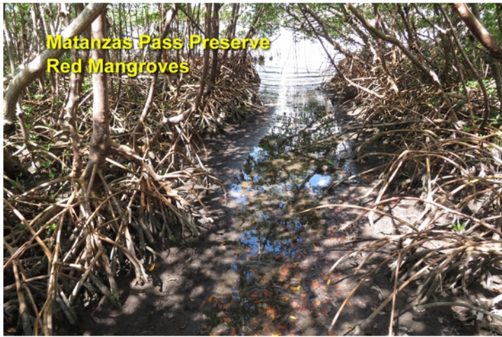
Matanzas Pass Preserve Red Mangroves