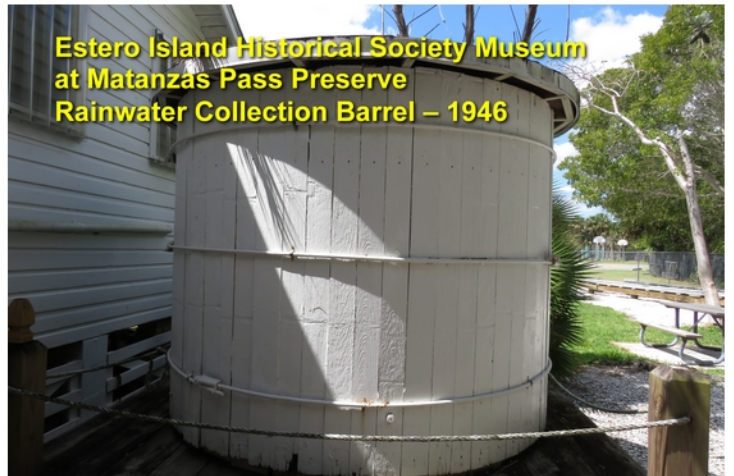
Estero Island Historical Society Museum at Matanzas Pass Preserve Rainwater Collection Barrel – 1946