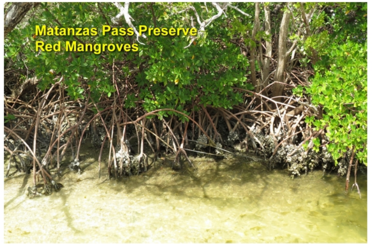
Matanzas Pass Preserve Red Mangroves