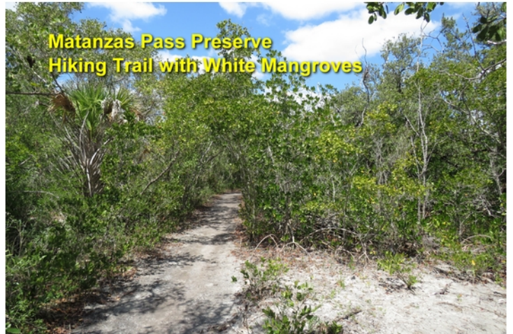
Matanzas Pass Preserve Hiking Trail with White Mangroves