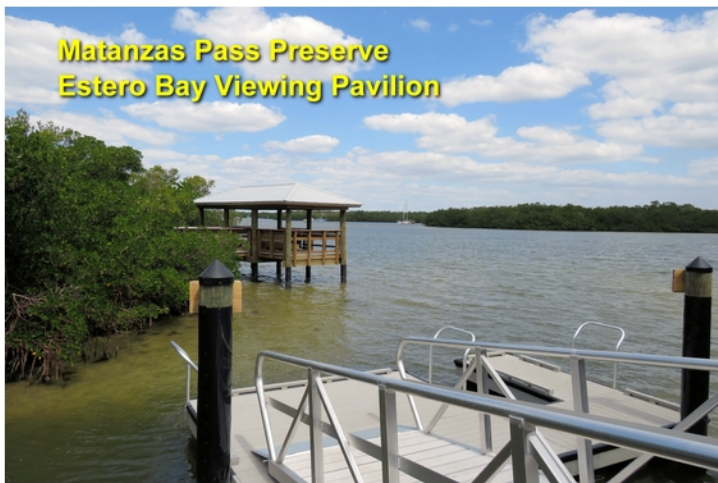
Matanzas Pass Preserve Estero Bay Viewing Pavilion