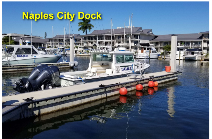
Naples City Dock