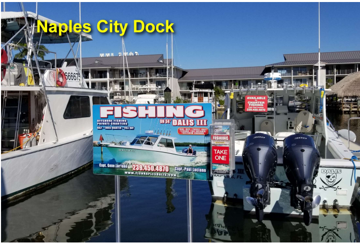
Naples City Dock