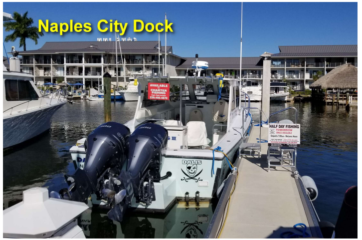
Naples City Dock