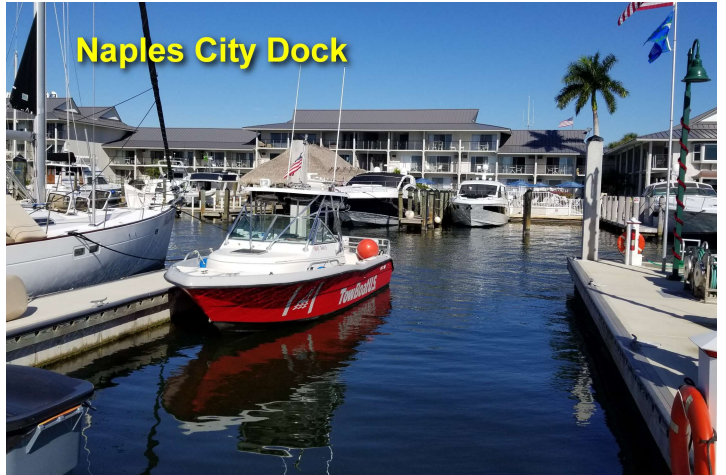
Naples City Dock