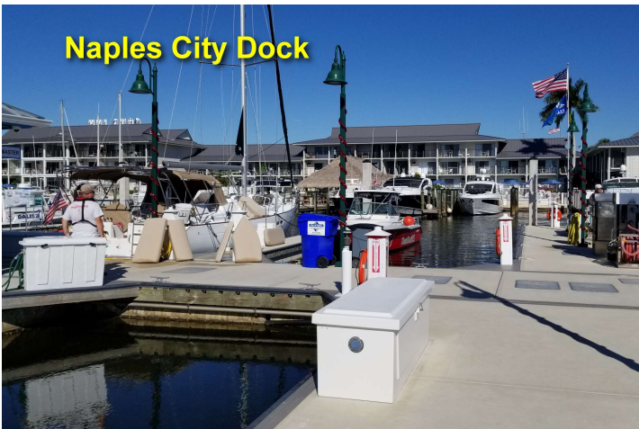
Naples City Dock