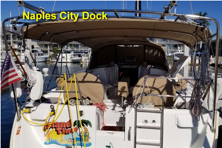
Naples City Dock