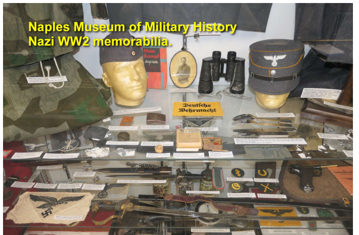
Naples Museum of Military History Nazi WW2 memorabilia.