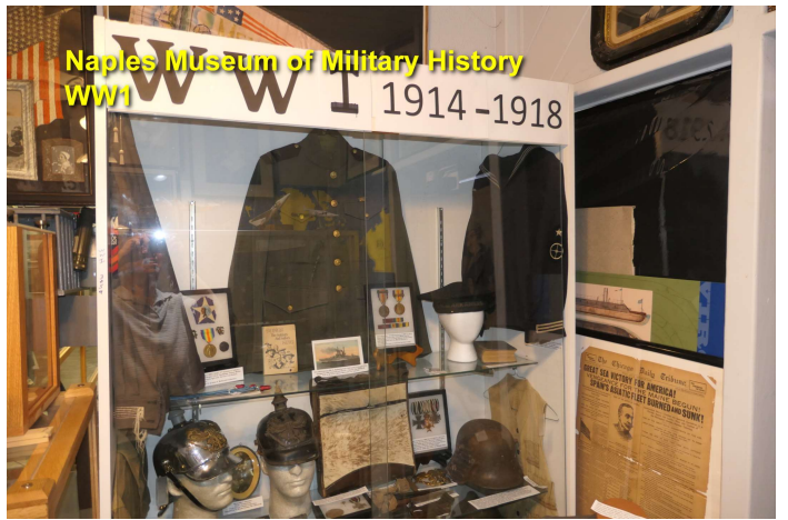
Naples Museum of Military History WWI 1914-1918