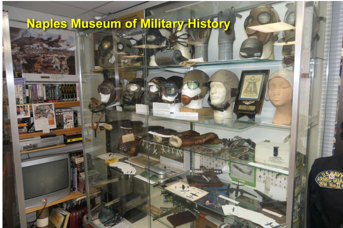
Naples Museum of Military History