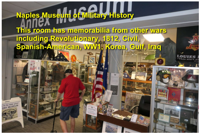
Naples Museum of Military History This room has memorabilia from other wars including Revolutionary, 1812, Civil, Spanish-American, WW1, Korea, Gulf, Iraq