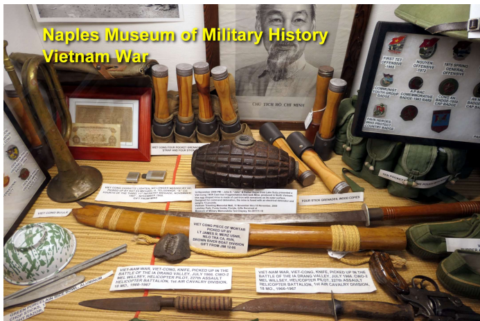
Naples Museum of Military History Vietnam War