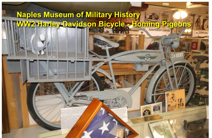
Naples Museum of Military History WW2 Harley-Davidson Bicycle - Homing Pigeons

I am an American. My plane is destroyed. I cannot speak your language. I am an enemy of the Japanese. Please give me food and take me to the nearest Allied military base. You will be rewarded.