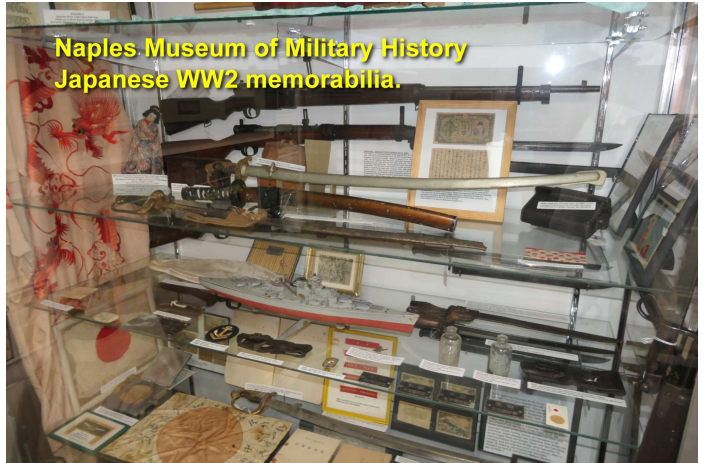
Naples Museum of Military History Japanese WW2 memorabilia.