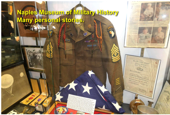
Naples Museum of Military History Many personal stories.