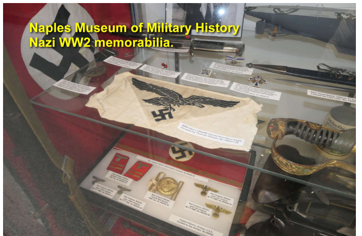
Naples Museum of Military History Nazi WW2 memorabilia.