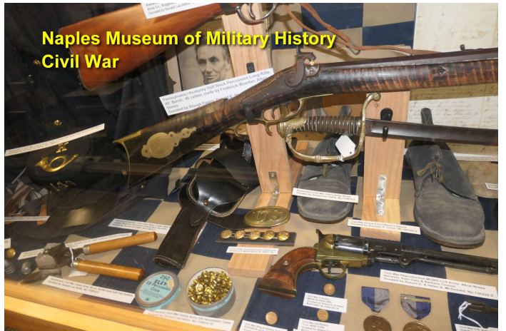
Naples Museum of Military History Civil War