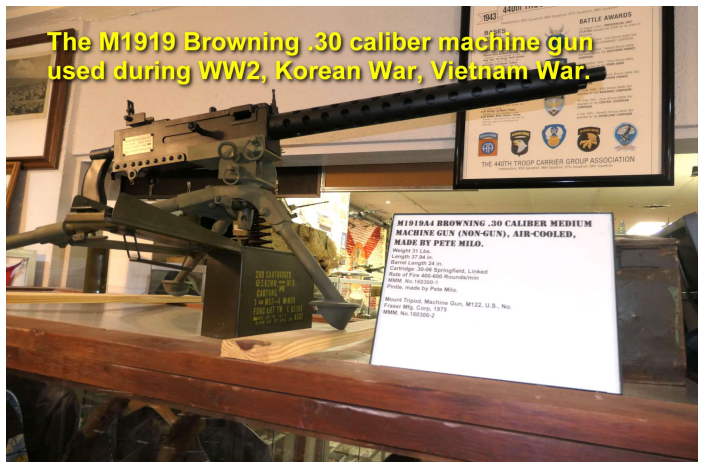
The M1919 Browning .30 caliber machine gun used during WW2, Korean War, Vietnam War.

M1919 BROWNING .30 CALIBER MEDIUM MACHINE GUN (NON-GUN), AIR-COOLED, MADE BY PETE MILO. Weight 31 Lbs. Barrel Length 24 in. Caliber .30 Springfield, Linked Mfg. No. 148250-1 Photo: MILO by Pete Milo. Model Tripart, Machine Gun, M722 U.S. No. 148250-1 Photo: MILO, 1975 MILO No. 148250-1