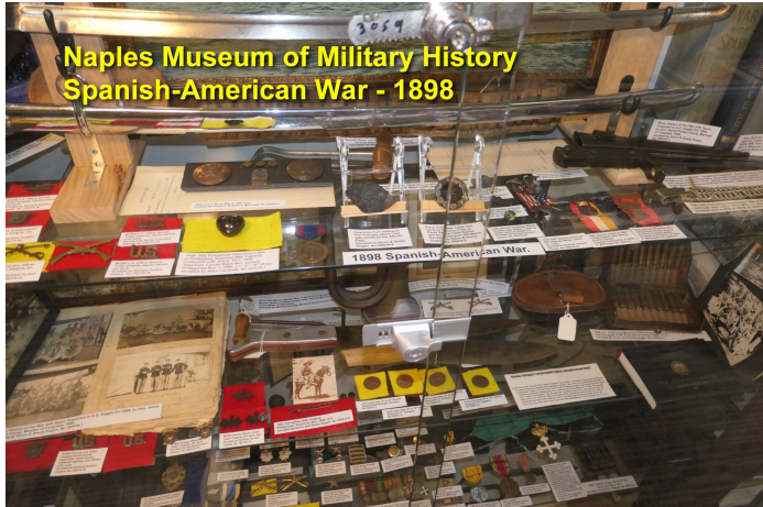
Naples Museum of Military History Spanish-American War - 1898