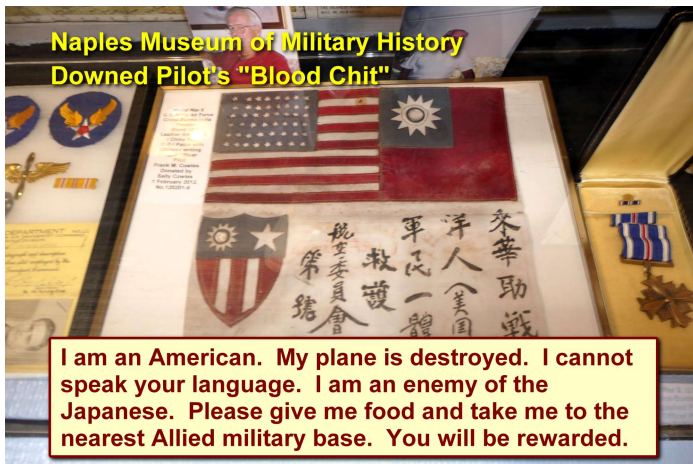
Naples Museum of Military History Downed Pilot's "Blood Chit"

I am an American. My plane is destroyed. I cannot speak your language. I am an enemy of the Japanese. Please give me food and take me to the nearest Allied military base. You will be rewarded.