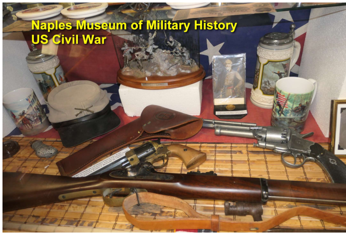
Naples Museum of Military History US Civil War