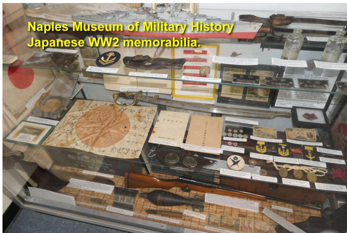
Naples Museum of Military History Japanese WW2 memorabilia.