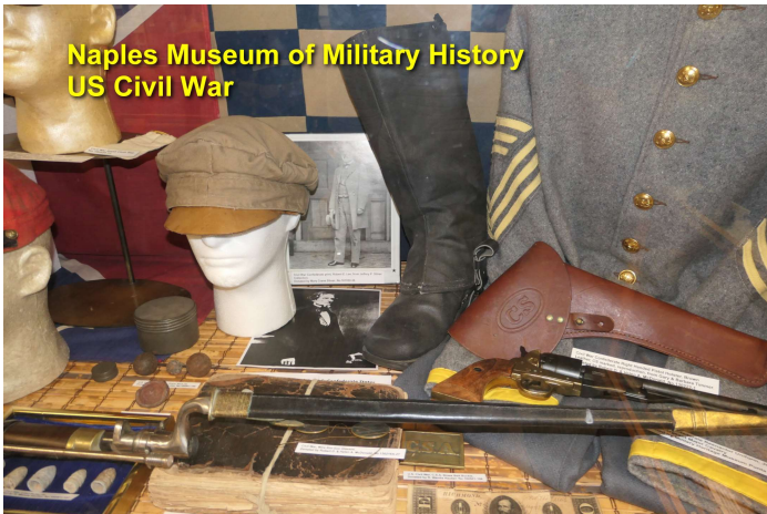
Naples Museum of Military History US Civil War