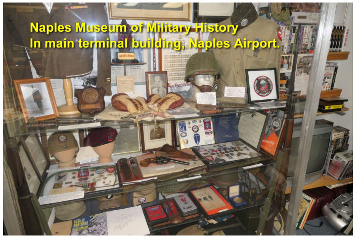
Naples Museum of Military History In main terminal building, Naples Airport.