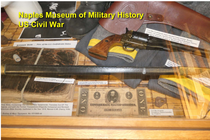
Naples Museum of Military History US Civil War