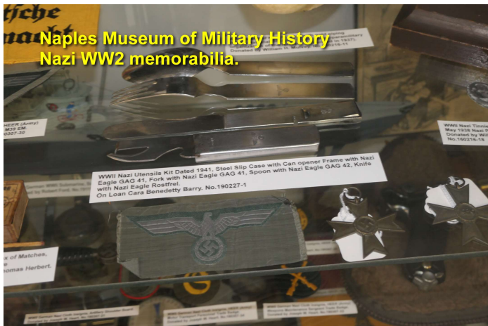
Naples Museum of Military History Nazi WW2 memorabilia.