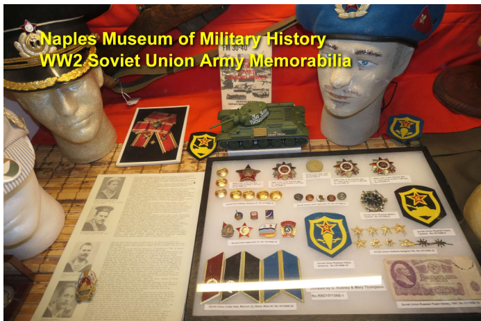
Naples Museum of Military History WW2 Soviet Union Army Memorabilia