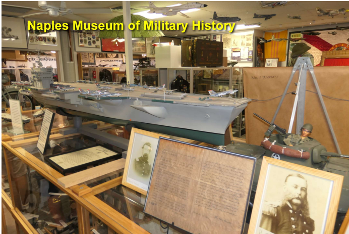
Naples Museum of Military History