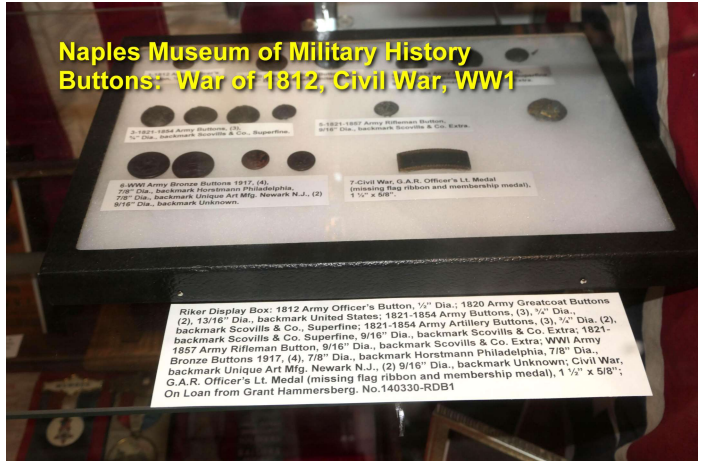
Naples Museum of Military History Buttons: War of 1812, Civil War, WW1