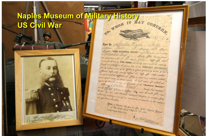
Naples Museum of Military History US Civil War