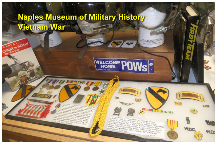
Naples Museum of Military History Vietnam War