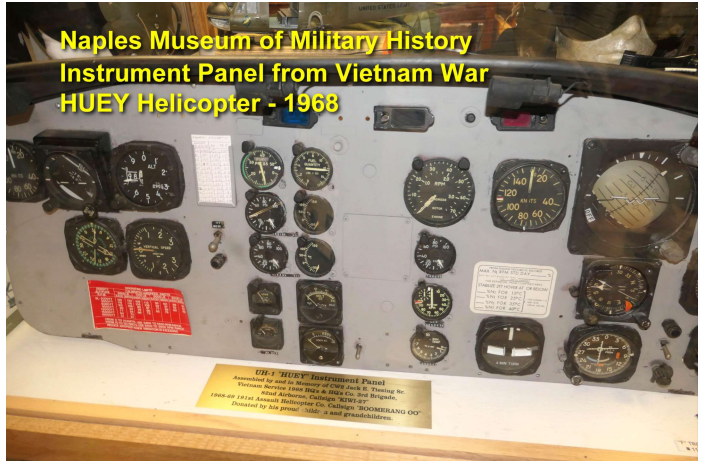
Naples Museum of Military History Instrument Panel from Vietnam War HUEY Helicopter - 1968