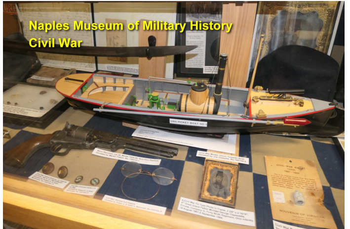
Naples Museum of Military History Civil War