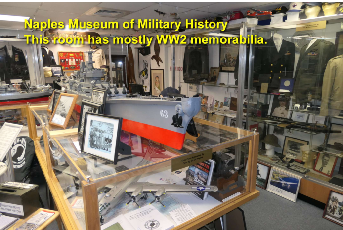
Naples Museum of Military History This room has mostly WW2 memorabilia.