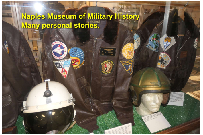
Naples Museum of Military History Many personal stories.