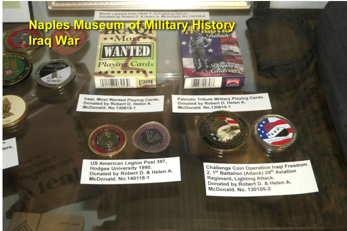
Naples Museum of Military History Iraq War