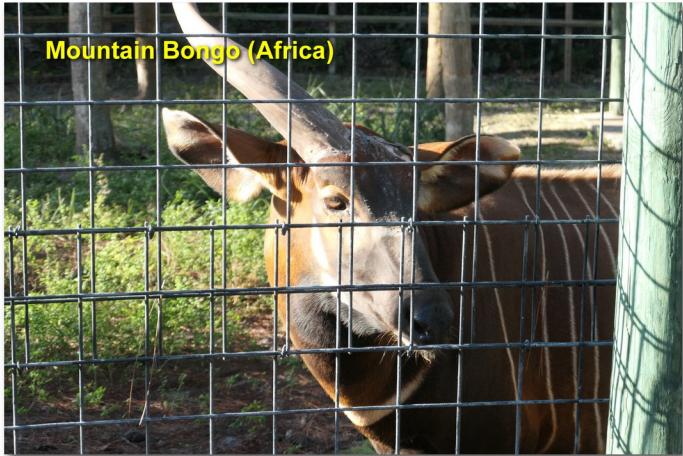
Mountain Bongo (Africa)