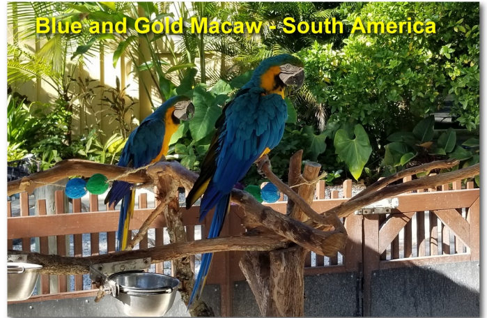
Blue and Gold Macaw - South America