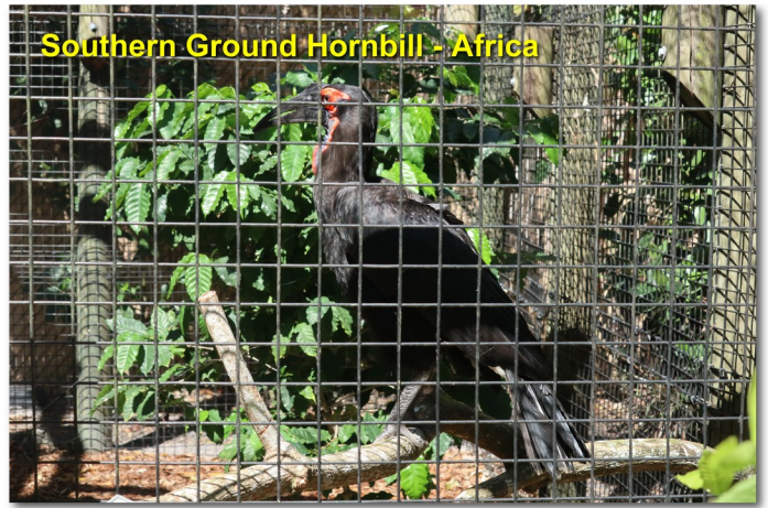
Southern Ground Hornbill - Africa