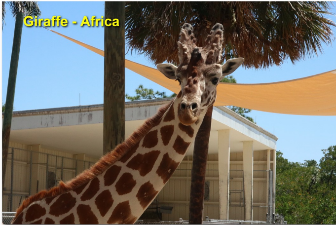
Giraffe - Africa