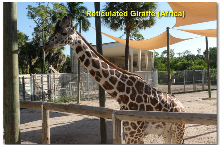
Reticulated Giraffe (Africa)