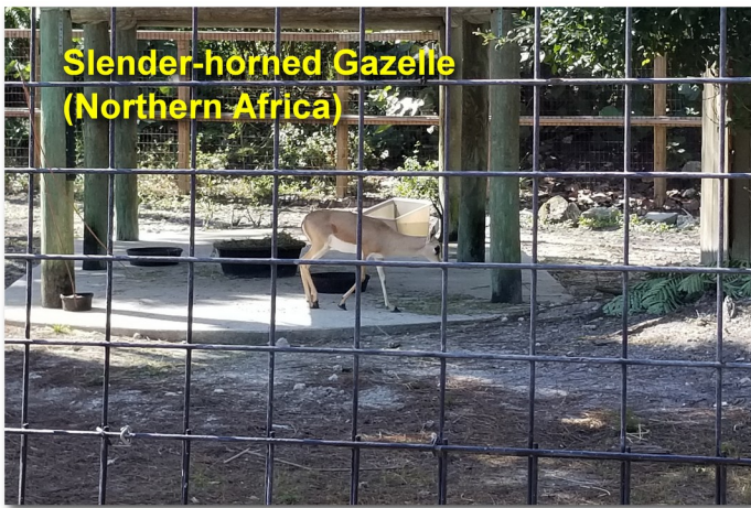
Slender-horned Gazelle (Northern Africa)