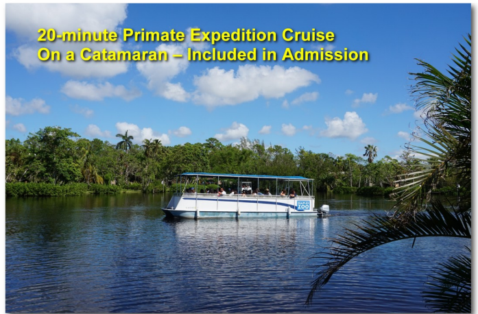
20-minute Primate Expedition Cruise On a Catamaran – Included in Admission