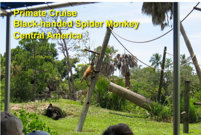
Primate Cruise Black-handed Spider Monkey Central America