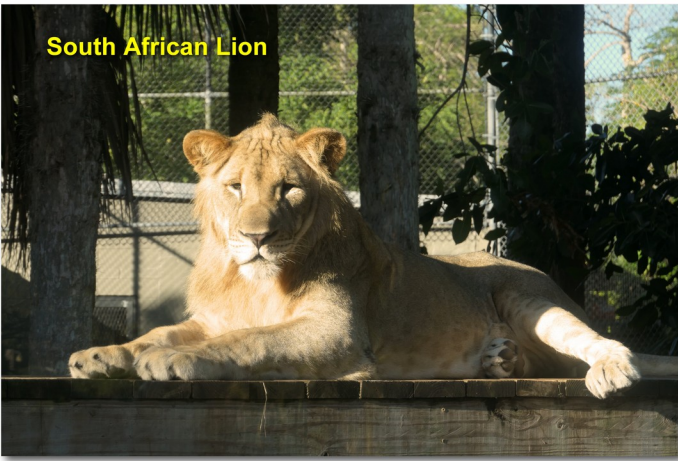
South African Lion