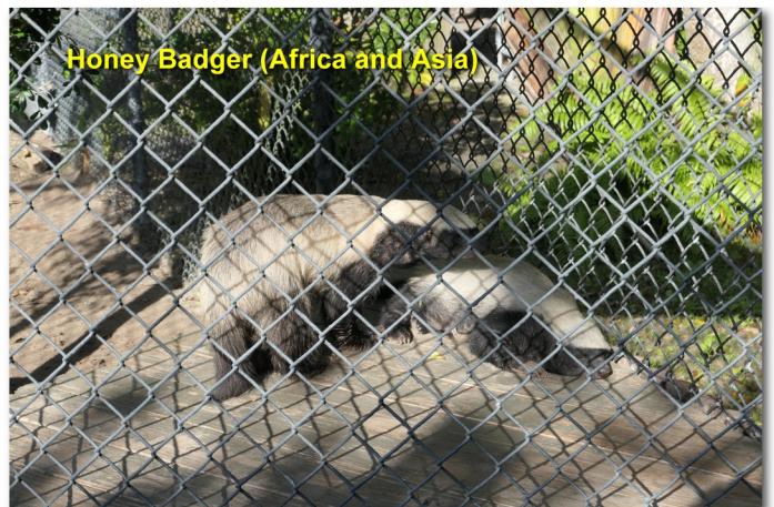
Honey Badger (Africa and Asia)