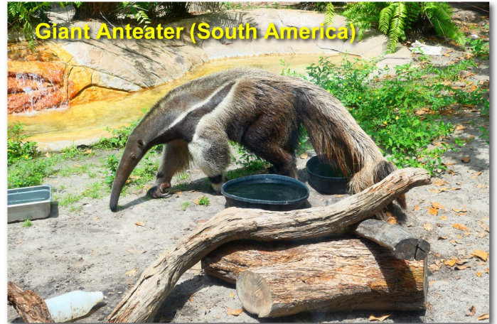
Giant Anteater (South America)