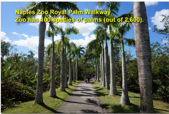
Naples Zoo Royal Palm Walkway Zoo has 100 species of palms (out of 2,600).