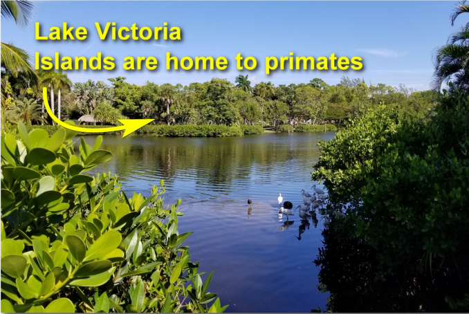
Lake Victoria Islands are home to primates