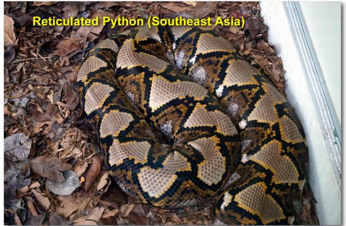
Reticulated Python (Southeast Asia)