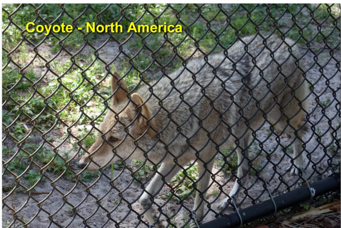
Coyote - North America