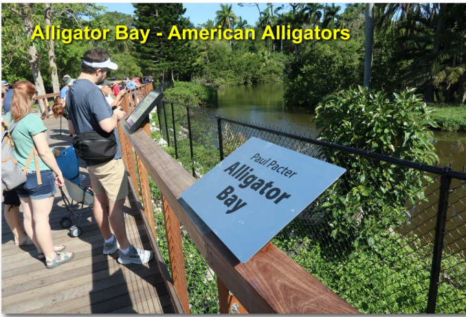
Alligator Bay - American Alligators