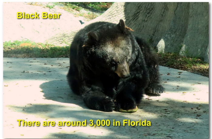
There are around 3,000 in Florida