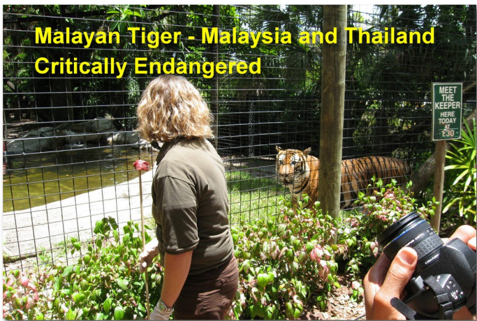
Malayan Tiger - Malaysia and Thailand Critically Endangered