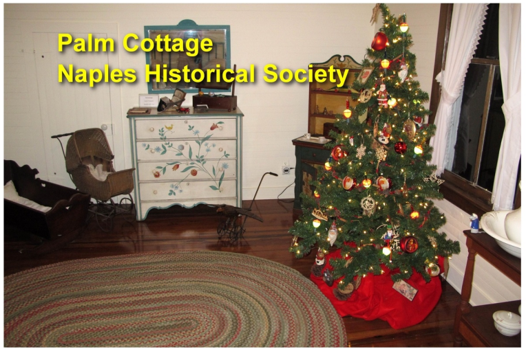
Palm Cottage Naples Historical Society