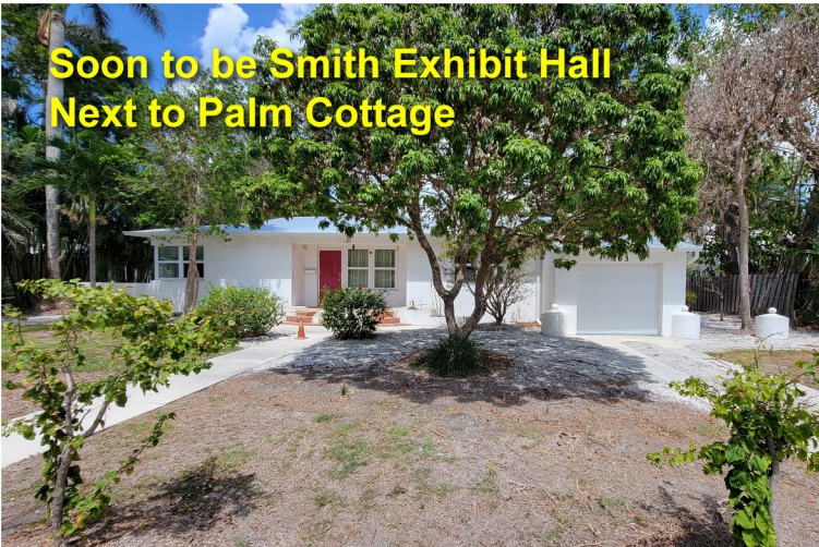
Soon to be Smith Exhibit Hall Next to Palm Cottage