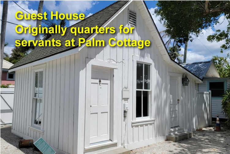
Guest House Originally quarters for servants at Palm Cottage