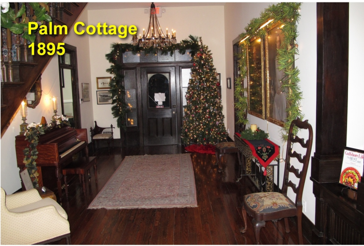
Palm Cottage 1895