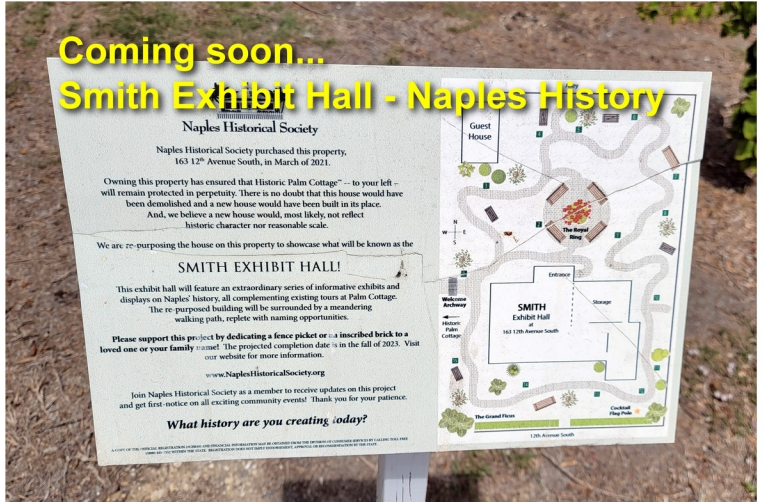
Coming soon... Smith Exhibit Hall - Naples History