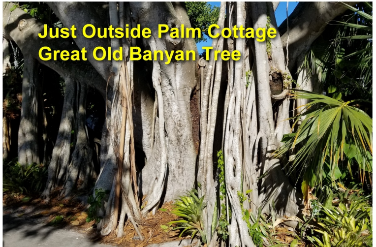
Just Outside Palm Cottage Great Old Banyan Tree