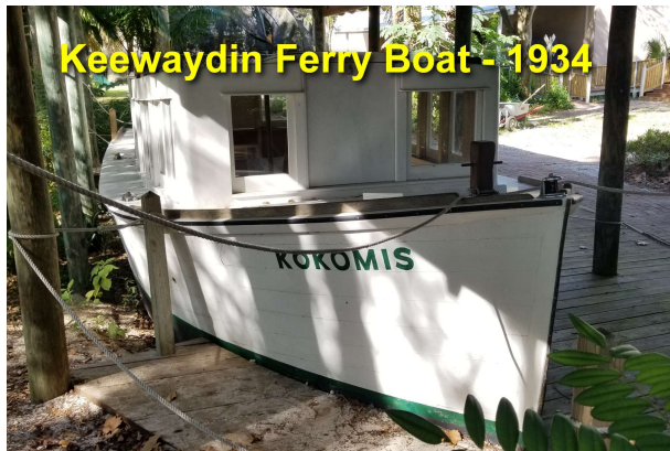
Keewaydin Ferry Boat - 1934