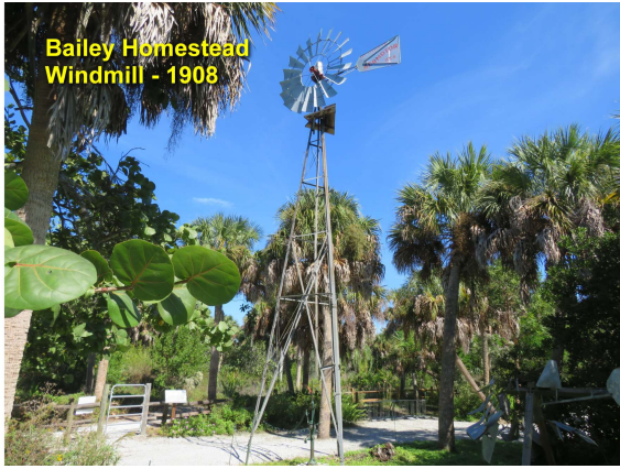
Bailey Homestead Windmill - 1908