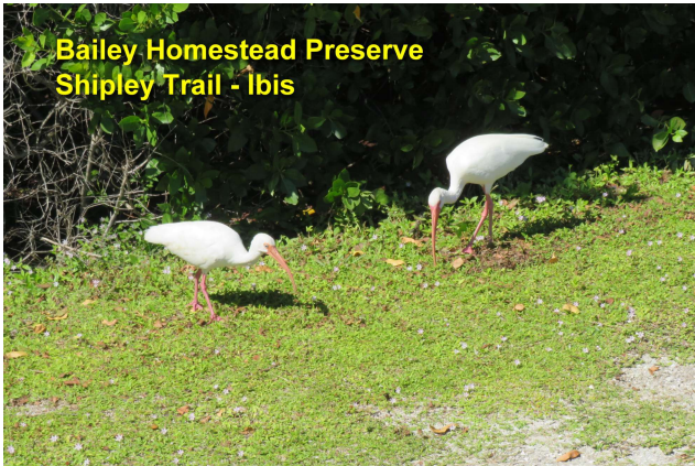
Bailey Homestead Preserve Shipley Trail - Ibis