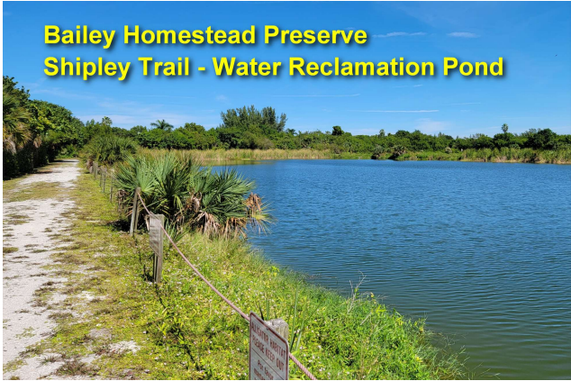
Bailey Homestead Preserve Shipley Trail - Water Reclamation Pond