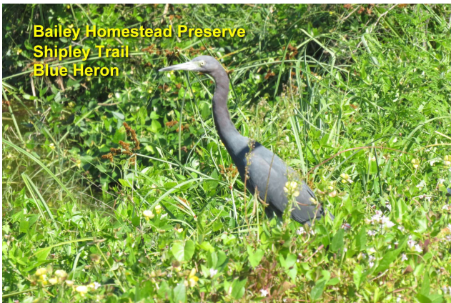
Bailey Homestead Preserve Shipley Trail - Blue Heron