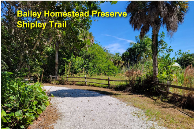
Bailey Homestead Preserve Shipley Trail