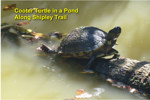
Cooter Turtle in a Pond Along Shipley Trail