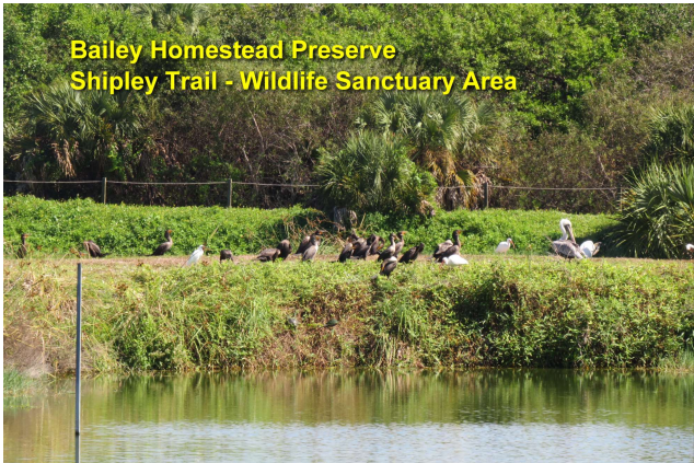
Bailey Homestead Preserve Shipley Trail - Wildlife Sanctuary Area