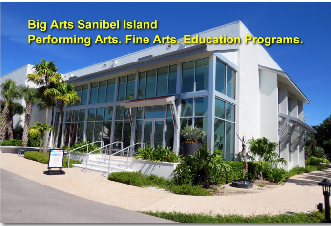
Big Arts Sanibel Island Performing Arts, Fine Arts, Education Programs.