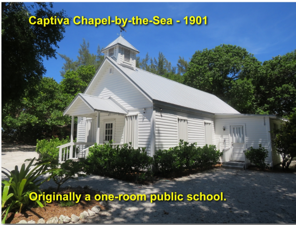
Originally a one-room public school.