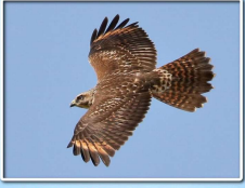
Adult in Flight (not my photo)