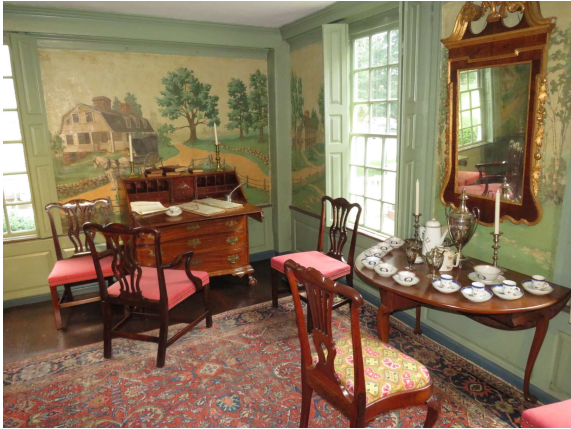
#22095 Joseph Webb House 1752