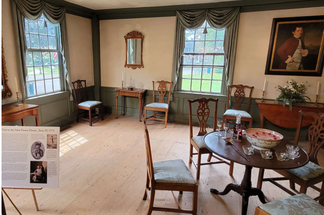
#21227 Silas Deane House 1766