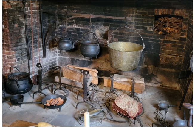
#21270 Silas Deane House 1766