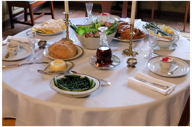
#21260 Silas Deane House 1766