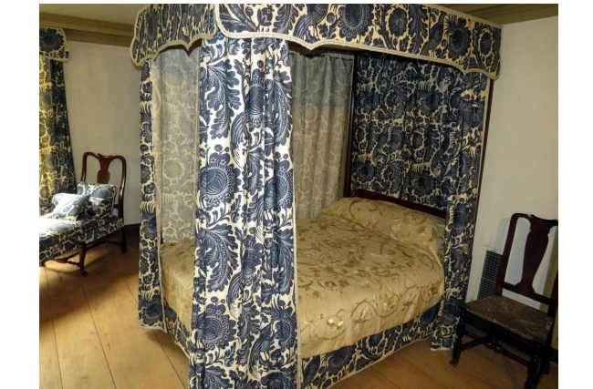
#21253 Silas Deane House 1766