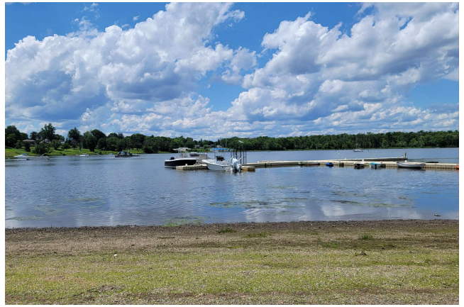
#35254 Wethersfield Cove