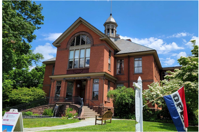
#34131 Keeney Memorial (Museum)