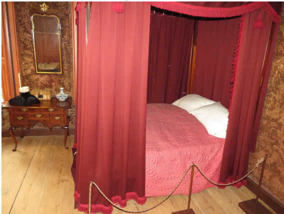
#22455 Joseph Webb House 1752