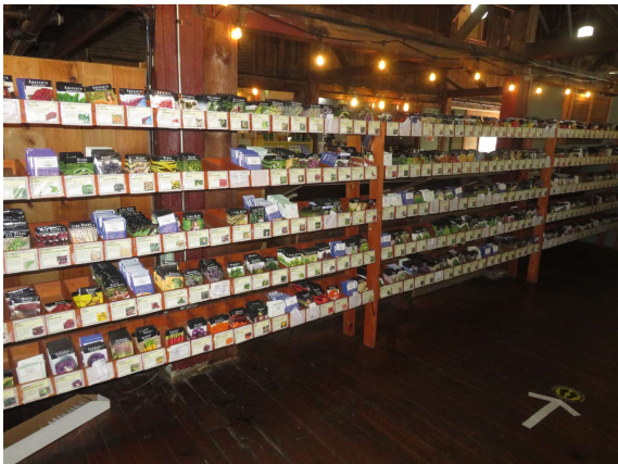
#42555 Comstock Ferre Seed Co