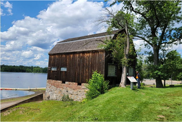
#35555 Cove Warehouse 1680