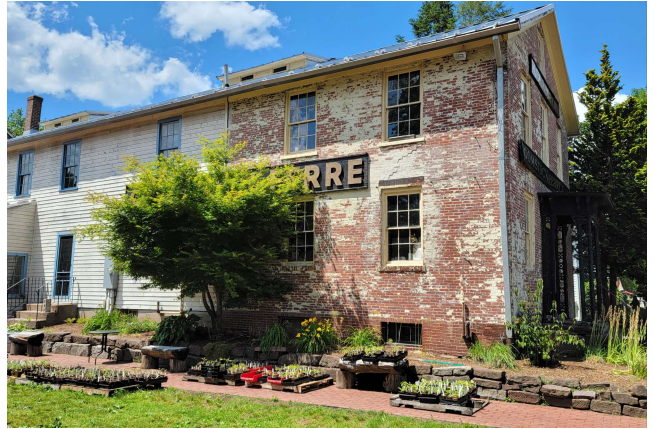
#42476 Comstock Ferre Seed Co