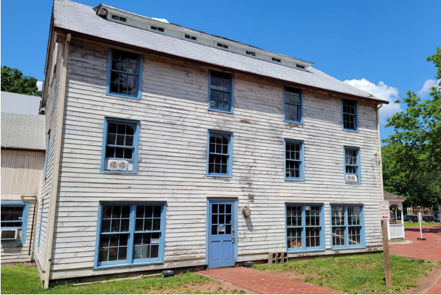
#42508 Comstock Ferre Seed Co