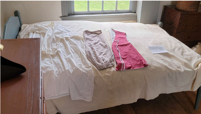
#21273 Silas Deane House 1766