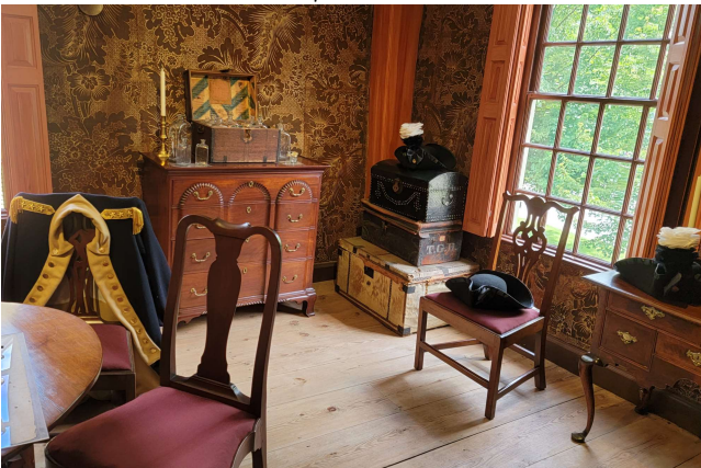
#22135 Joseph Webb House 1752