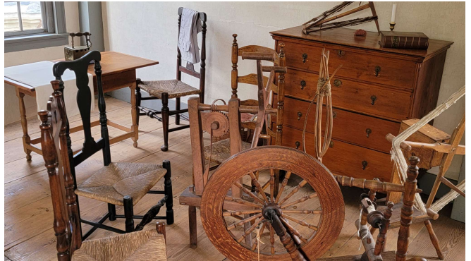
#21277 Silas Deane House 1766