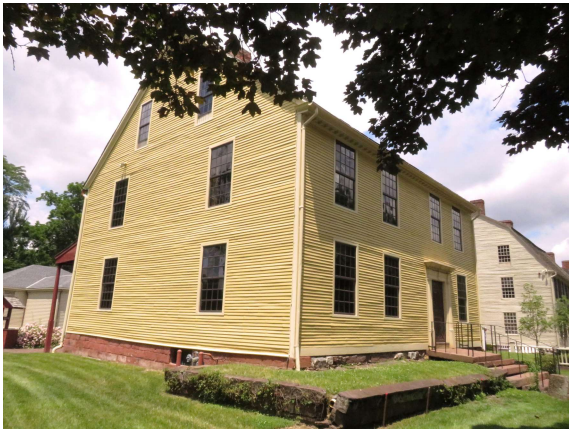
#21110 Silas Deane House 1766