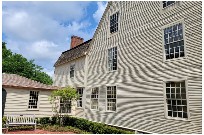
#22055 Joseph Webb House 1752