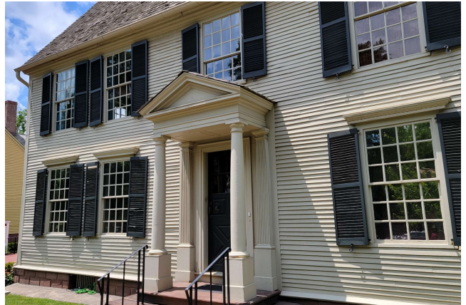
#22037 Joseph Webb House 1752