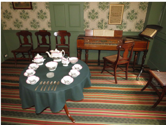
#24268 Isaac Stevens House 1788