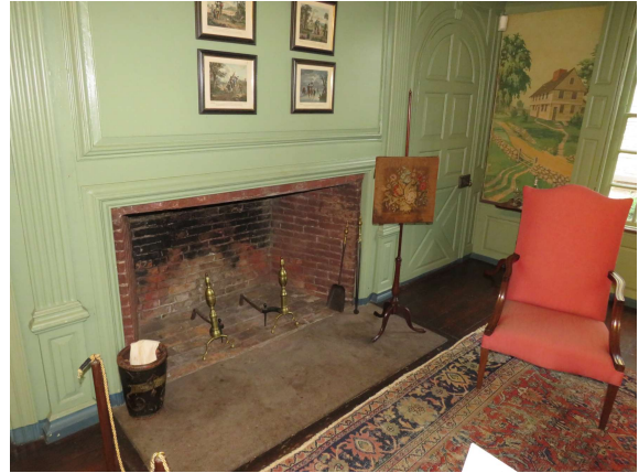
#22098 Joseph Webb House 1752