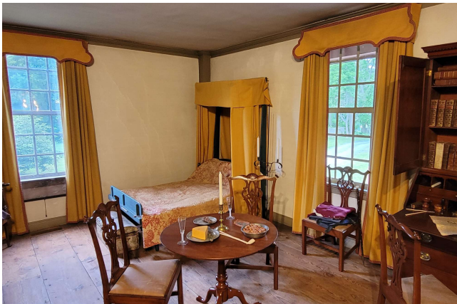
#21250 Silas Deane House 1766