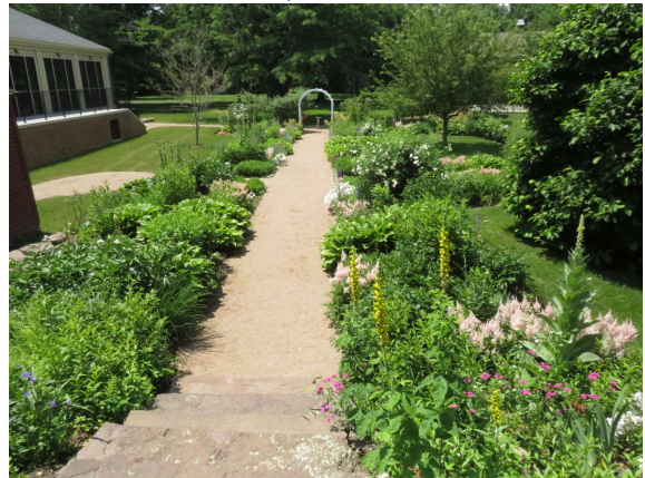
#22532 Webb House Gardens