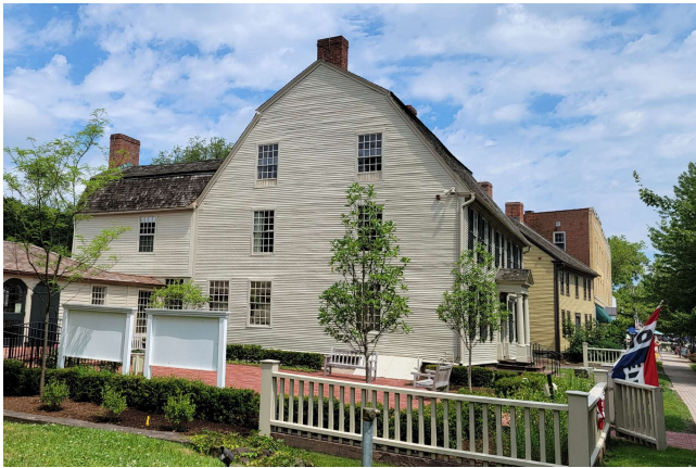
#20410 Webb Deane Stevens Museum