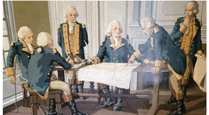
#22133 Joseph Webb House 1752