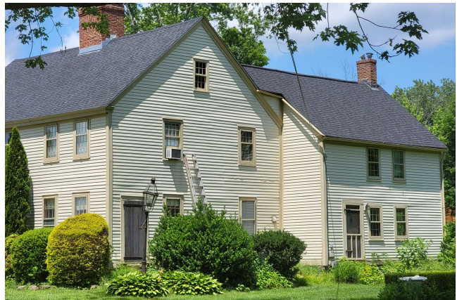
#34155 Coffin Door