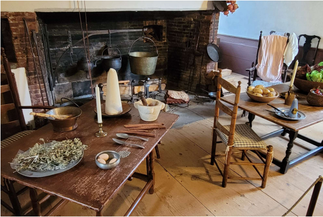
#21264 Silas Deane House 1766