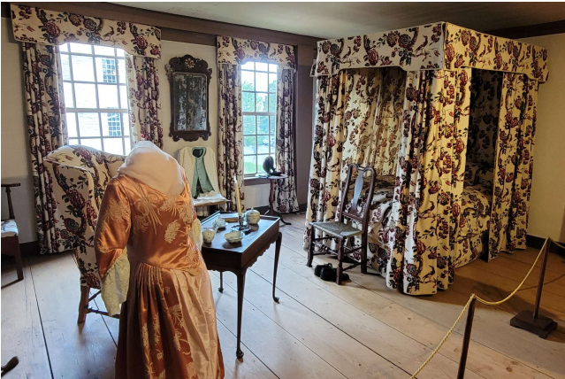
#21289 Silas Deane House 1766