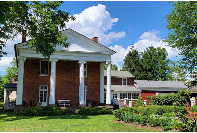
#34161 240 Main St