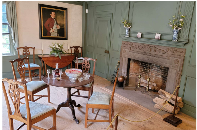
#21135 Silas Deane House 1766