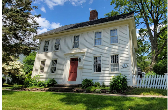
#34140 Saml Woodhouse House 1748