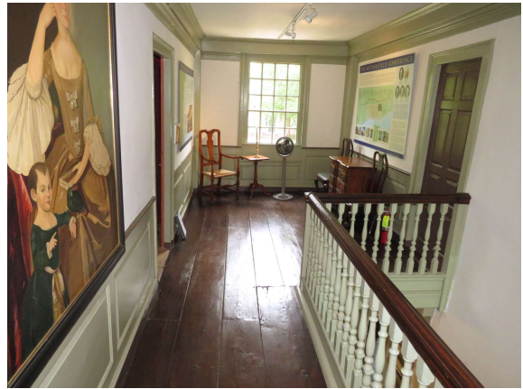
#22452 Joseph Webb House 1752