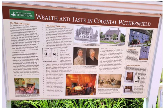
#20412 Webb Deane Stevens Museum