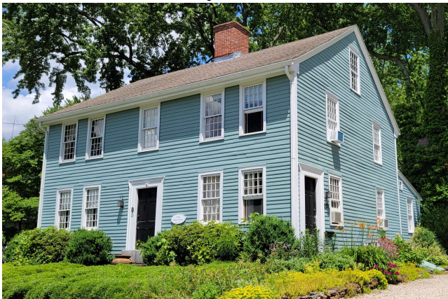
#34152 Misc House with Coffin Door Saml Boardman House 1769