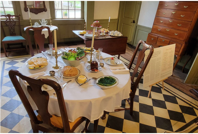
#21255 Silas Deane House 1766