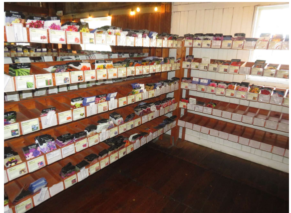
#42558 Comstock Ferre Seed Co