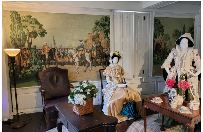
#22143 Joseph Webb House 1752