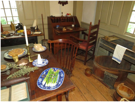
#24272 Isaac Stevens House 1788