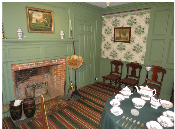
#24270 Isaac Stevens House 1788