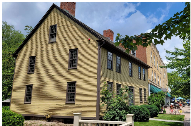
#24258 Isaac Stevens House 1788