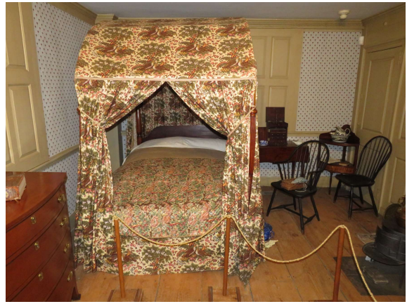
#24274 Isaac Stevens House 1788