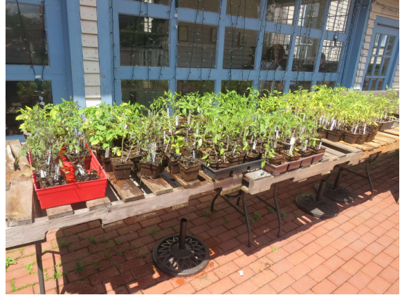
#42548 Comstock Ferre Seed Co