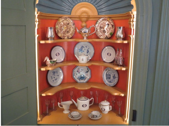
#22105 Joseph Webb House 1752