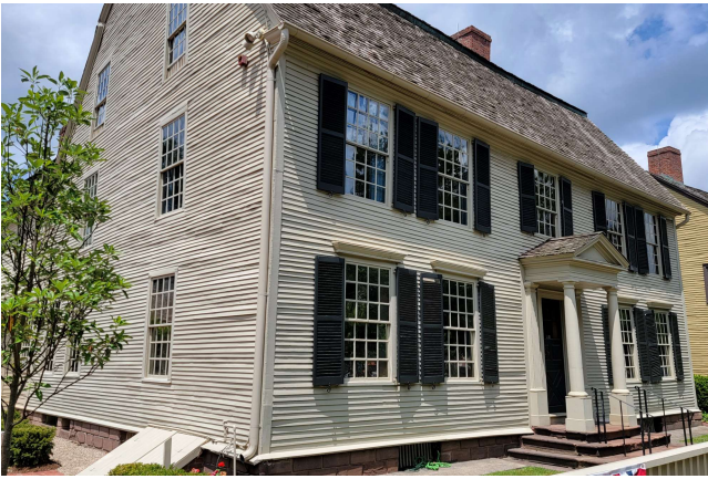
#22040 Joseph Webb House 1752