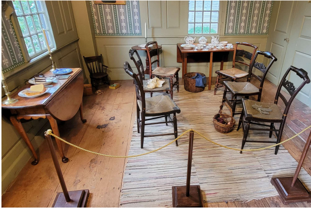
#24277 Isaac Stevens House 1788