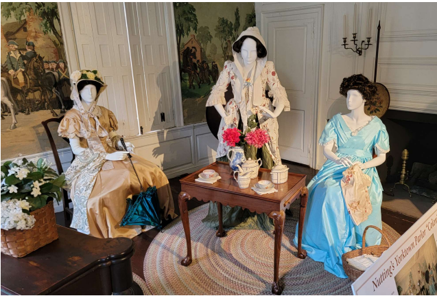
#22144 Joseph Webb House 1752