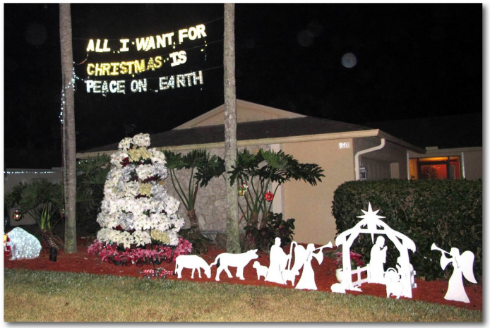
Victoria Park Christmas Lights

ALL I WANT FOR CHRISTMAS IS PEACE ON EARTH