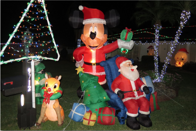
Victoria Park Christmas Lights