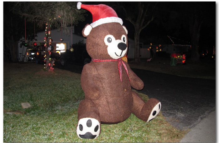
Victoria Park Christmas Lights