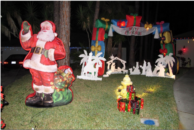
Victoria Park Christmas Lights