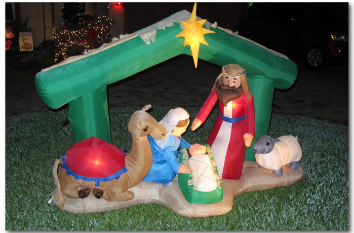
Victoria Park Christmas Lights