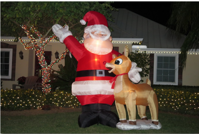
Victoria Park Christmas Lights