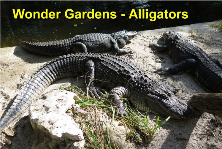
Wonder Gardens - Alligators