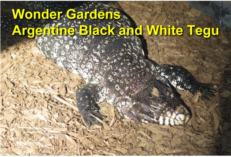
Wonder Gardens Argentine Black and White Tegu