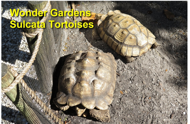
Wonder Gardens Sulcata Tortoises