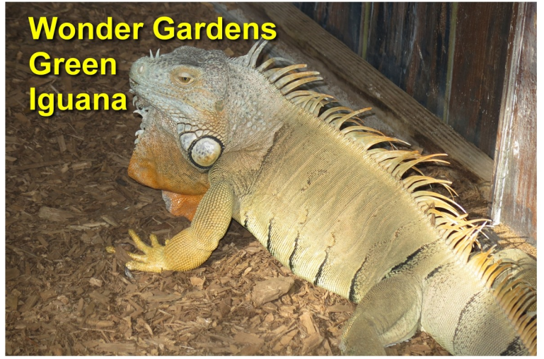
Wonder Gardens Green Iguana