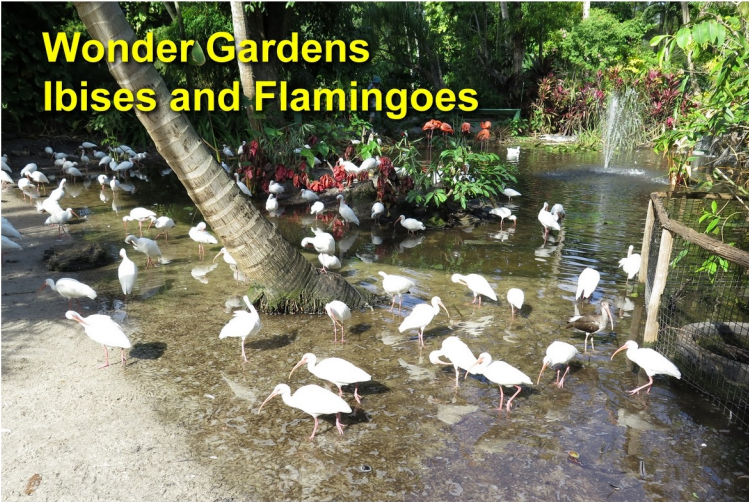
Wonder Gardens Ibises and Flamingoes