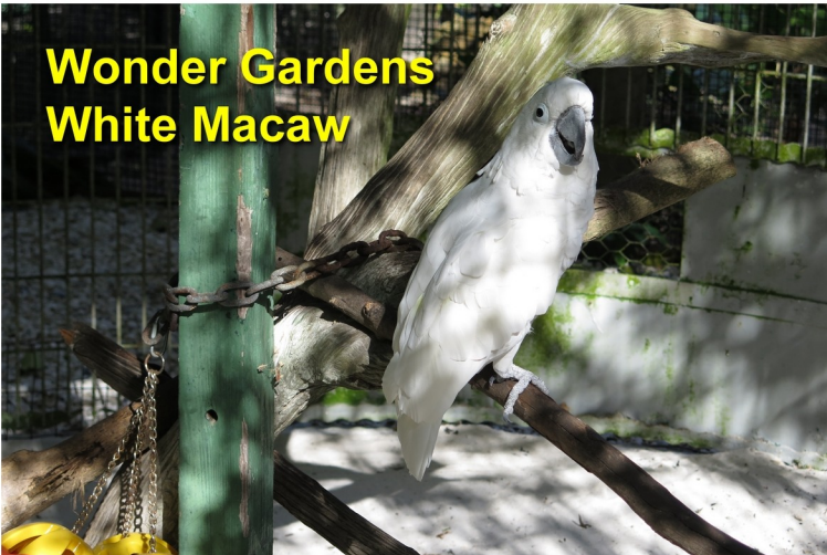
Wonder Gardens White Macaw