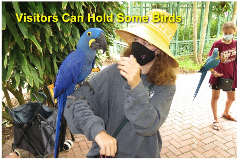
Visitors Can Hold Some Birds