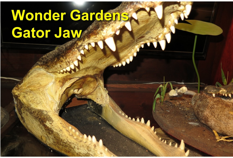
Wonder Gardens Gator Jaw