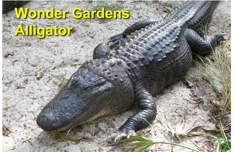
Wonder Gardens Alligator