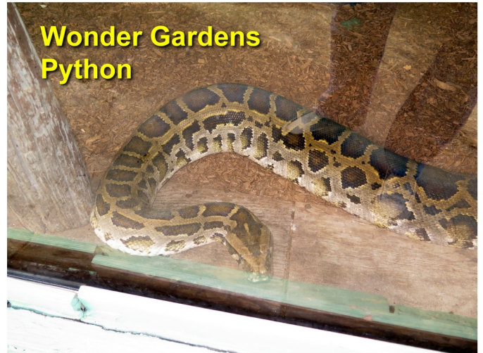
Wonder Gardens Python