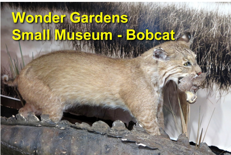
Wonder Gardens Small Museum - Bobcat