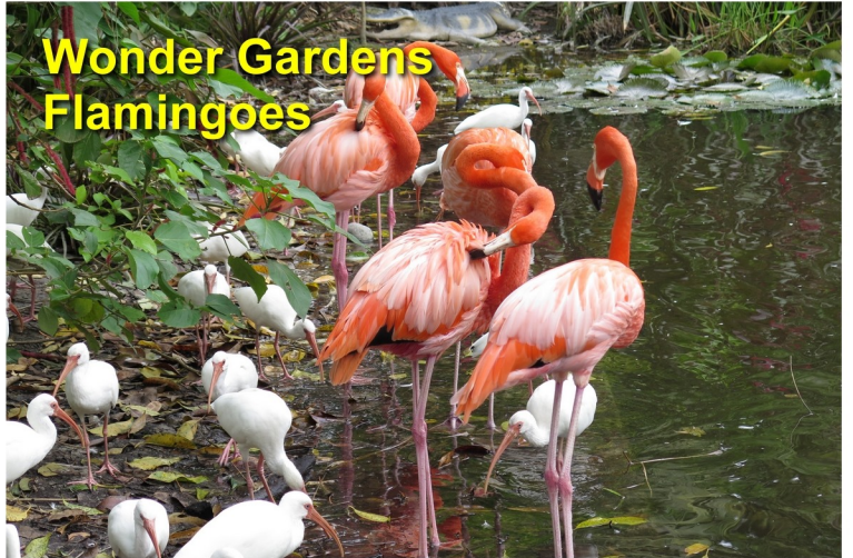
Wonder Gardens Flamingoes