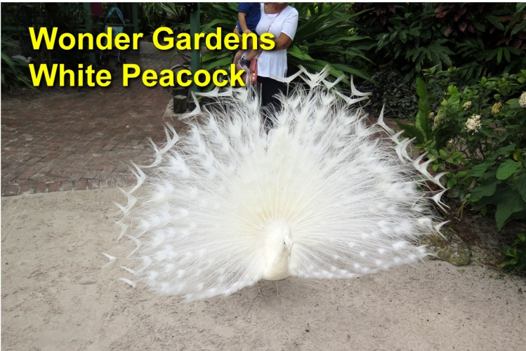
Wonder Gardens White Peacock