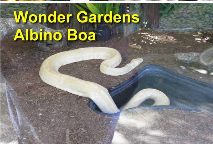
Wonder Gardens Albino Boa