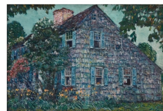
Childe Hassam (American, 1859-1935). Old House, East Hampton, 1917. Oil on canvas, 20 x 30 1/8 inches. Bank of America Collection.