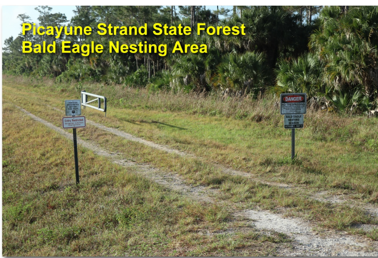
Picayune Strand State Forest Bald Eagle Nesting Area