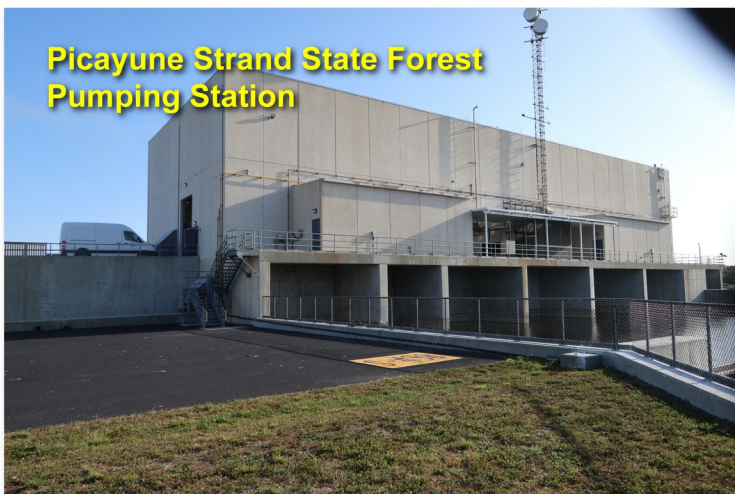
Picayune Strand State Forest Pumping Station