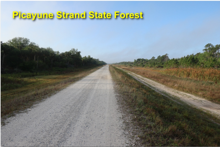
Picayune Strand State Forest