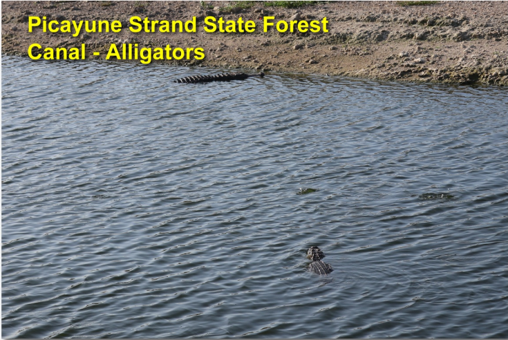
Picayune Strand State Forest Canal - Alligators