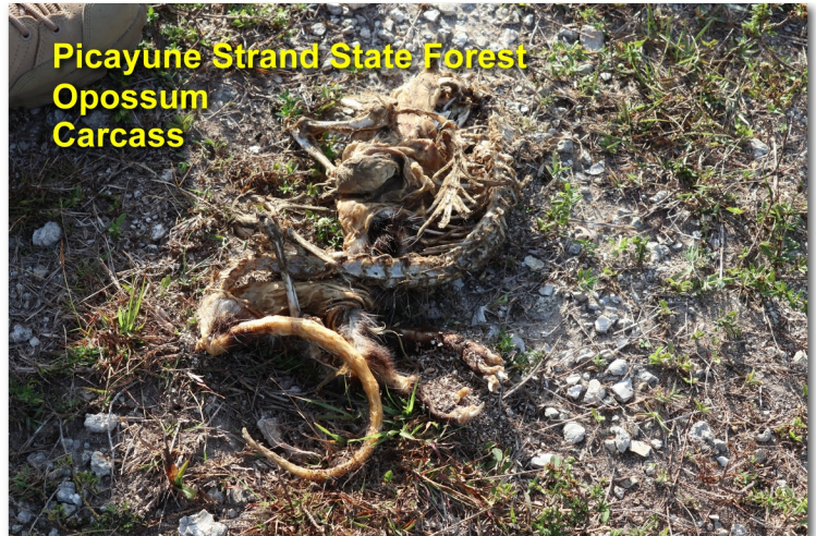
Picayune Strand State Forest Opossum Carcass