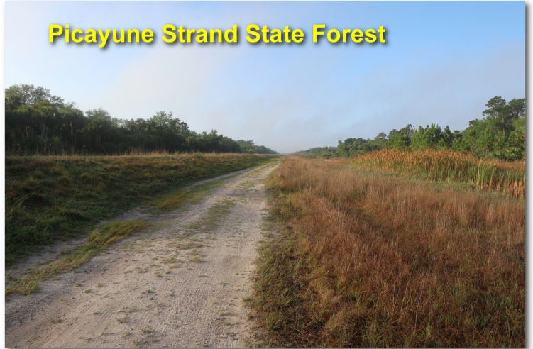
Picayune Strand State Forest