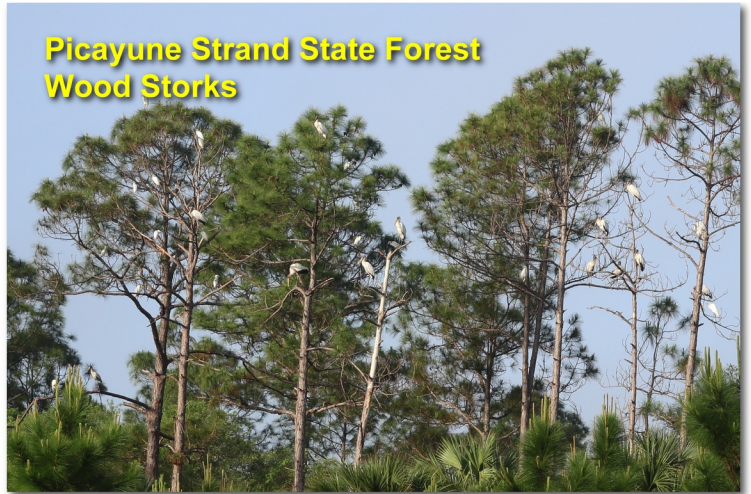
Picayune Strand State Forest Wood Storks