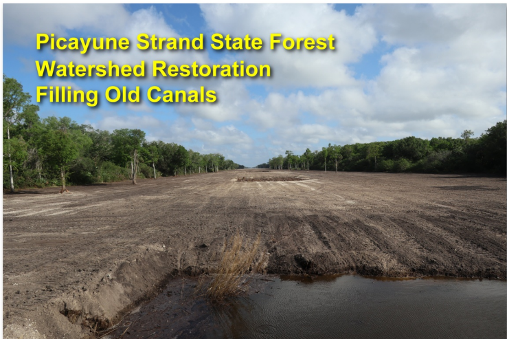
Picayune Strand State Forest Watershed Restoration Filling Old Canals