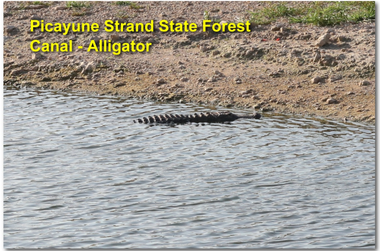
Picayune Strand State Forest Canal - Alligator