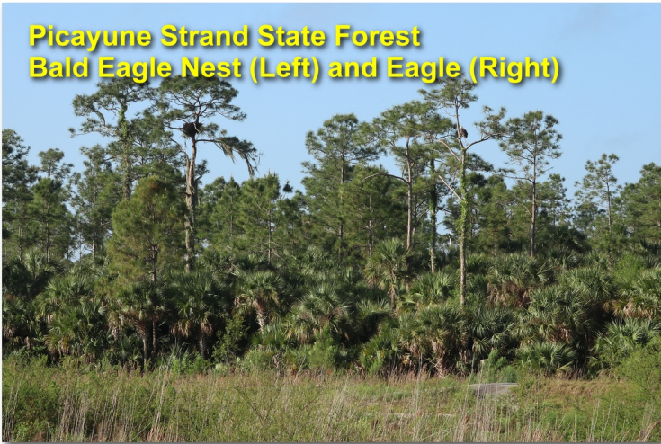
Picayune Strand State Forest Bald Eagle Nest (Left) and Eagle (Right)