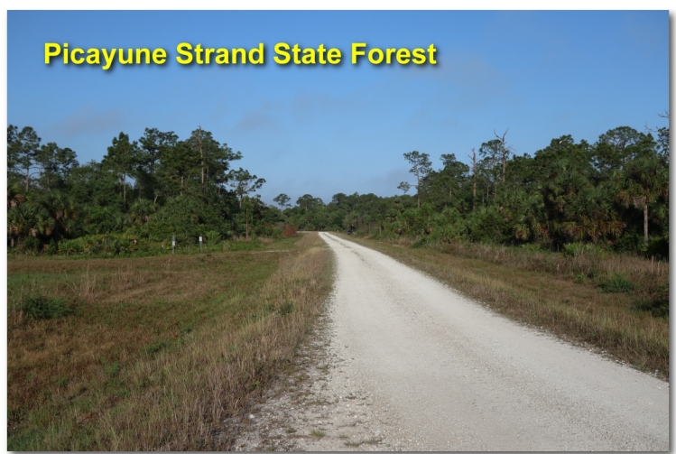
Picayune Strand State Forest