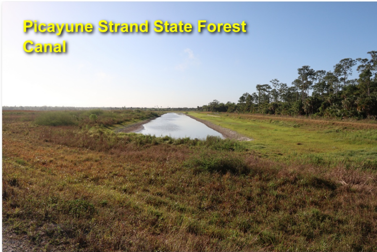
Picayune Strand State Forest Canal