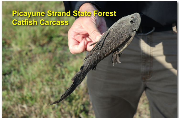
Picayune Strand State Forest Catfish Carcass