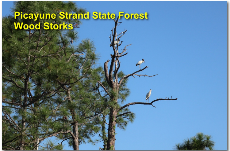
Picayune Strand State Forest Wood Storks