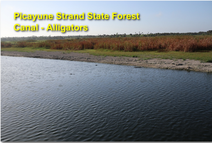
Picayune Strand State Forest Canal - Alligators