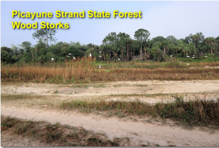
Picayune Strand State Forest Wood Storks