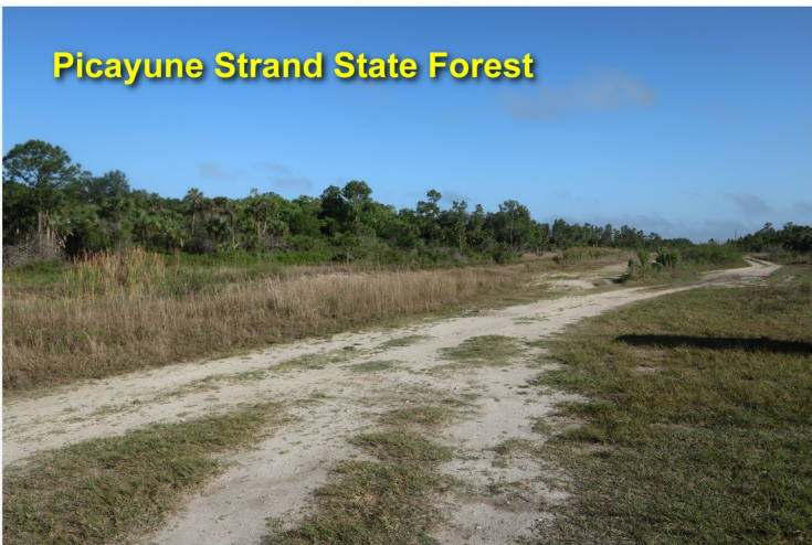
Picayune Strand State Forest