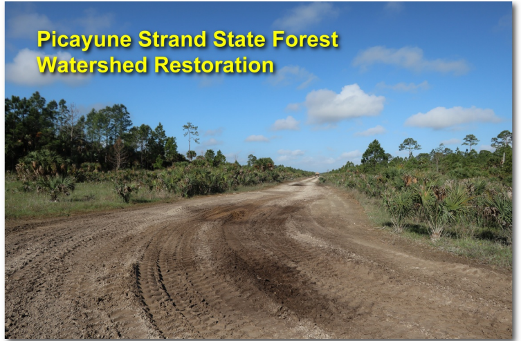
Picayune Strand State Forest Watershed Restoration