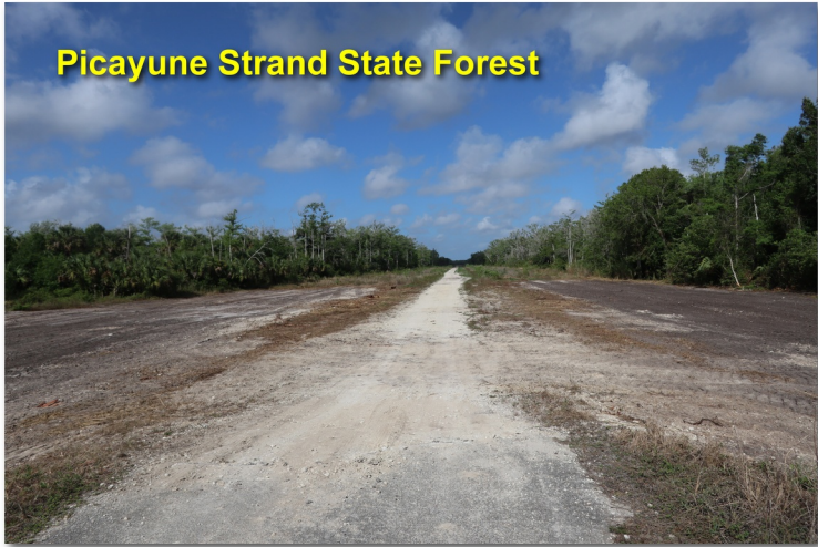
Picayune Strand State Forest