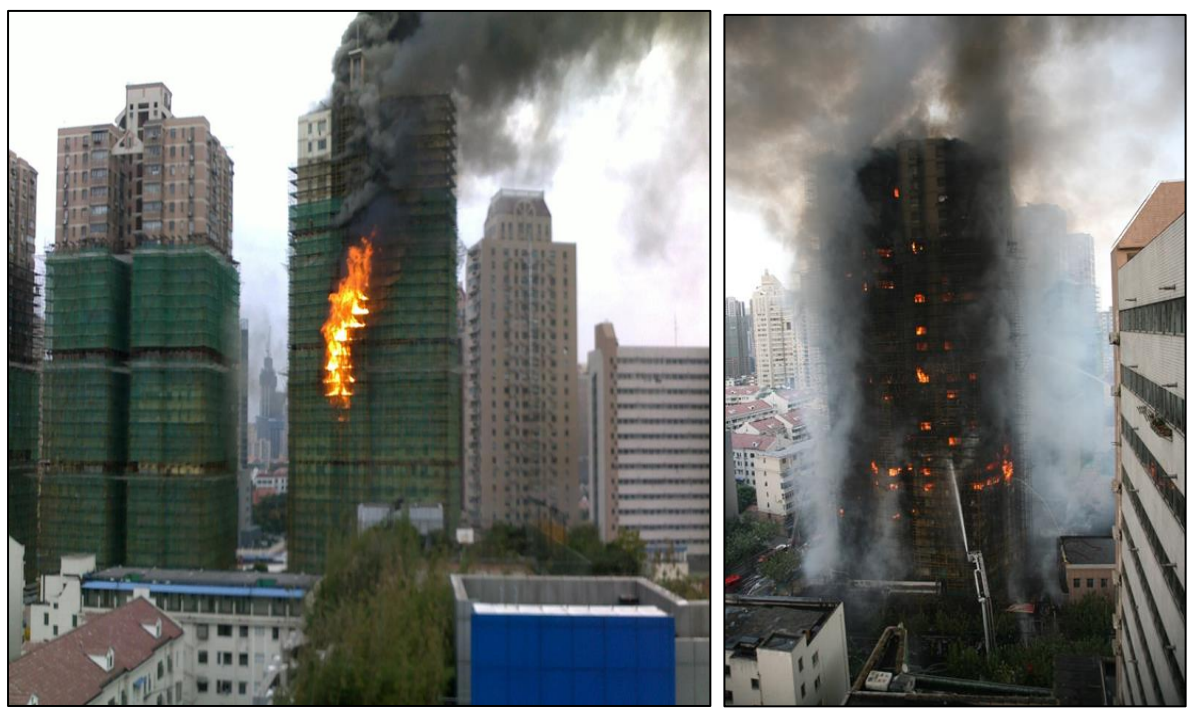
Figures 1 and 2 – The high-rise apartment building fire at Jiaozhou Road, Shanghai, China 2010

External wall fires are becoming more common and firefighters worldwide are gaining a major learning experience in witnessing such fire spread first hand, or from afar. It is certain that global media coverage ensures firefighters won't forget what their eyes saw on a TV screen, leaving a permanent memory but then also enabling them to consider in advance their tactical and strategic approaches to such a conflagration. How critical is a speedy and fire service supported evacuation as opposed to 'defend in place' tactics?