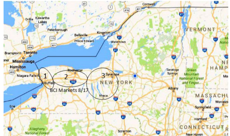
Map of Travel Markets (approximate coverage, not to scale)

Warehouse Location: 27 Morgan St., Akron, NY 14001