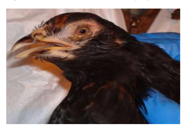
Figure 2. A chicken infected with Mycoplasma

Gray eye is another form of Marek's, in which the iris shrinks, the eye turns gray, and the bird goes blind. Fortunately, a vaccine for Marek's Disease is available and most poultry suppliers sell chickens that are already vaccinated for the disease.