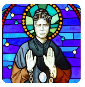
St. Josephine Bakhita