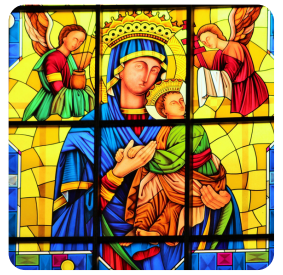
Our Blessed Mother Mary