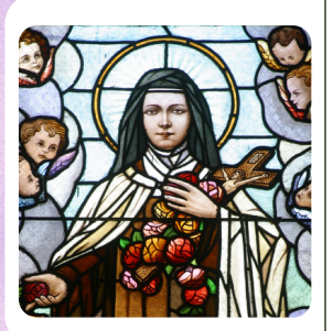
St. Therese of Lisieux