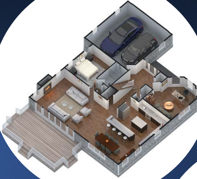
5 Bedroom Monarch Model