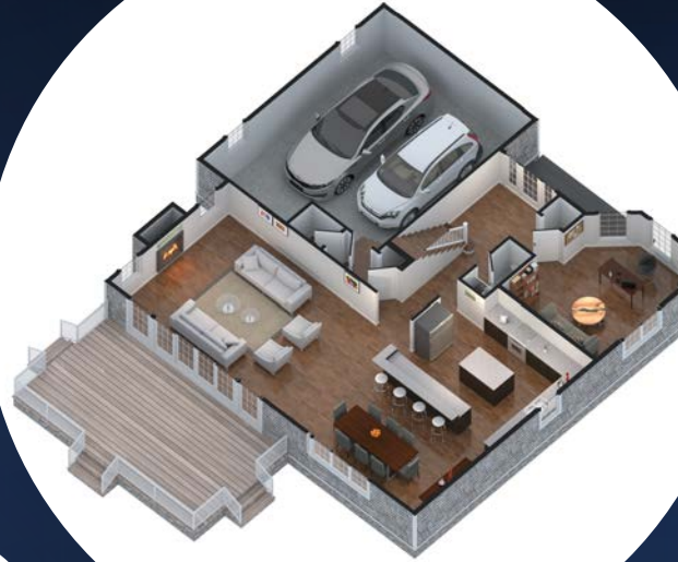
4 Bedroom Imperial Model