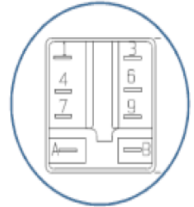
New relay, DPDT