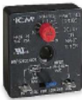
Time delay relay ICM102