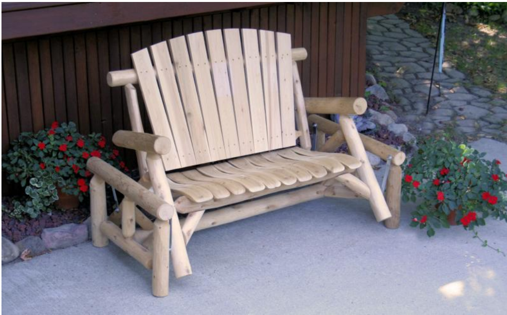
Glider (#CFU139) (left) With contoured seat slats. 59”L x 32”D x 40”H Seat 43W”, 19”D