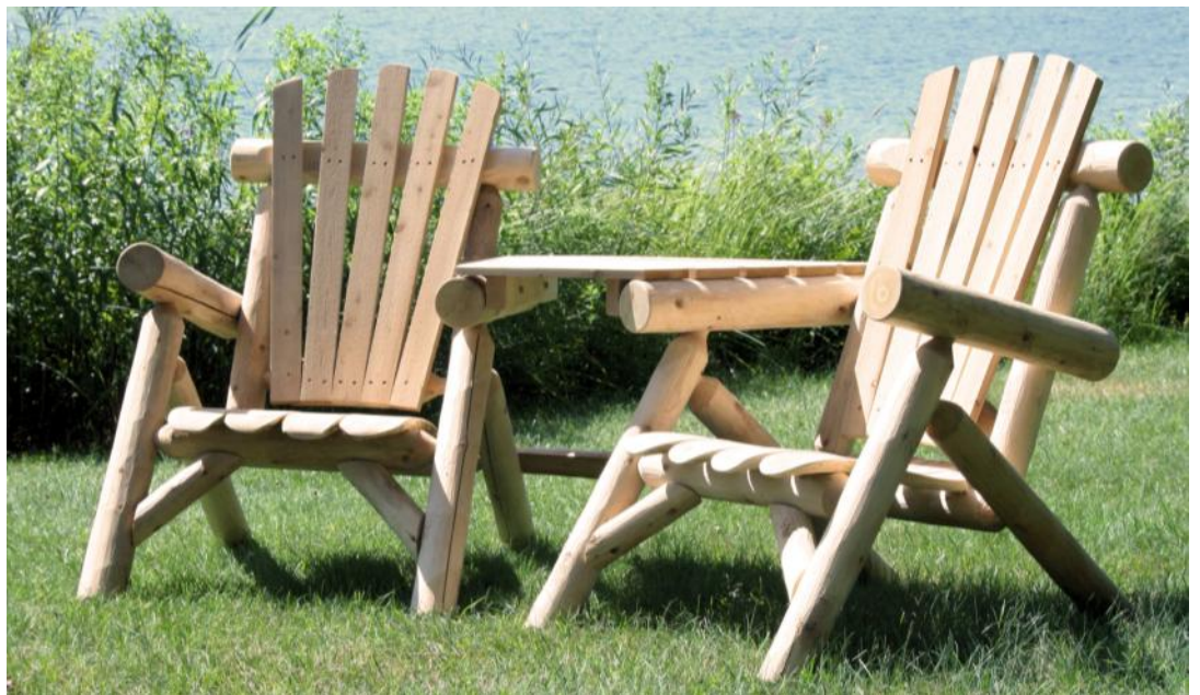
Visa-Tete (#CF1329) (right) With contoured seat slats 72” L x 36” D x 39”H Table Size - front 15” W, back 31”W, 19”D Seat 19W”, 19”D (cedar table top)