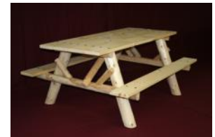
47" Roundabout Table (#CF1247), 47"W, 47"L, 30"H ( pine table top ). ( below-right )