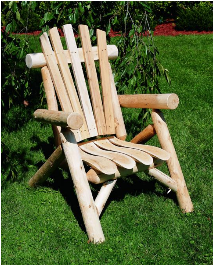
Lounge Chair (#CF1126) (above) With contoured seat slats 28"W, 30"D, 39"H Seat 19"W", 19"D