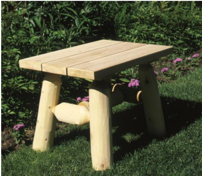
End Table (#CF1222) (pine table top) 17"W x 23"D x 18"H