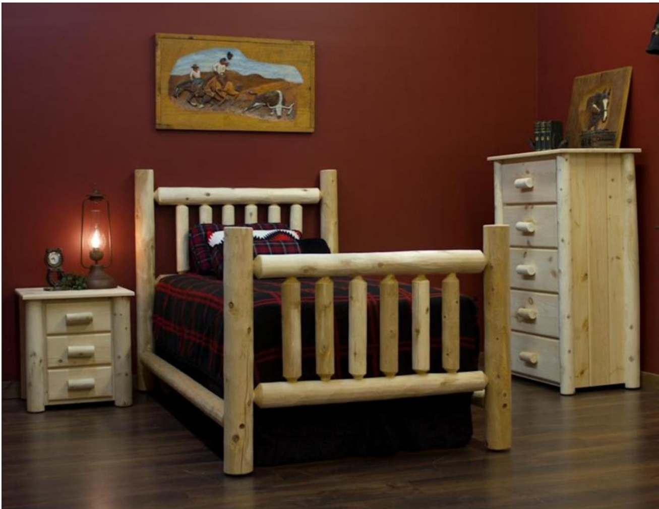
Cedar Twin Low Post Bed (#ALT38) - 48”H, 88”L, 42”W; Frontier Three Drawer Night Stand (#HNS3) - 24”H, 21”W, 20”D; Frontier Five Drawer Chest - (#H5) 52”H, 32”W, 20”D.