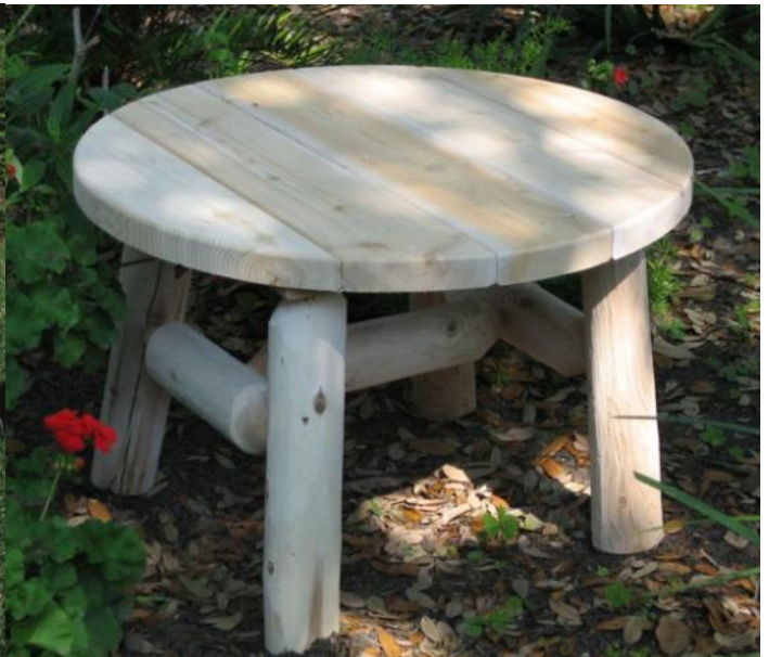
Round Coffee Table (#CF1227) (pine table top) 25" dia. X 18"H