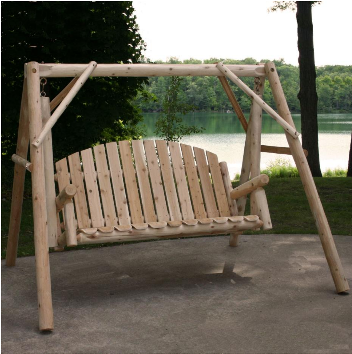
5' Country Garden Yard Swing (#CF85) (left) with contoured seat slats. Swing width: 71", height, 65" A-Frame depth 70", width 87" Seat depth 19", width 54"