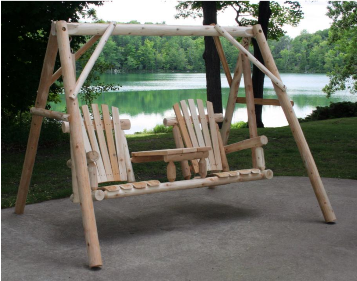
Tete-A-Tete Yard Swing (#CF1119) (left) -With contoured seat slats Swing width 71", height 65", A-frame depth 70", width 87" Seat depth 19", width 19" (pine tabletop)