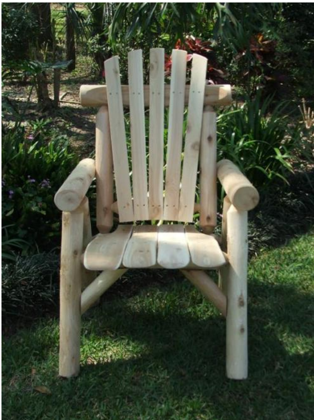
Dining Chair (#CF1130) (left & below) With contoured seat slats. 28"W x 26"D x 42"H; Seat 19"W, 19"D