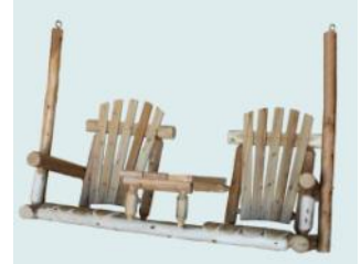
Tete-A-Tete Porch Swing (#CF1009) (above) -With contoured seat slats Swing width 71", height 47" Seat depth 19", width 19" (pine tabletop)