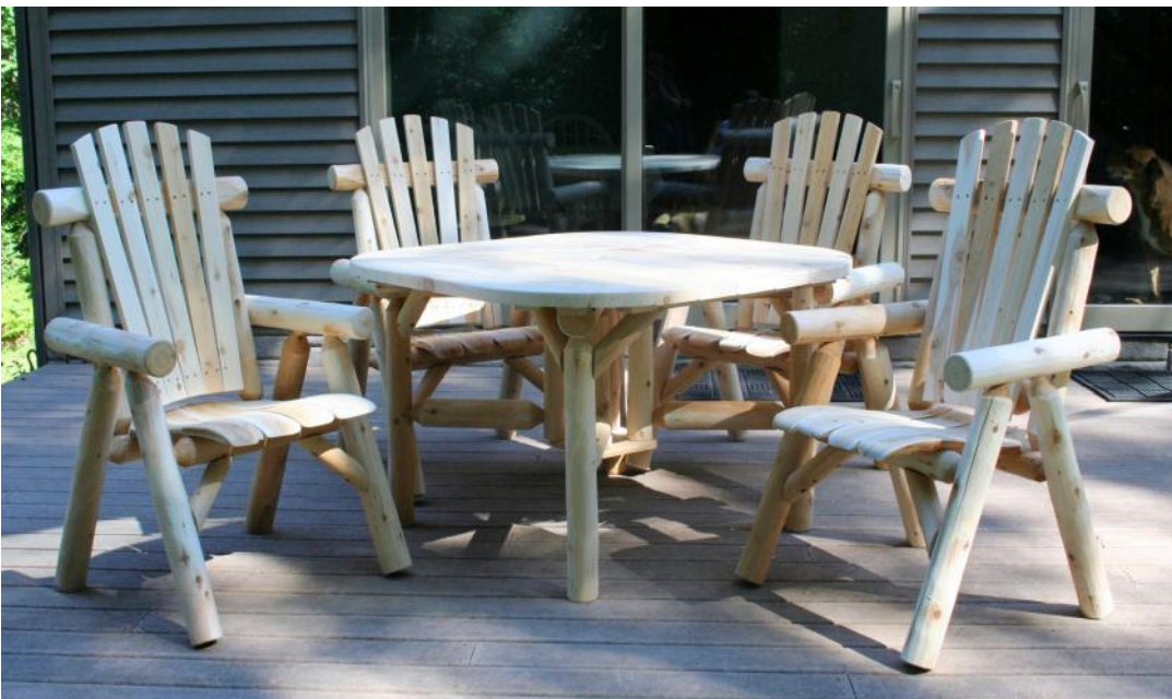
Table Groupings: (#CF4730) Roundabout table with 4 Dining chairs ( CF1130 ) ( left )- (#CF4723) Roundabout table with 4 (2-pair) Straight benches ( CF1223 ) ( pine bench tops ) ( below-left )