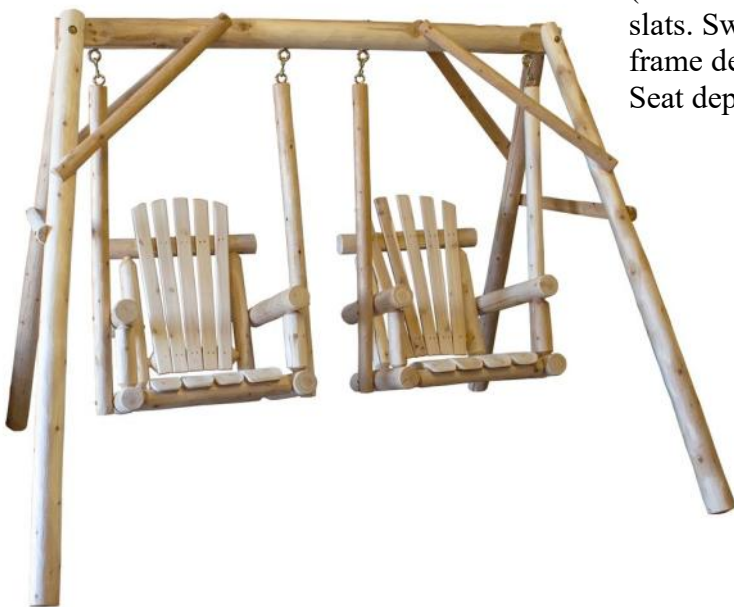
Single Chair Porch Swing (#CF26) As shown above in Double Chair Swing. With contoured seat slats Swing width 31", height 47" Seat 19"W, 19"D

Available to purchase individually : 4' & 5' A-Frames