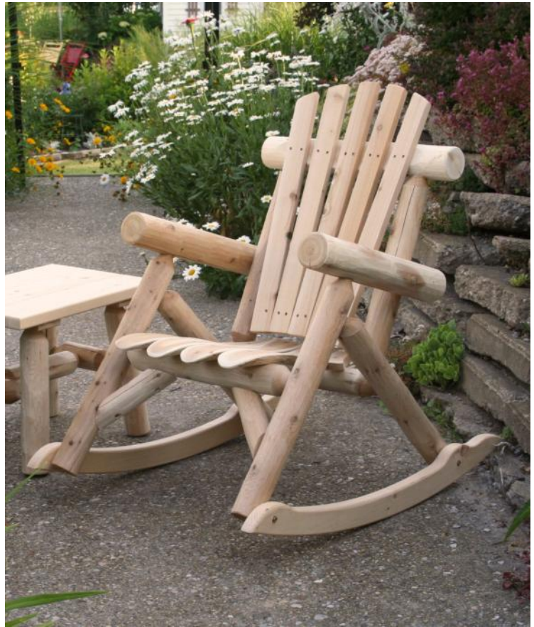
Rocking Chair (#CF1125) (above) With contoured seat slats 31"W, 42"D, 41"H Seat 19"W", 19"D (pine rockers) Also pictured: CF1222