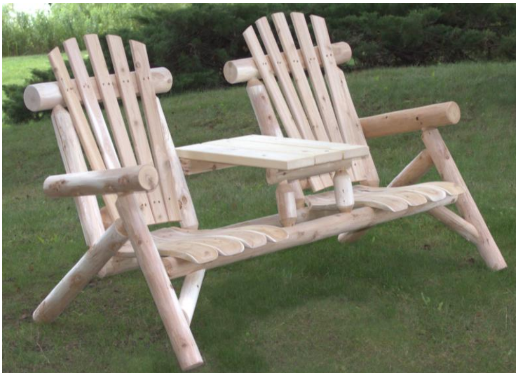
Tete-A-Tete (#CF1229) (left) With contoured seat slats 66” L x 30”D x 39” H Table Size - 16”W x 23”D Seat 19W”, 19”D (pine table top)