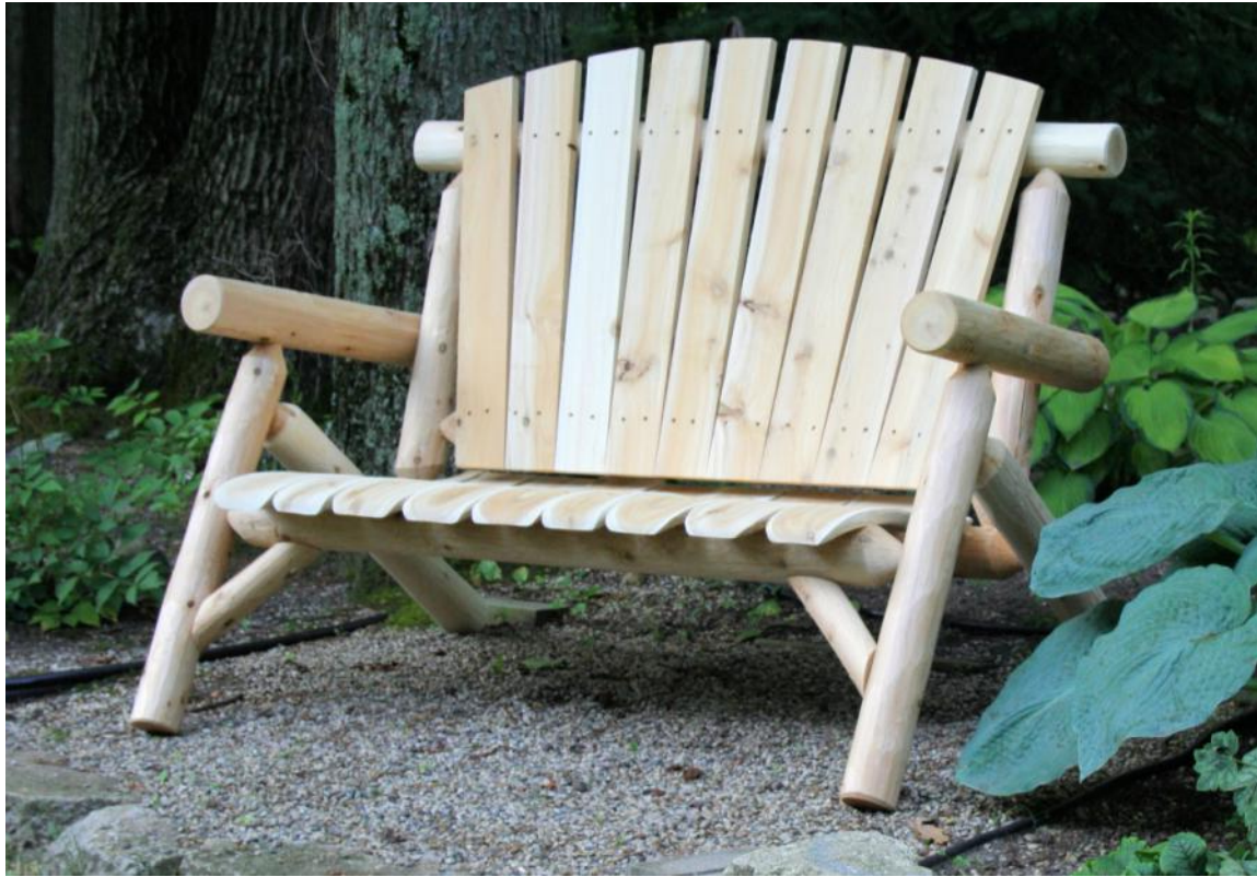
Love Seat (#CF1148) ( left ) With contoured seat slats 50"W, 30"D, 39"H Seat 43W", 19"D