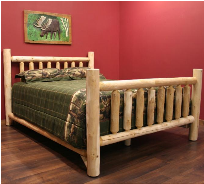
Cedar Low Post Queen Bed (#ALQ60) (left)- 48”H, 93-95”L, 65”W;