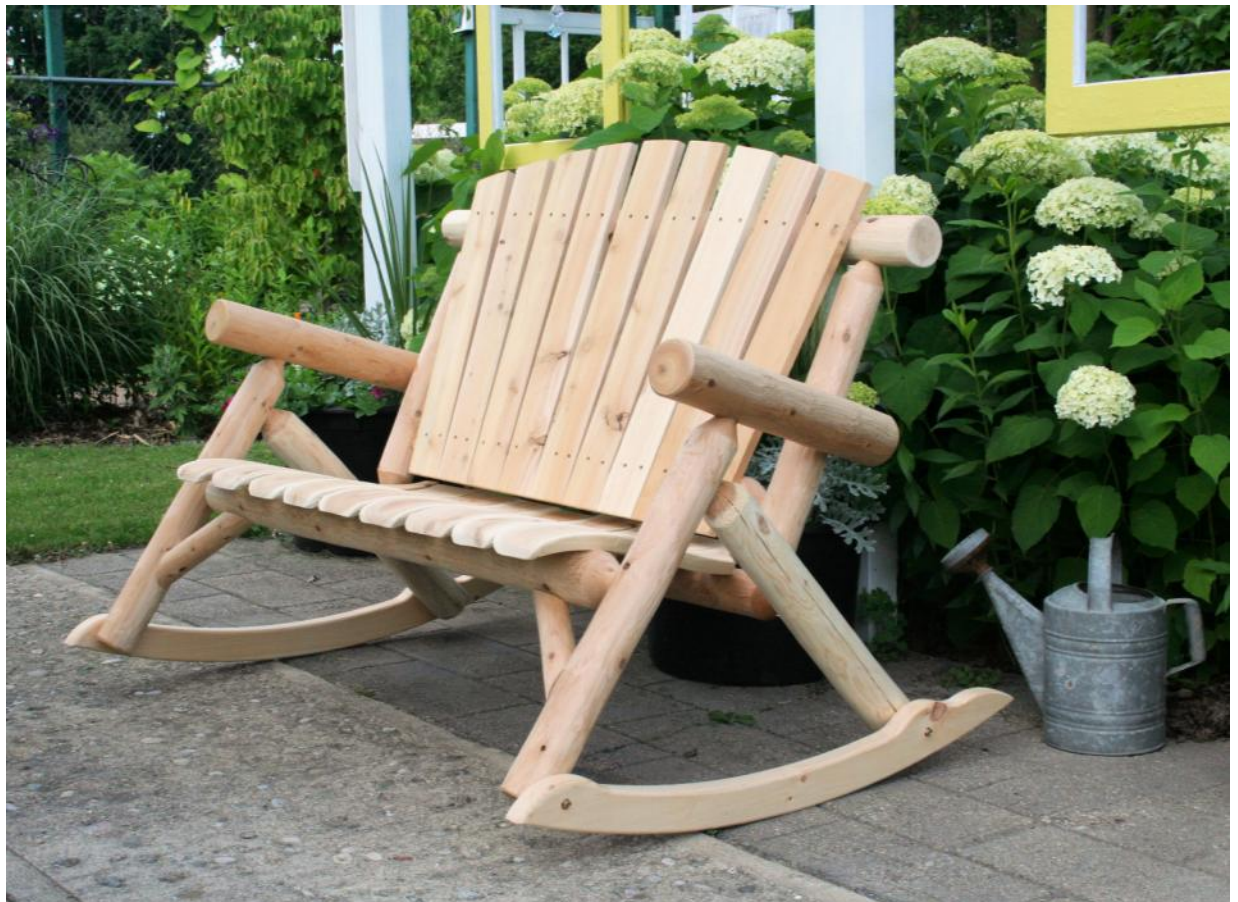
Rocking Love Seat (#CF1145) ( right ) With con- toured seat slats. 53"W x 30"D x 41"H Seat 43W", 19"D