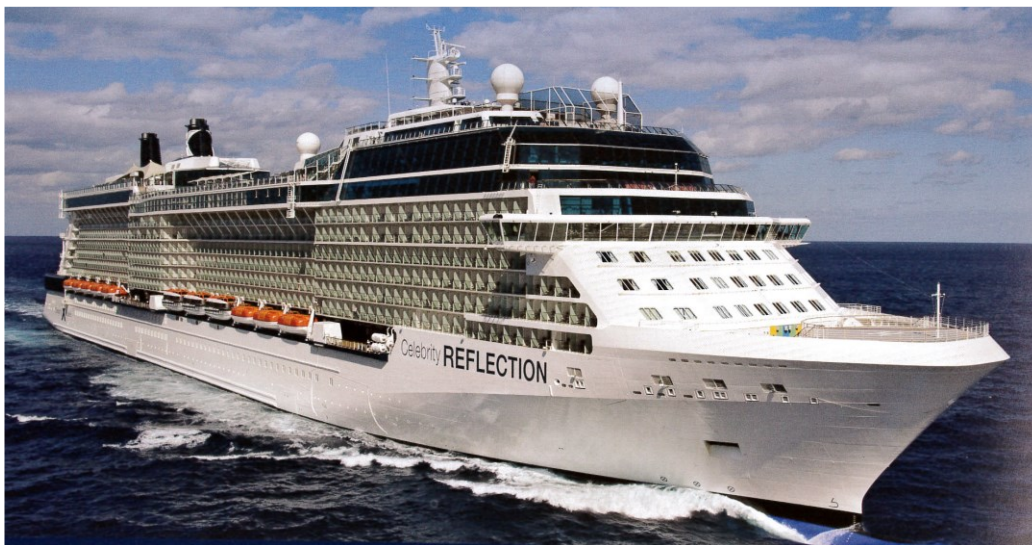
The Solstice Class of Ships

We will leave Ohio on Wednesday, January 29 th and overnight in Ft. Lauderdale Florida at the Fairfield Inn & Suites. Breakfast is included Thursday morning before we board our ship. The Celebrity Eclipse first sailed in 2010 and was refurbished in 2015. She carries 2850 passengers.