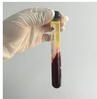
PRP tube after centrifugation