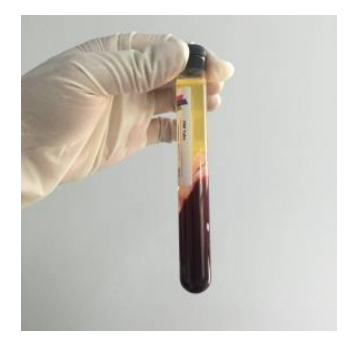
PRP tube after centrifugation