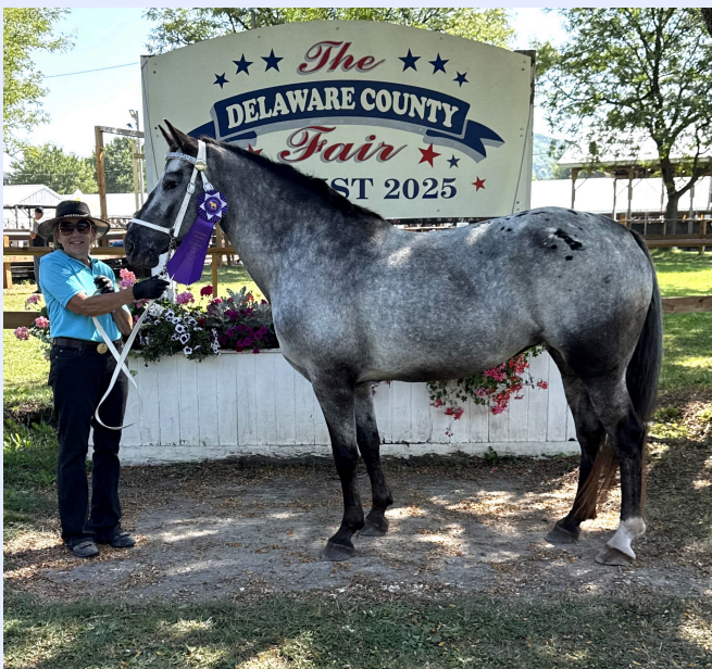
Pictured Above "Beyonce"