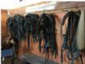
Assorted harness Call for details