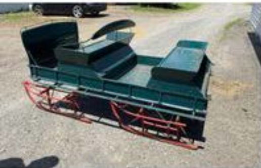
Pony Bob Sled - maker unknown, Circa 1910 Green with red gear, shafts & pole for team or single pony. 4 Passengers. Original Condition Asking$ 600