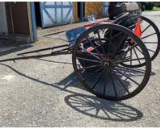
Maroon Serafin Cart $1250