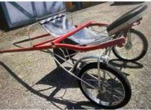
Training Cart , (one shaft has been repaired) $250