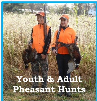
Youth & Adult Pheasant Hunts