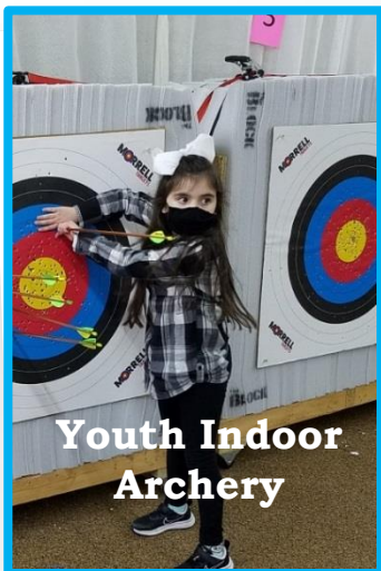
Youth Indoor Archery