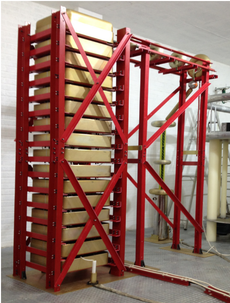
Custom DTI 400 kV, 400 mA DC Power Supply.

All PowerMod™ power supplies are available in custom configurations to meet your specific system requirements. Integrate your PowerMod power supply with a DTI PowerMod Pulse Modulator for the best choice in complete pulse power systems.