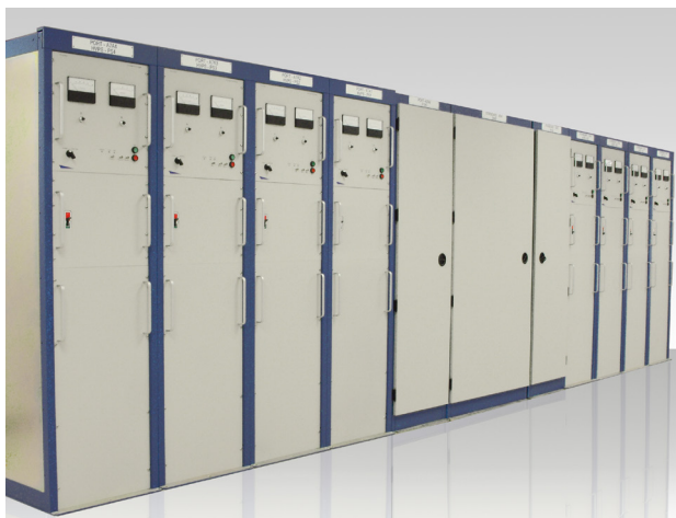
Eight 200 kW shipboard DTI PowerMod™ Power Supplies and 480 VAC power distribution providing 1.6 MW DC power for a radar transmitter.

DTI high voltage power supplies use front panel controls and rear panel connectors that enable local or remote control, with internal overcurrent, overvoltage, and fault protection. All control systems are fully isolated from the EM effects of high voltage switching via noise-immune fiber-optic interfaces. Component inputs and outputs are fully protected against overvoltages, fast transients, and short circuits, for reliable operation with demanding loads.