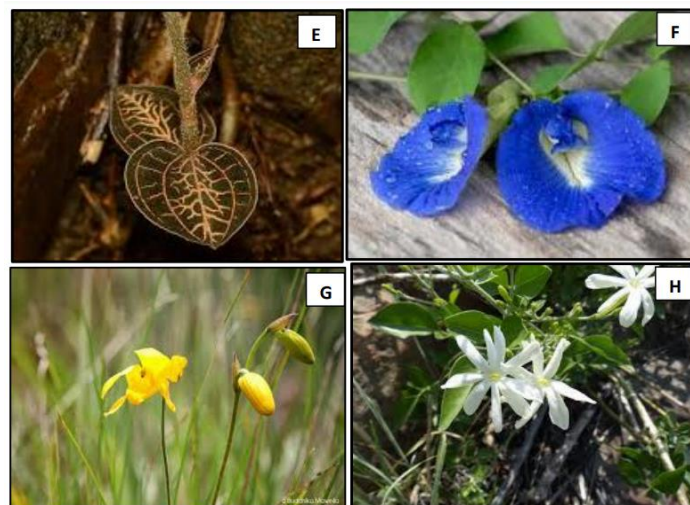
Figure 2. (E) Anoectochilus reinwardtii (English-

Marbled Jewel Orchids, Family:Orchidaceae), (F) Clitoria ternatea (English- Blue butterfly pea, Family:Leguminosae), (G) Ipsea speciosa (English-Daffodil orchids, Family:Orchidaceae), (H) Jasminum angustifolium (English- Wild jasmine, Family: Oleaceae).