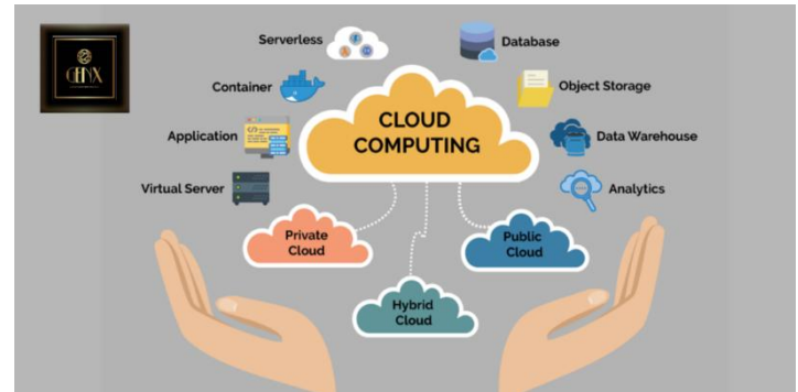
Fig. 2. Cloud computing

intelligent farming systems. AI algorithms can predict irrigation needs, detect diseases, and optimize farm operations.