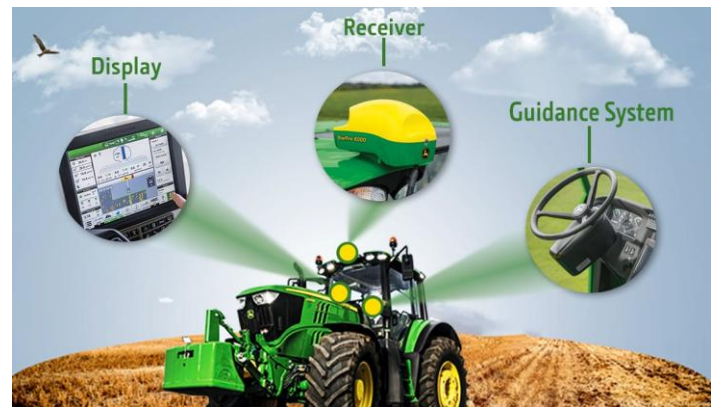
Fig. 2. Precision Agriculture Machinery

Precision farming technologies also support climate adaptation by helping farmers make informed decisions based on real-time data.