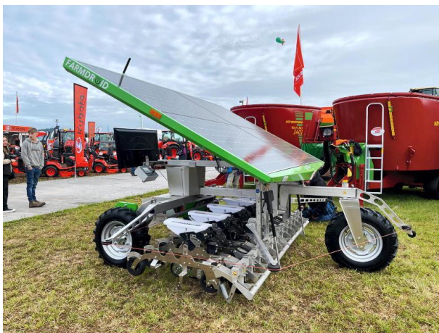
Fig. 1. Solar-Powered Agricultural Machinery

In many developing regions, solar-powered technologies are helping farmers continue agricultural activities even during electricity shortages and fuel price increases.