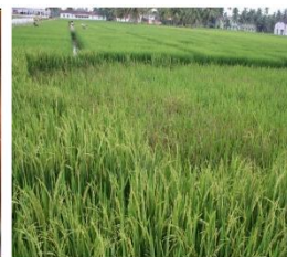
Rice crop damage