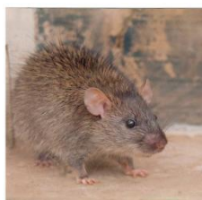
Lesser Bandicoot Rat, Bandicota bengalensis

The rodentia are the biggest order of mammals, with over 2000 species spread across 34 families and 389 genera worldwide, accounting for nearly 40% of all mammal species. In India, rodents are represented by 43 genera, 104 species, and 4 families: Sciuridae, Dipodidae, Muridae, and Hystricidae. Of them, roughly 14 species are economically significant. Rodents having one pair of Chisel shaped 'incisors' on upper and lower jaws characterizes their dentition (Rodere: to grow, dent: teeth (0.4mm/day). Rodents are problem in agriculture, storage and homes.