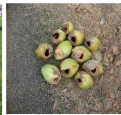
Coconut fruit damage