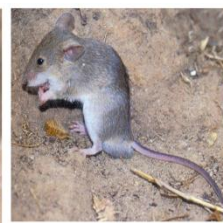
Field Mouse, Mus booduga