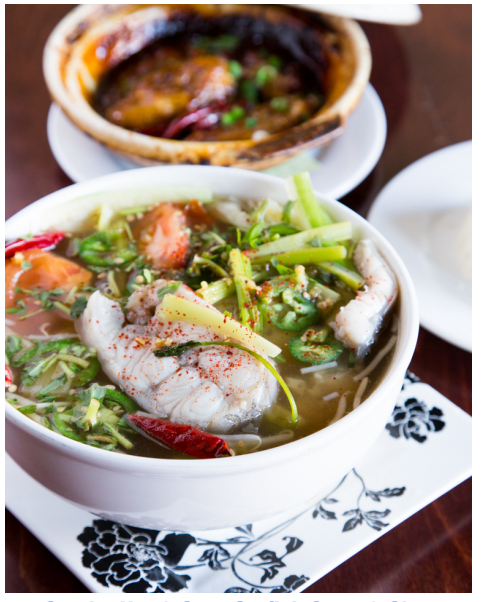
53. Combo Hot & Sour Catfish Soup & Claypot

49. Goi Du Du (Green Papaya Salad with.... Shrimp or BBQ Beef $9.25 / Chicken $8.95 / 5-Spice Chicken $9.95