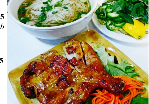
21. Five Spice Chicken Noodle Soup