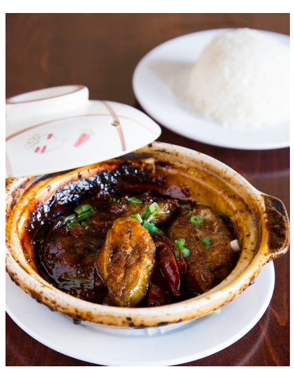
54. Catfish Claypot

64. Bo Luc Lac (Shaking Beef) * Very Tender Cube of Filet Mignon Tossed in Garlic & Onion Served w/ White Rice $13.95 w/ Garlic Noodle $16.00 or