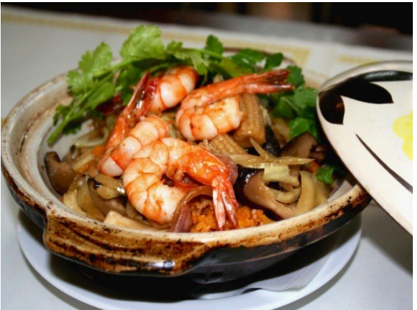
43. (A) Com Bo Kho (Beef Stew w/ Rice)