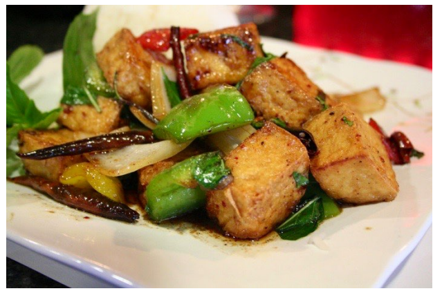
73. Stir Fried Tofu w/ Basil Leaves