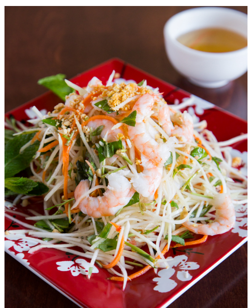
49. Green Papaya Salad w/ Shrimp

$10.50 47. Rau Xao Tom or Thit (Stir Fried Mixed Vegetable w/ Shrimp, Pork or Chicken)