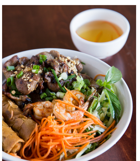
31. Ben Tre Vermicelli Combo

Served over soft rice vermicelli noodle, fresh bean sprout, shredded lettuce, cucumber, crushed peanut, accompanied by our house "Nuoc Mam" sauce.