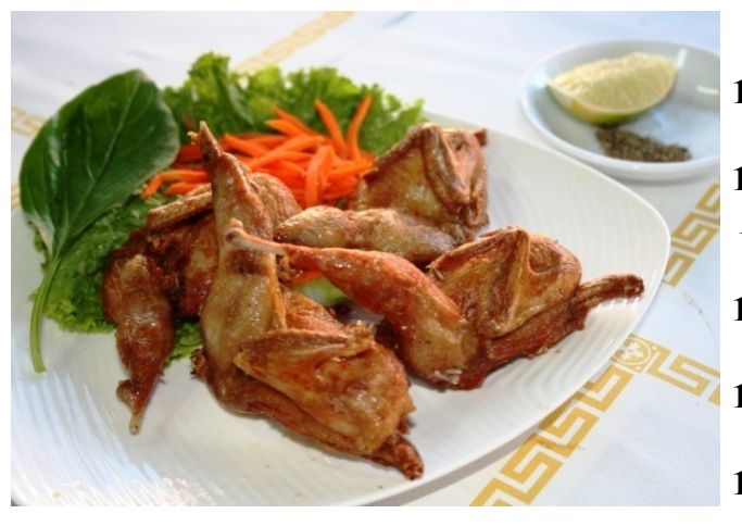
10. Tom La Bot (Crispy Shrimp)