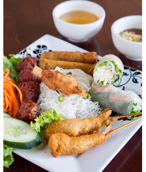
1. Ben Tre Appetizer Combo