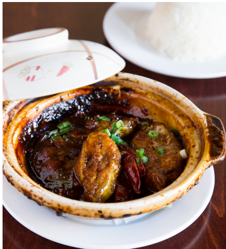
54. Caramelized Catfish Claypot