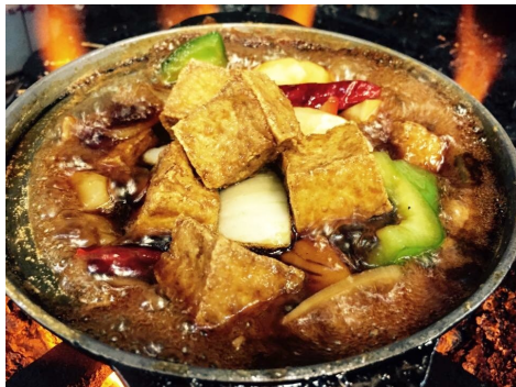
76. Caramelized Tofu Claypot