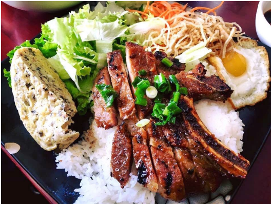
36. Porkchop D (added Meatloaf)

44. Com Chien Dat Biet (House Special Fried Rice) $15.50 Egg, Pork, Shrimp, Imitation Crab Meat & Fish Cake