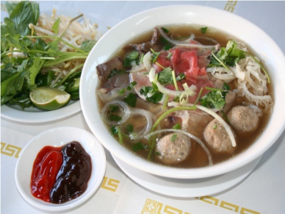
15. Ben Tre Deluxe Pho Noodle Soup

SIDE ORDER: Rare Beef $7.50 / Chicken $3.50/ 5 Shrimps $4 / Meat Ball $4 / Plain Pho Bowl $9(L) / Kid Size $6 / BBQ Meat Plate $9.50 / 5-Spice Chicken $9.50 / + Noodle or Veggie $2.50 / (Broth Container ($3.50 Half / $6 Full)