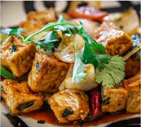
72. Lemongrass Tofu