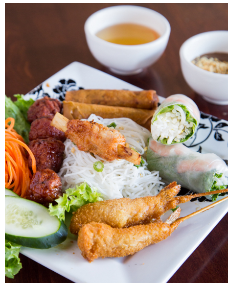
1. Ben Tre Appetizer Combo