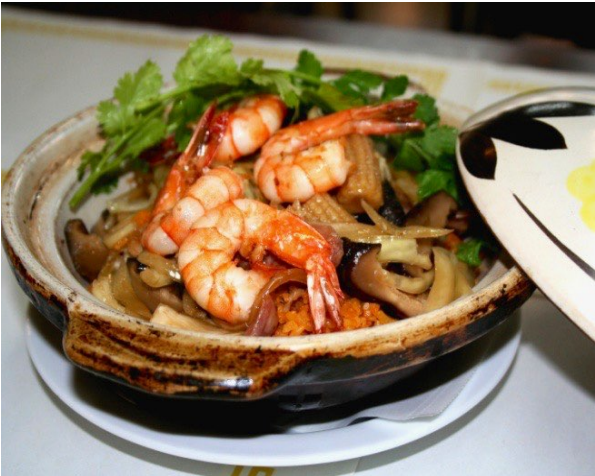
46. Yellow Rice Claypot

45. Ben Tre Com Vang & Thit Dac Biet * $16.50 (Special Yellow-Rice w/ 5-Spice Chicken or BBQ Pork, Beef, Shrimp)