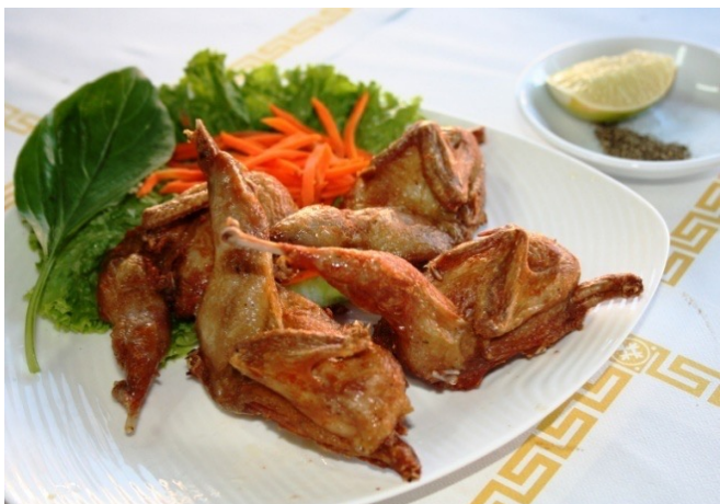
13. Crispy Quails

Finely Ground BBQ Pork Blended w/ Pounded House Spice