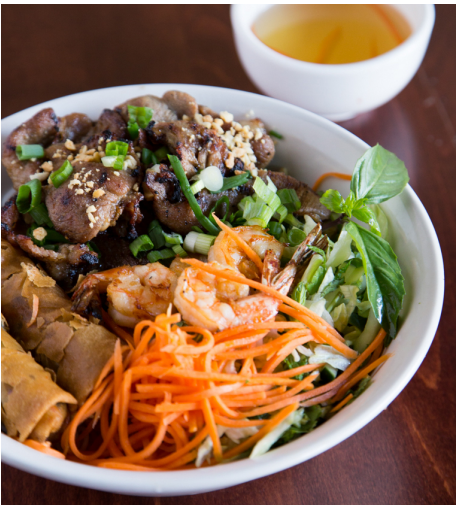
31. Ben Tre Vermicelli Combo