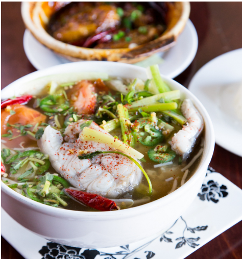
53. Combo Hot & Sour Catfish Soup & Claypot

51. Canh Chua Ca or Tom (Hot Sweet & Sour Catfish or Shrimp Soup) $18.50 Traditional Catfish or Shrimp w/ Fresh Tomatoes, Bean Sprout & Pineapple Stewed in Hot Sweet & Sour Tamarind Broth, Topped w/ Fresh Basil