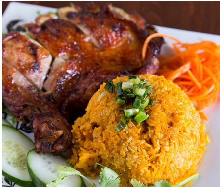
45. Yellow Rice w/ 5-Spice Chicken