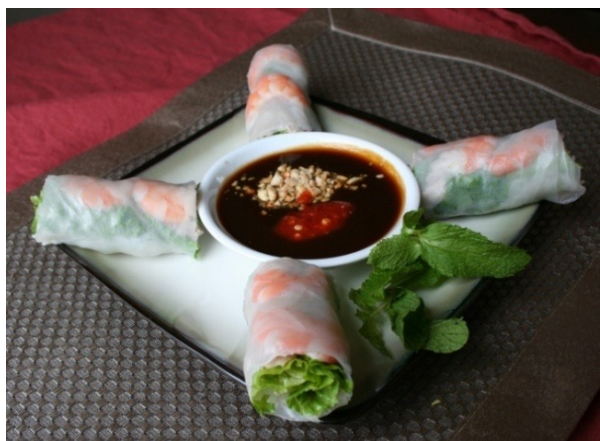
2. Goi Cuon (Fresh Spring Roll)

Deep Fried Roll filled w/ Ground Pork, Carrot, Taro, Onion, Mushroom