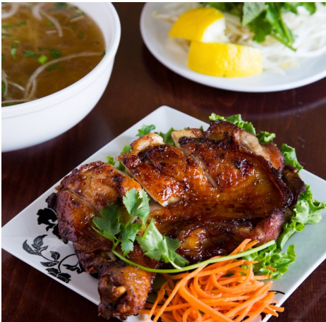
21. Five Spice Chicken Noodle Soup