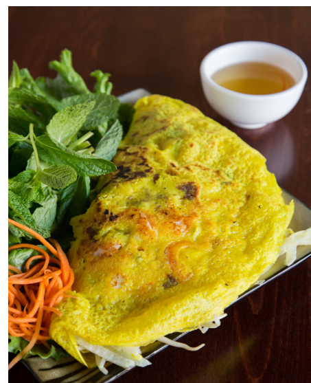
6. Ben Tre Crispy Crepe

Vietnamese Shrimp Paste Wrapped around Stick of Sugarcane