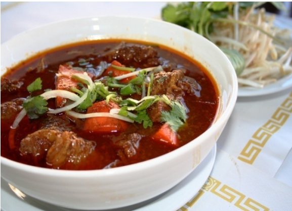
27. Beef Stew Noodle