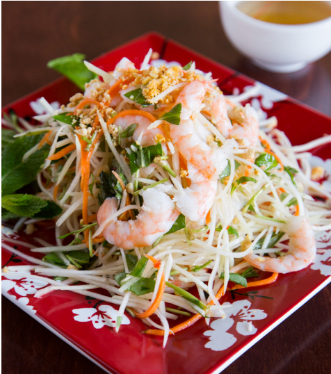
49. Green Papaya Salad w/ Shrimp

50. Ben Tre Salad (Green Papaya, Vermicelli, Shrimp & BBQ Beef) $16.50