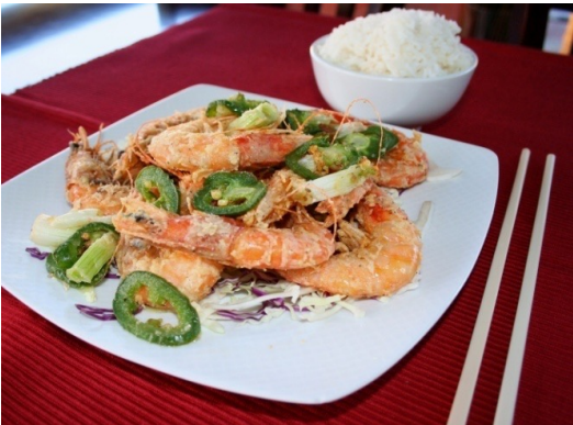
61. Salted & Pepper Shrimp