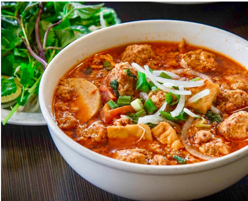
29. Bun Rieu