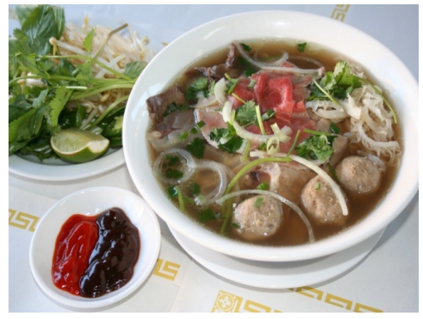
15. Ben Tre Deluxe Pho Noodle Soup

SIDE ORDER: Rare Beef $7.95 / Chicken $3.50 / 5 Shrimps $5 / Meat Ball $4 / Plain Pho Bowl $9(L) / Kid Bowl $6 / 5-Spice Chicken $10.95 / + Noodle / Veggie $2.50 / (Broth Container ($3.75 Half / $6.50 Full)