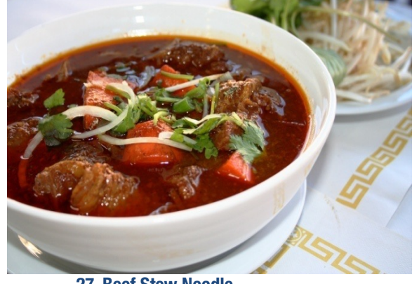
27. Beef Stew Noodle

BBQ Pork, Beef or Shrimp served w/a separate bowl of pho noodle soup.