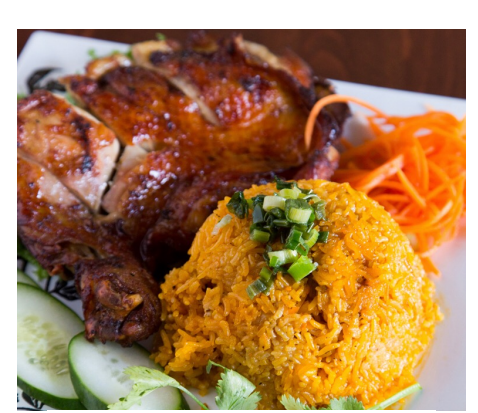
45. Yellow Rice w/ 5-Spice Chicken