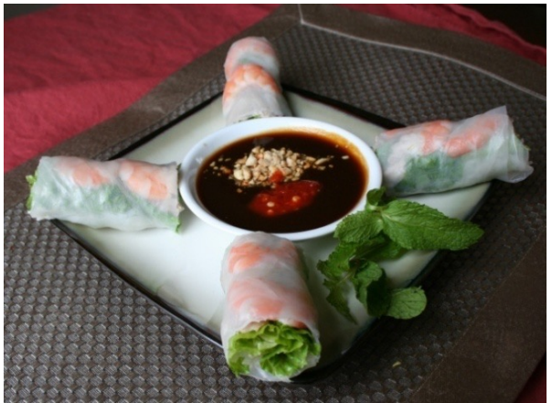
2. Goi Cuon (Fresh Spring Roll)