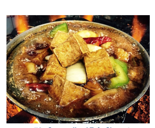
76. Caramelized Tofu Claypot