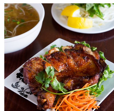
21. Five Spice Chicken Noodle Soup

21. Pho Ga Quay Chao (5-Spice Chicken Noodle Soup) *