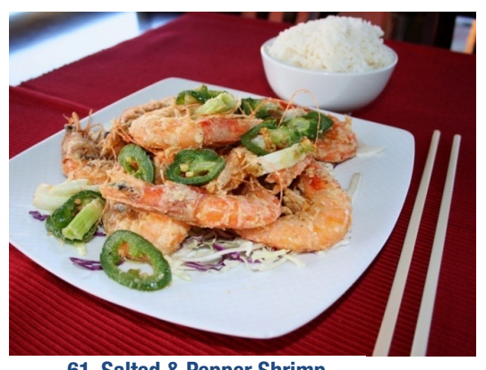
61. Salted & Pepper Shrimp