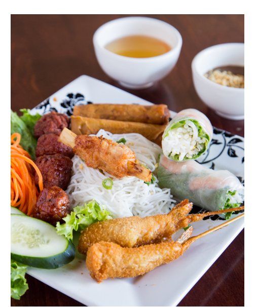
1. Ben Tre Appetizer Combo