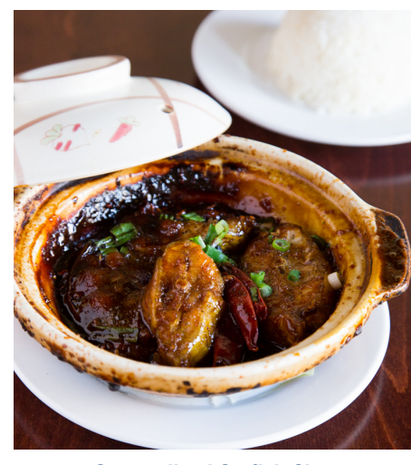
54. Caramelized Catfish Claypot