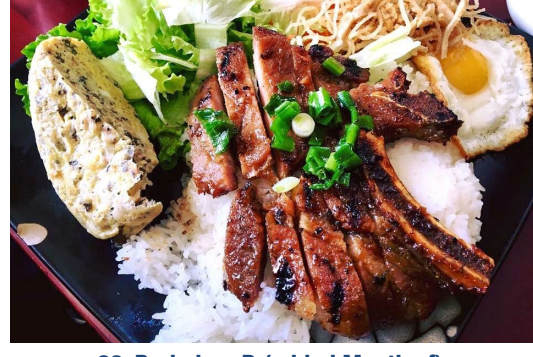
36. Porkchop D (added Meatloaf)

44. Com Chien Dat Biet (House Special Fried Rice) Egg, Pork, Shrimp, Imitation Crab Meat & Fish Cake