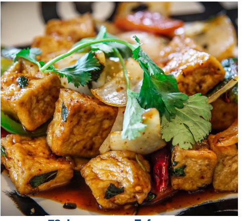
72. Lemongrass Tofu