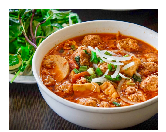
29. Bun Rieu

30. Bun Bo Hue (Beef Lemongrass SPICY Vermicelli Soup) (GF) $17.95 Thinly sliced beef brisket, Vietnamese ham, tendon, vermicelli in lemongrass broth, & pork blood cube is optional) (+ 5 shrimps $4)