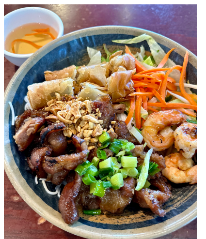
31. Ben Tre Vermicelli Combo