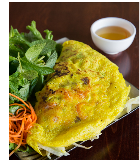
6. Ben Tre Crispy Crepe