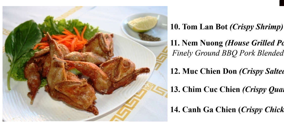
13. Crispy Quails