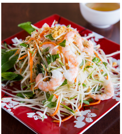
49. Green Papaya Salad w/ Shrimp