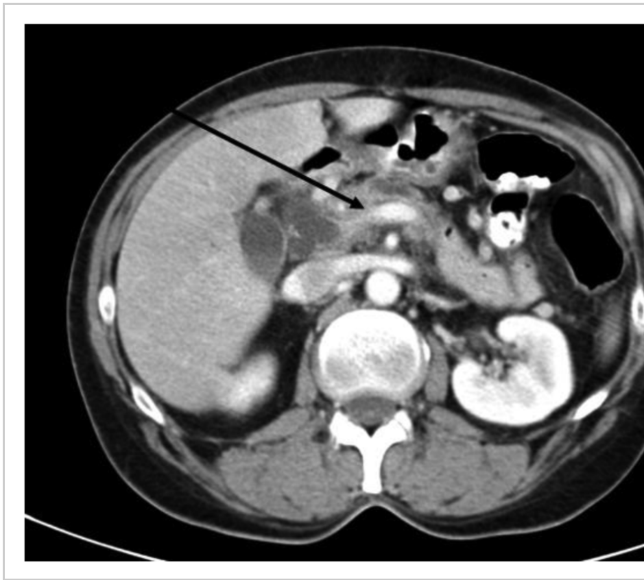
Figure 2. CT scan showing pancreatic head cancer with infiltration of the portal vein confluens (black arrow). Technically resectable finding (partial duodeno-pancreatectomy with segmental

Depending on the localization and growth pattern of the tumor, two types of adherence or infiltration of vascular structures need to be regarded: Venous vessel involvement of the superior mesenteric and/or portal vein and involvement of the celiac trunk or the superior mesenteric artery as the major upper GI arterial vessels ( Figure 2 ).