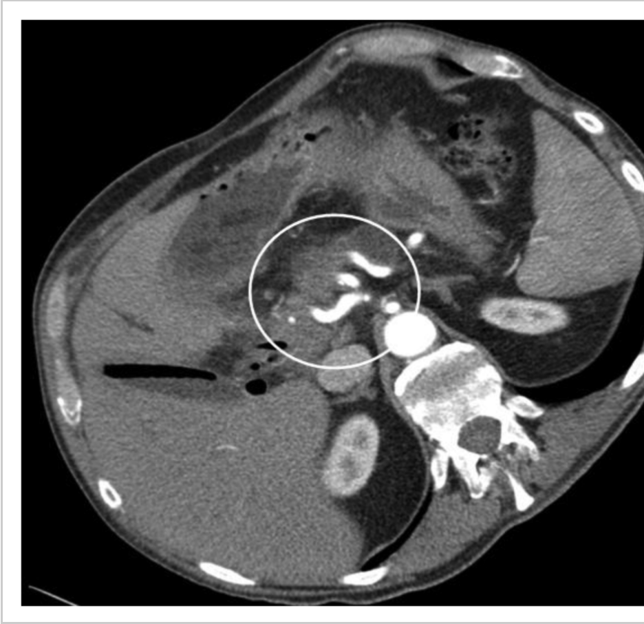
Figure 3. CT scan showing pancreatic head cancer with infiltration of the celiac trunk. Infiltration of common hepatic, left gastric and splenic artery (white circle, left, middle and right vessel). Technically not resectable finding.

mesenteric artery must be regarded as a symptom of biologically aggressive tumor spread. Therefore, decision to perform a surgical resection in this situation is a highly individual decision. The resection of the celiac axis or the superior mesenteric artery has been performed since the 1970s in selected patients but is still regarded as an extraordinary approach in PDAC surgery [62-65].