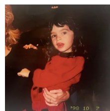
DANG GOOD SATURDAY