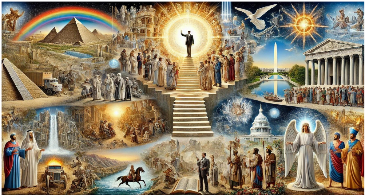
Statement on the Profound Insights of the Book of Jubilees