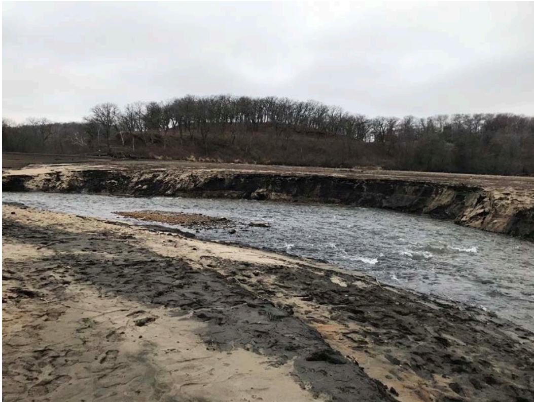
Figure 3: Photo of the channel collected on 11/25.

5-year 24 hour rainfall event is 3.79 inches (USGS Streamstats) and the 5-year recurrence interval bankfull discharge is 2314 cfs (Inter-fluve 2017). However, these values are only rough estimations of when sediment release will occur during the 'event-driven' phase since numerous other factors such as vegetation establishment, impounded sediment cohesiveness, and channel armoring will influence sediment release timing.