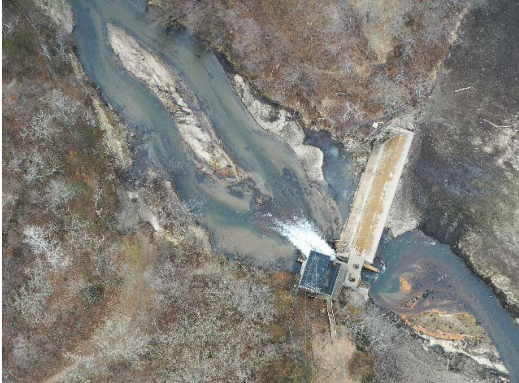
Figure 4: Drone image collected on 12/11 above the Powell Falls dam showing bar development immediately downstream.