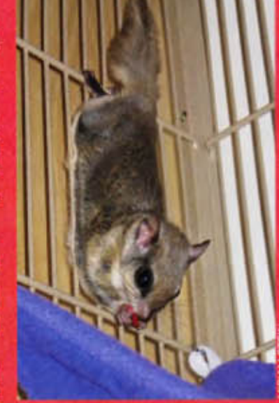
or pair of flying squirrels, a Owning a flying squirrel is a longcage that is minimally 2 by term commitment, because they

Habitat: To safely and responsibly house a single 2 feet with 1/2-inch bar can live for 10 to 15 years. spacing is required. Bigger