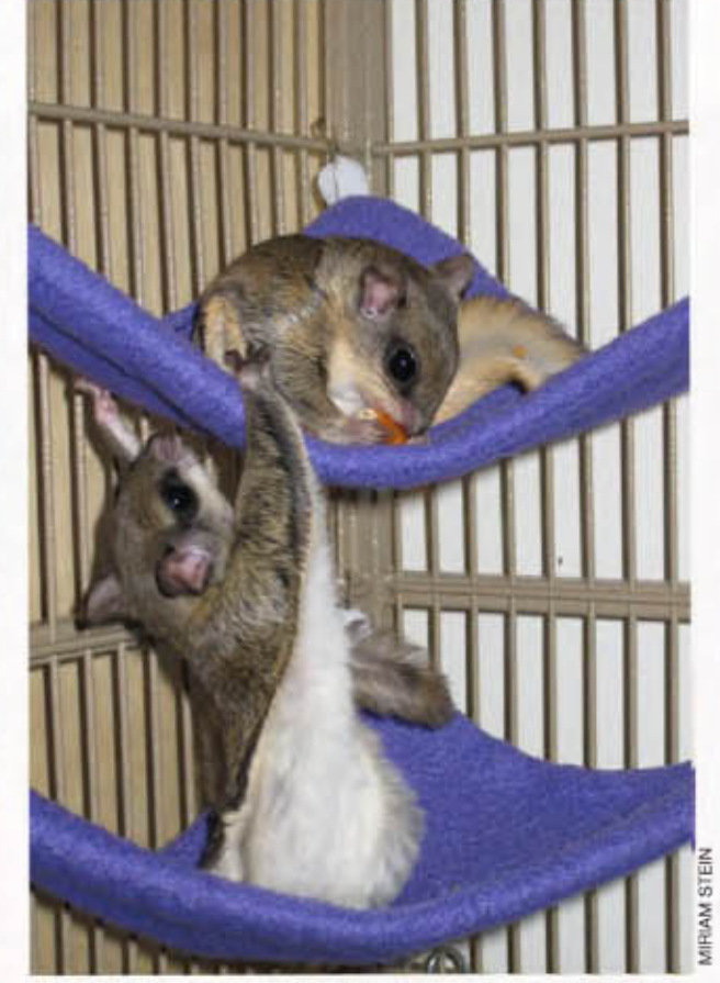
Flying squirrels are able to glide because of the flap of skin that connects their wrists to their ankles.

When they do show fondness for a particular food, it is with an enthusiasm that tickles the soul. Flyer parents are often inspired to create fancy buffets of organic produce, blend smoothies and even stir-fry dinner for their furballs. After all of this work, your adult flyer will likely not even stick around to let you pet its soft fur. It has places to go and