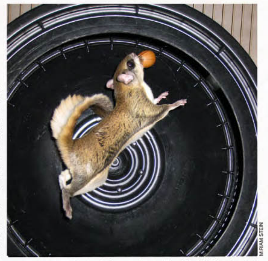
Flying squirrels are curious, active animals that love to stash food, and sometimes they combine their exercise with their food stashing!

It is unclear how flying squirrels maintain healthy levels of vitamin D and calcium in the wild given their nocturnal tendencies, but they are prone to a deadly deficiency in captivity. You must supplement your flyer's