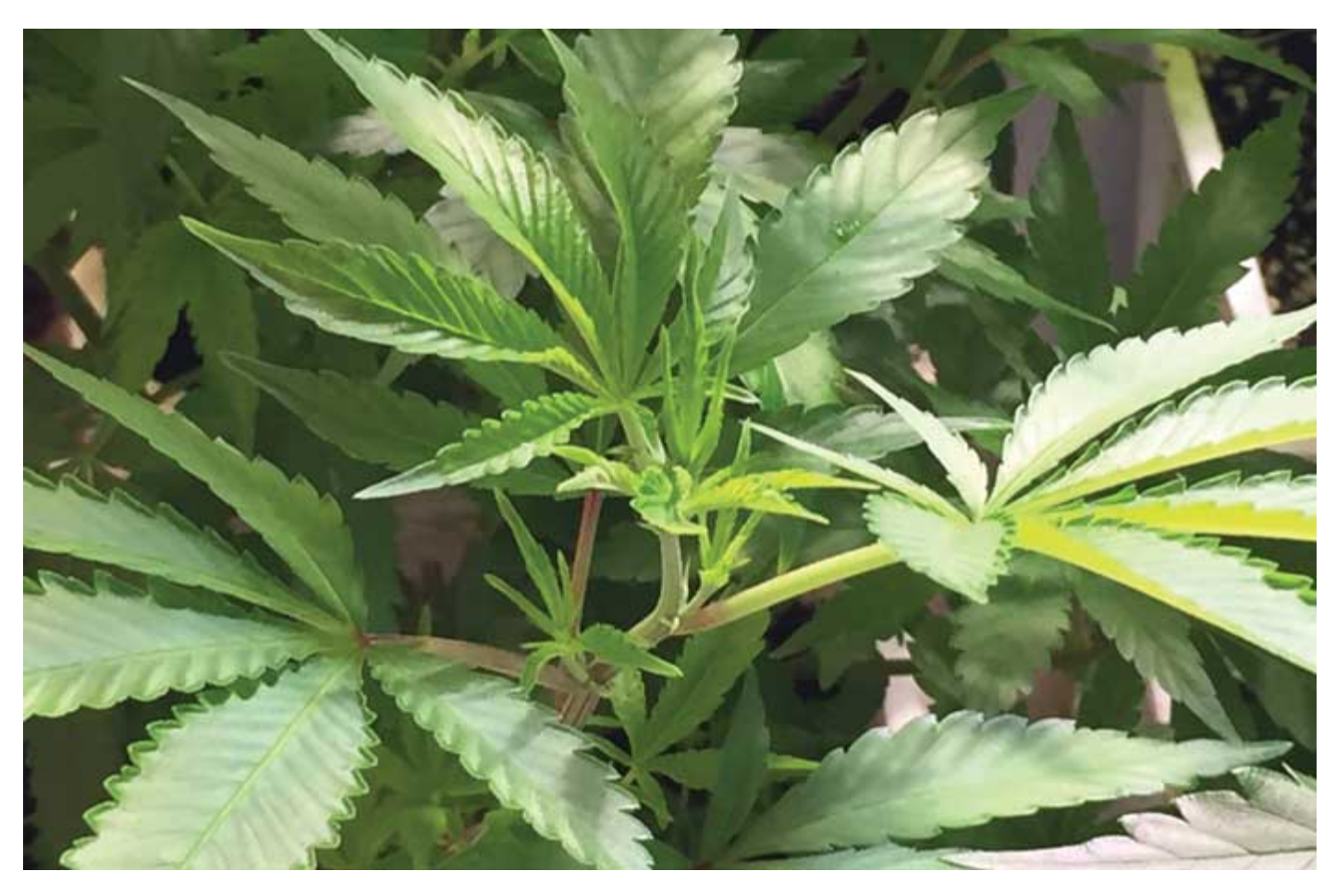
Legal marijuana in question