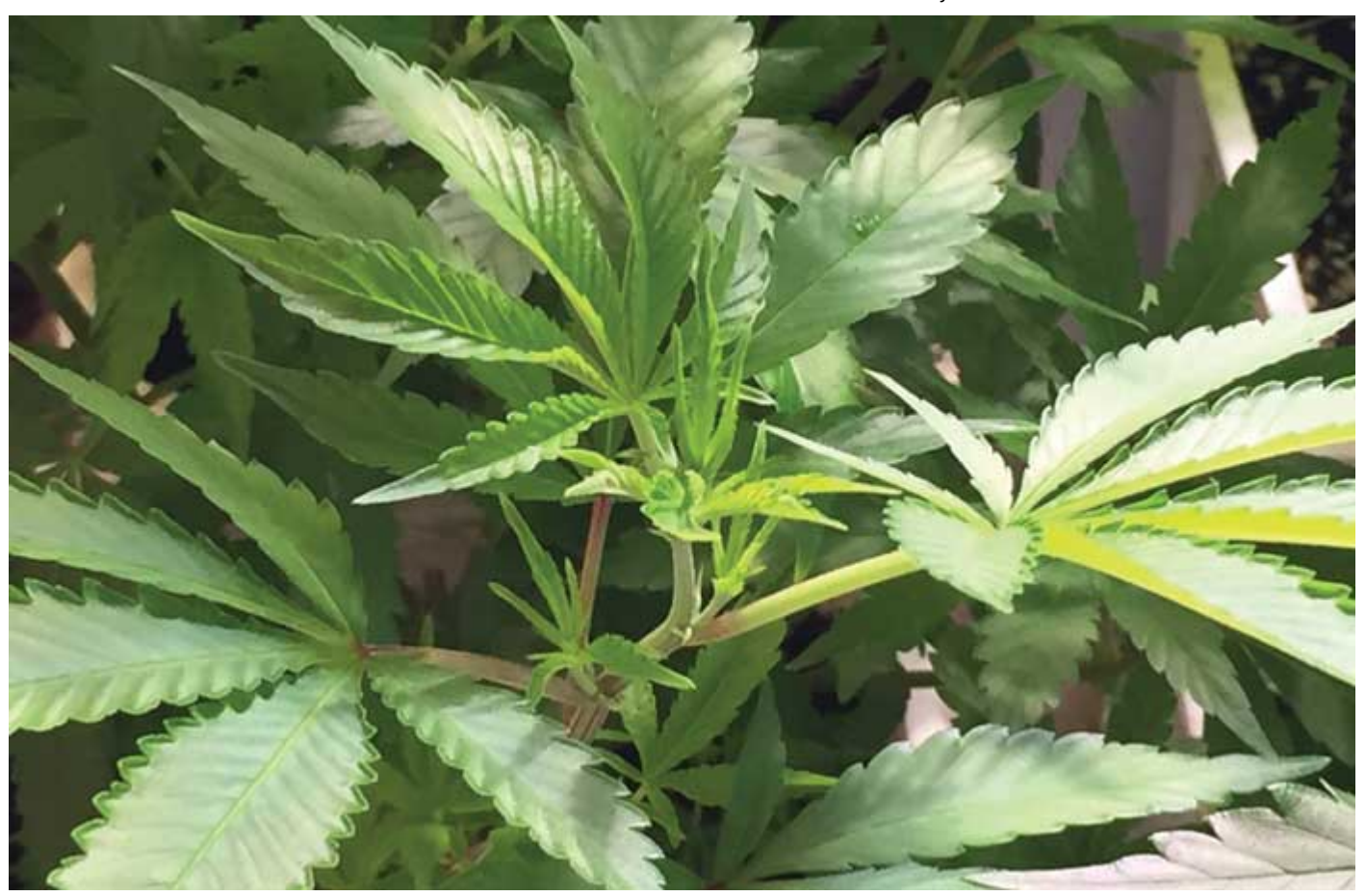
Legal marijuana in question