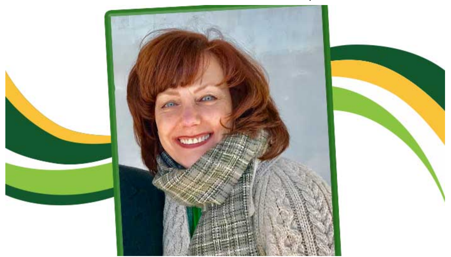
Meet BBP's grand marshal