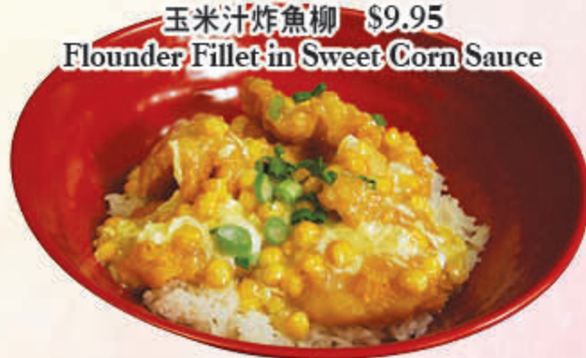
玉米汁炸魚柳 $9.95 Flounder Fillet in Sweet Corn Sauce