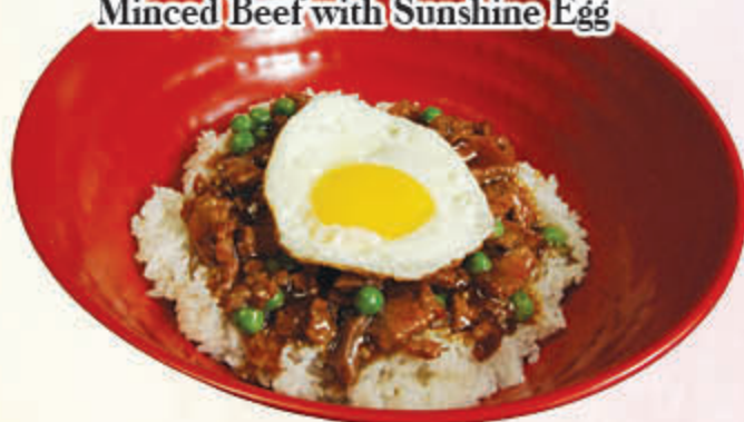
青豆粒牛肉煎蛋 $9.95 Minced Beef with Sunshine Egg