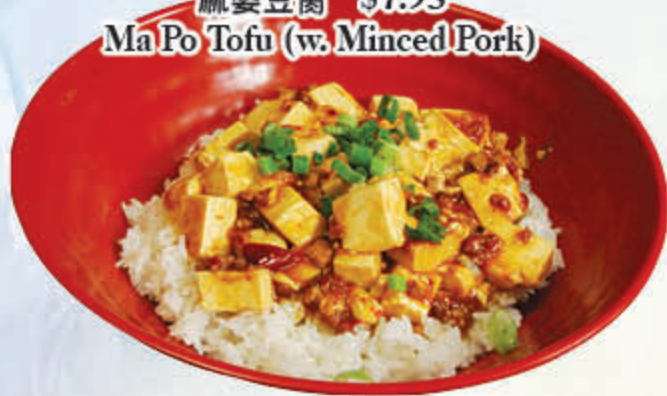
麻婆豆腐 $7.95 Ma Po Tofu (w. Minced Pork)