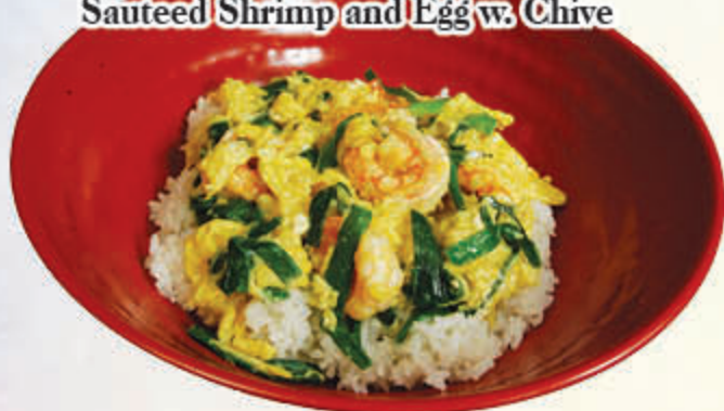
韭菜鮮蝦炒蛋 $9.95 Sauteed Shrimp and Egg w. Chive