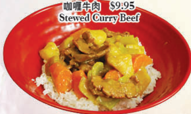
咖喱牛肉 $9.95 Stewed Curry Beef