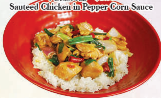
干鍋麻辣雞 $8.95 Sauteed Chicken in Pepper Corn Sauce