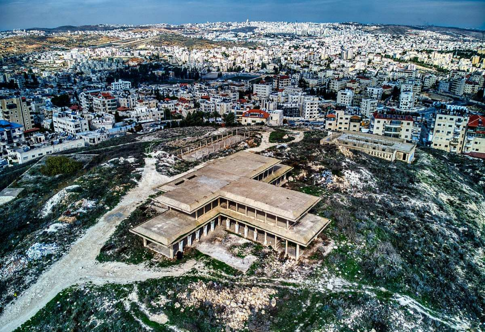
Ruins of Saul's palace in Gibeah