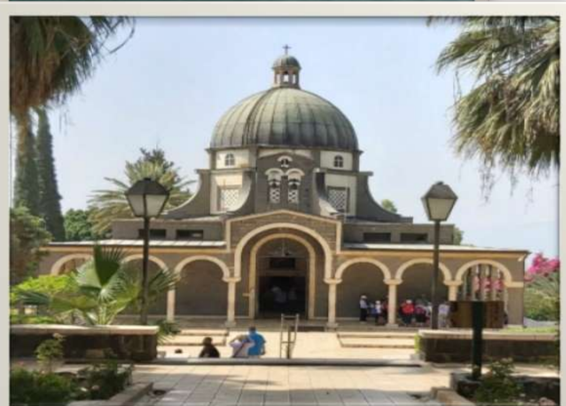
Mount of Beatitudes where Jesus delivered the Sermon on the Mount