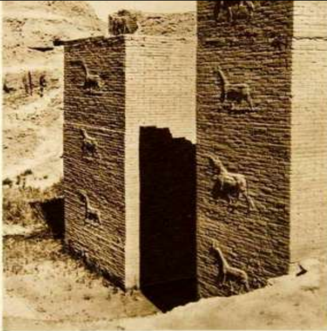
THE ISHTAR GATE, BABYLON